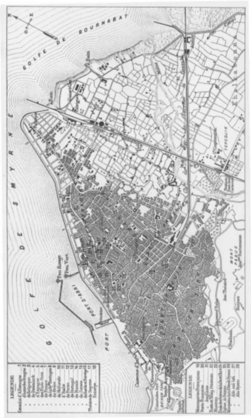
Figure 2 The port and city of Izmir, from D. Georgiades, Smyrne et l'Asie Mineure au point de vue économique et commerciale (Paris, 1909)