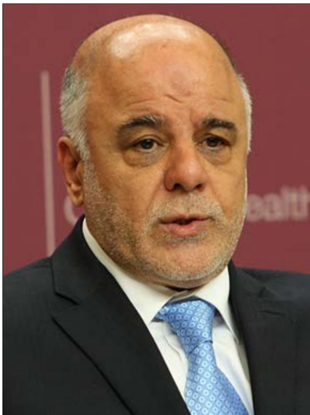
Iraqi Prime Minister Haider al-Abadi.

It is easy to see why some may argue for directly arming certain Sunni tribes, a la Sons-of-Iraq. That plan, of course, comes with its own long litany of pitfalls, including