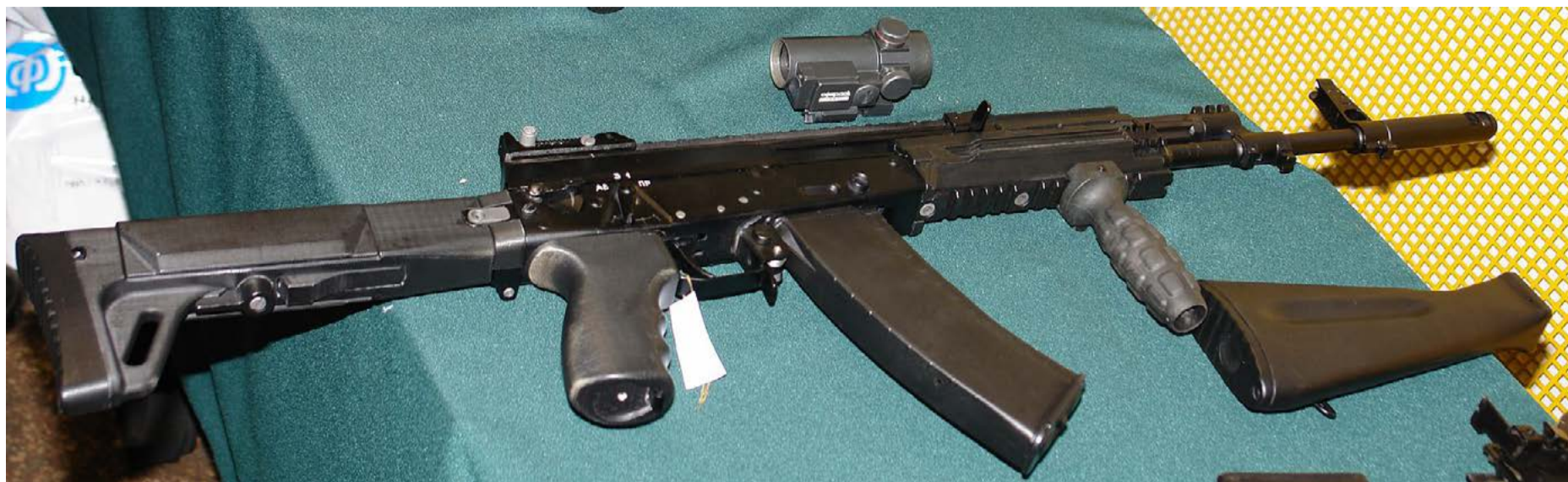
The AK-12 rifle