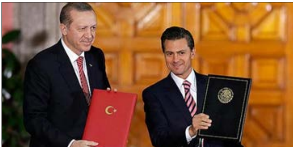
Turkish President Erdoğan and Mexican President Enrique Peña Nieto after signing a bilateral agreement on February 15, 2015.

Source: http://www.todayszaman.com/diplomacy_president-erdogan-cuts-short-official-latin-american-visit_372501.html