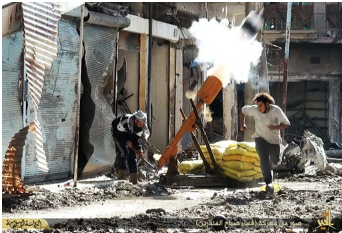
Islamic State IRAM, Dayr az Zawr. 12/19/14.

Rebels have also employed the Internet and social media to help revive aging