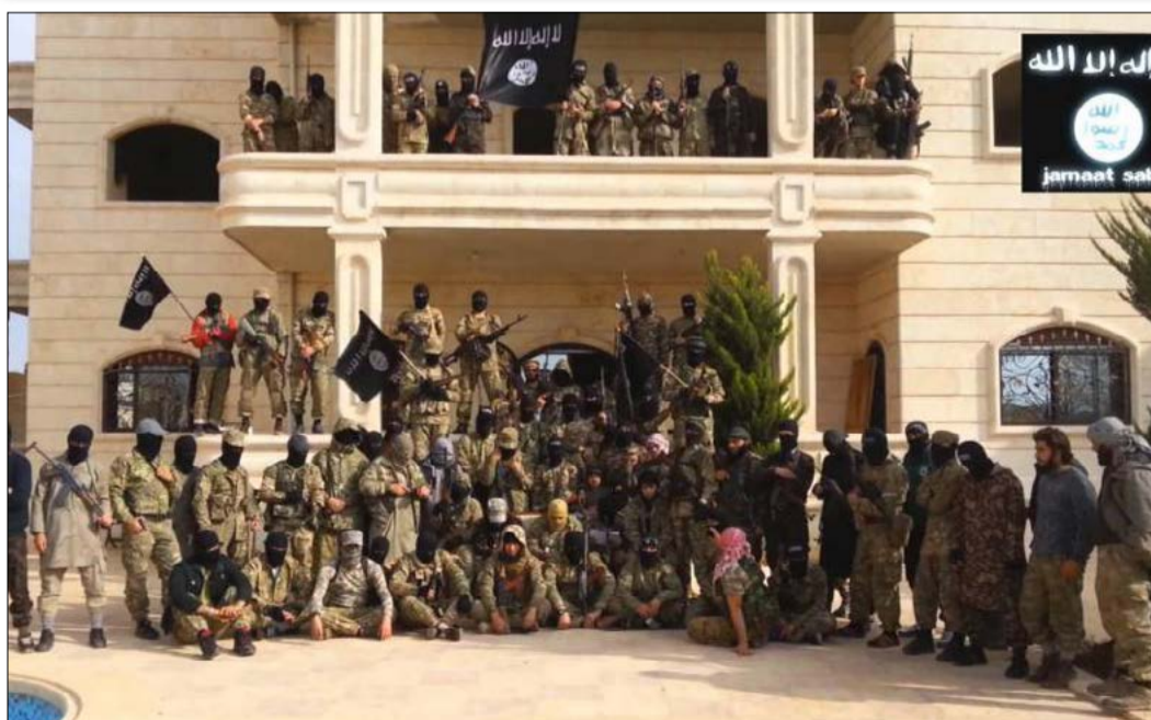
“Groups like Jamaat Sabiri (pictured) fighting in Syria reportedly include members from Central Asia (largely Uzbeks and Tajiks), though exact numbers of people from the region is unknown.”