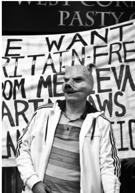
Photo: English Defence League member intimidates Muslims

Islamophobia is real, let us work together to stop it.