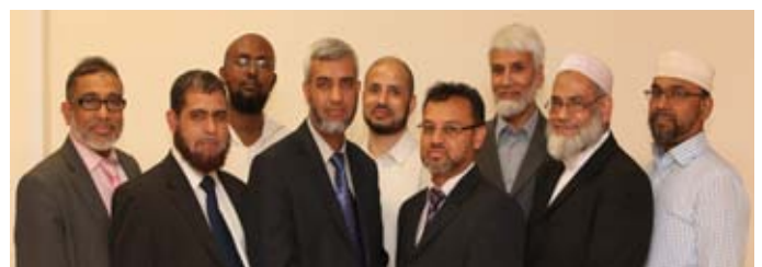
Picture: Newly elected Board of Trustees (2013-2015)

I will end by saying it is our collective duty to help change perceptions for the better; whether that is our perceptions of others; or others' perceptions of us. It is my hope to see Muslims in the UK flourishing and overcoming barriers that limit our community from moving forward. It is my wish that the East London Mosque Trust should always be at the forefront of our community, as a shining example of what it means to be part of society; to engage with others, to influence and change negative stigmas, so that one day when history is written about our time, we can be described as being instrumental to positive change that affected the lives of others constructively.