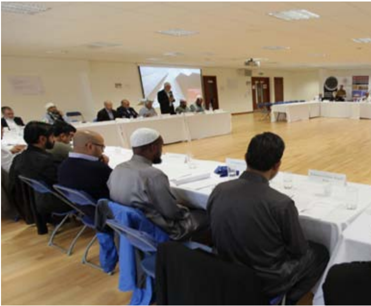
Picture: Trust members attend 54th Annual General Meeting

The East London Mosque Trust held its 54th Annual General Meeting on 29th September 2013. At the AGM, Trustees were elected to serve a new two-year session. The new Board of Trustees for 2013-15 session are: