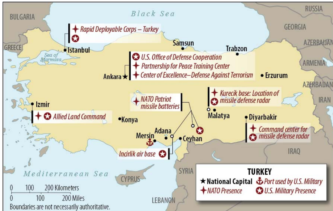
Figure 2. Map of U.S. and NATO Military Presence in Turkey