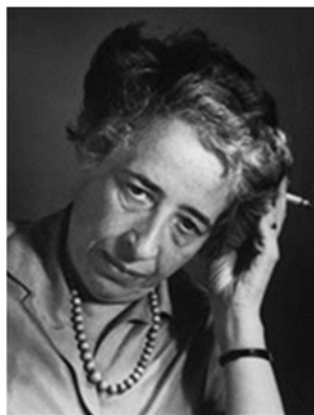
Hannah Arendt, elected 1962.

Career description: Economist; Educator Current affiliation: Same