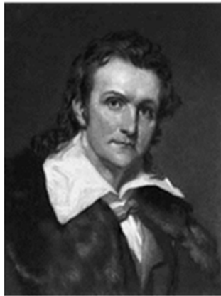
John James Audubon, elected 1830.

Auchincloss, Louis Stanton (1917-2010) Election: 1997, Fellow Affiliation at election: New York, NY Residence at election: New York, NY Career description: Writer (novelist, short story writer); Lawyer