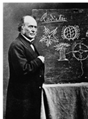
Jean Louis Rodolph Agassiz, elected 1846, FHM.

Career description: Businessperson; Science patron