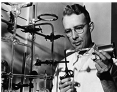
Luis Walter Alvarez, elected 1958.