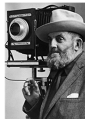
Ansel Easton Adams, elected 1966.