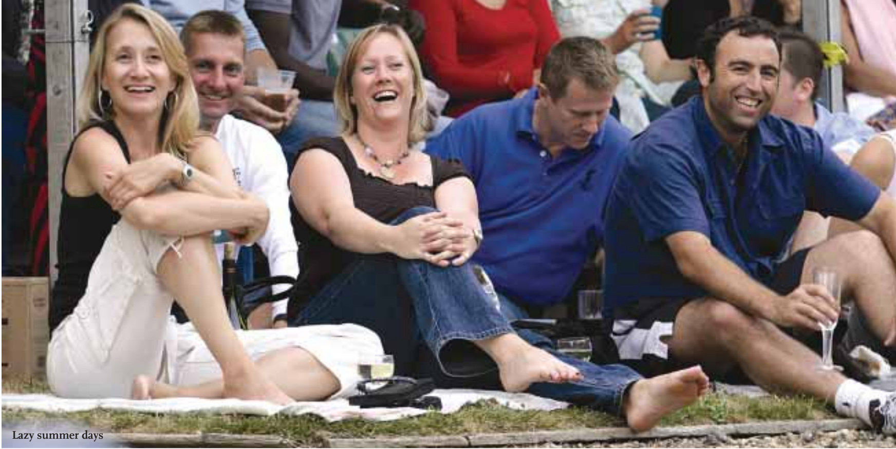
Lazy summer days