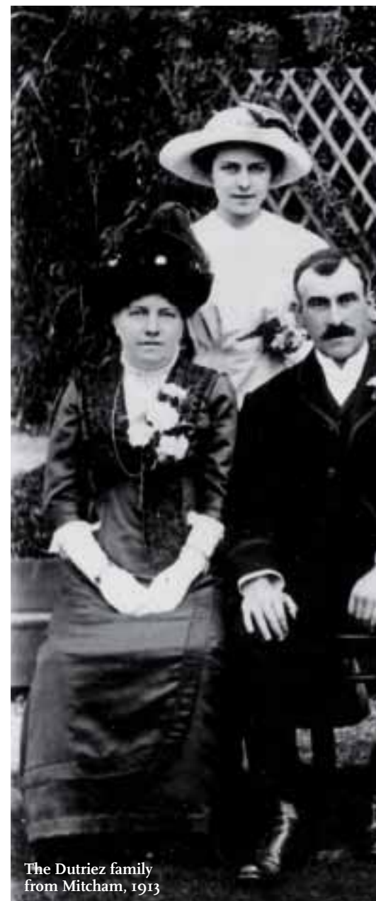
The Dutriez family from Mitcham, 1913

The family attic might contain other documents that could prove helpful. Old diaries and letters might reveal geographical locations useful for basing your research around.