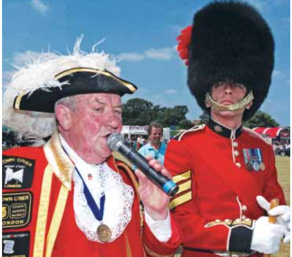
Mitcham Carnival 2006

To take part in the parade or to book a stall, please call 020 8545 4888, or email mitchamcarnival@merton.gov.uk