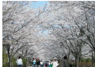
Cherry blossom viewing

Japanese zelkovas holds a swing, slide, sandbox, and other equipment. A pool administered by Hachioji City is also nearby (fee required for pool use).