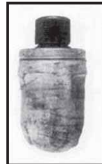
Fig. 1. Photograph of the spare grenade.

However, sudden cardiovascular collapse and coma occurring several days after surgery in a young, previously healthy patient without long bone fractures suggests a pulmonary embolism with acute cor pulmonale and brain anoxia. In the absence of important data, however, this diagnosis