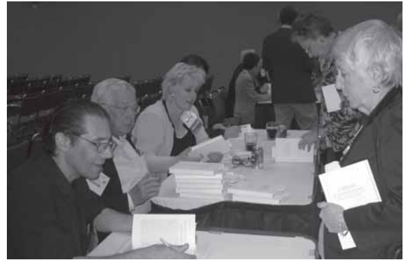
WLM Activities including Friends Tea, Book Signing and Board of Trustees Dinner