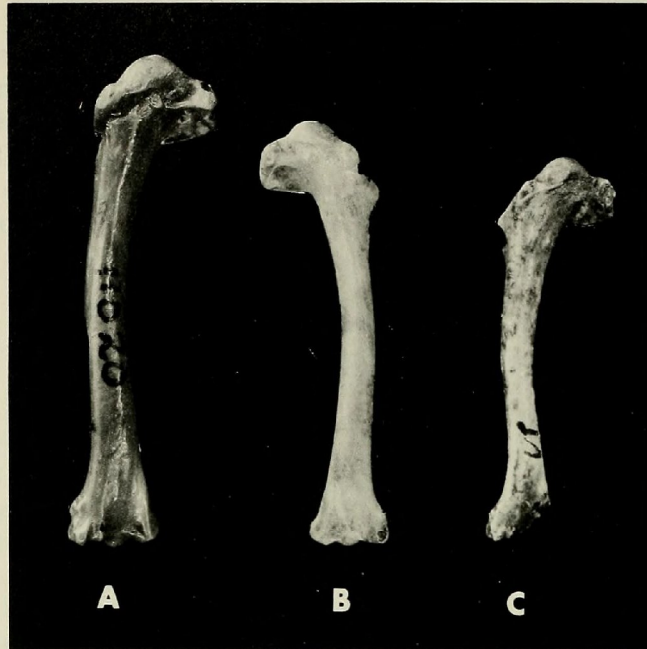
Fig. 3. Humeri in anconal view. A, Siphonorhis americana (AMNH 11020); B, S. daiquiri , new species (AMNH 21905); C, S. brewsteri (USNM 336511). 2× natural size.

however, as a popular rum drink reputed to have been invented by a cyceonologist (Greek, kykeon , a mixed drink), who named it after his home town. In the present usage it is a noun in apposition.