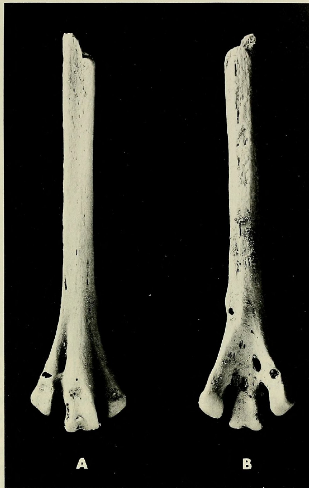
Fig. 1. Distal half of right tarsometatarsus, holotype of Siphonorhis daiquiri , new species (USNM 336506). A, Anterior view; B, Posterior view. 6× natural size.

The absence of the genus Siphonorhis in Cuba has not drawn comment from ornithologists, possibly because several other birds have a similar pattern of distribution, being found in Hispaniola and Jamaica but not in Cuba, viz: cuckoos of the genus Hyetornis , the potoo Nyctibeus griseus , and the swallow Kalochelidon euchrysea . Whatever the cause may be for the distributional patterns of those species, the pattern of Siphonorhis is the result of its having been overlooked in Cuba, for fossil remains from two cave deposits now prove the existence of a hitherto unrecognized species of Siphonorhis on that island.