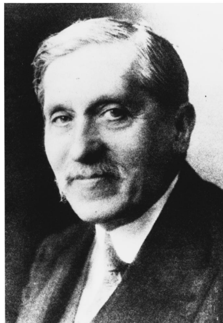
Fig. 1. Charles Fabry (1867–1945).

The subject on which we began to work had occurred to me, partly by chance, following an observation in an electrical problem. A young physicist who was working with me wished to