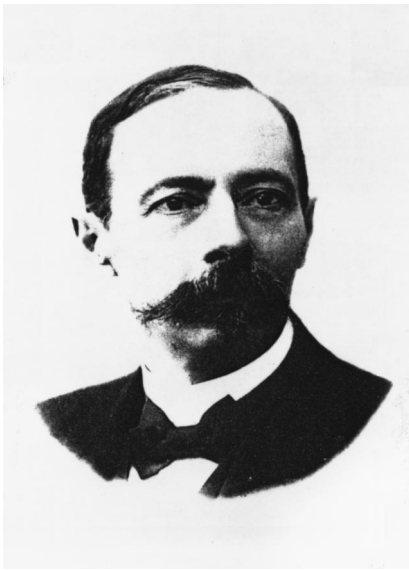
Fig. 3. Alfred Pérot (1863–1925).