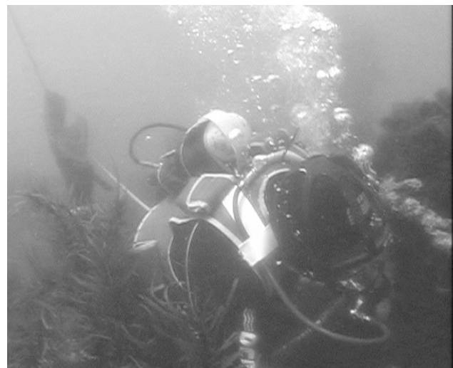
Figure 4. Diver swimming across kelp. Note the air supply hose going to the top left-hand corner, bail out bottle on his back, buoyancy compensator and full face mask.

diving to about 15 m (50 ft), but I know of other divers who start their diving at around 30 m (100 ft) and work into the shallower water though the day.