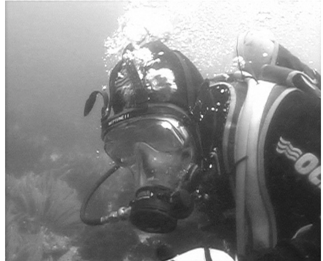
Figure 3. Close up of G Pollard underwater, showing full face mask containing communications equipment.

Today we use a shot line that to drop another bag down, and we stay on the bottom till lunch time and just carry on, which limits the number of ascents. I limit my