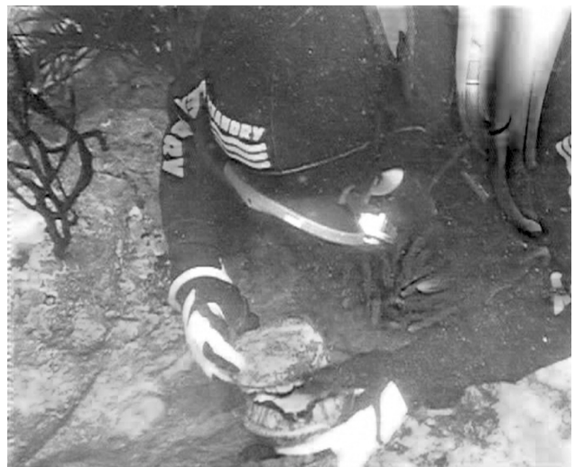
Figure 2. Abalone in diver's hand.

hand would give him another bag and he would descend. This happened every half hour to an hour, depending on the stocks on the bottom and would continue all day. And so all day it was up and down, up and down. A pretty good dive profile, for trouble, really!