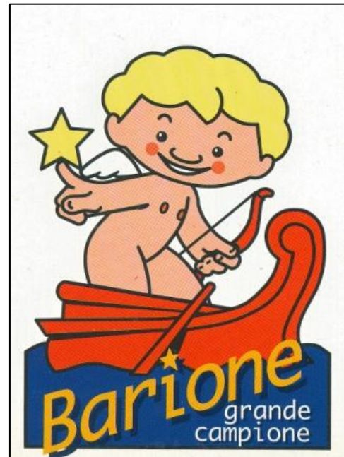
La Mascotte des JM de Bari 1997