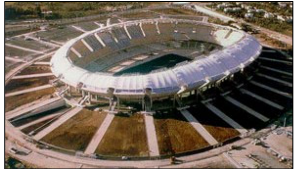
Le Stade San Nicola de Bari