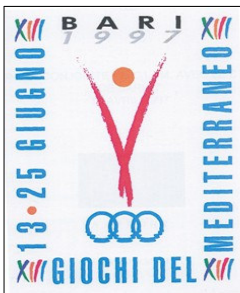
Affiche officielle des JM de Bari 1997