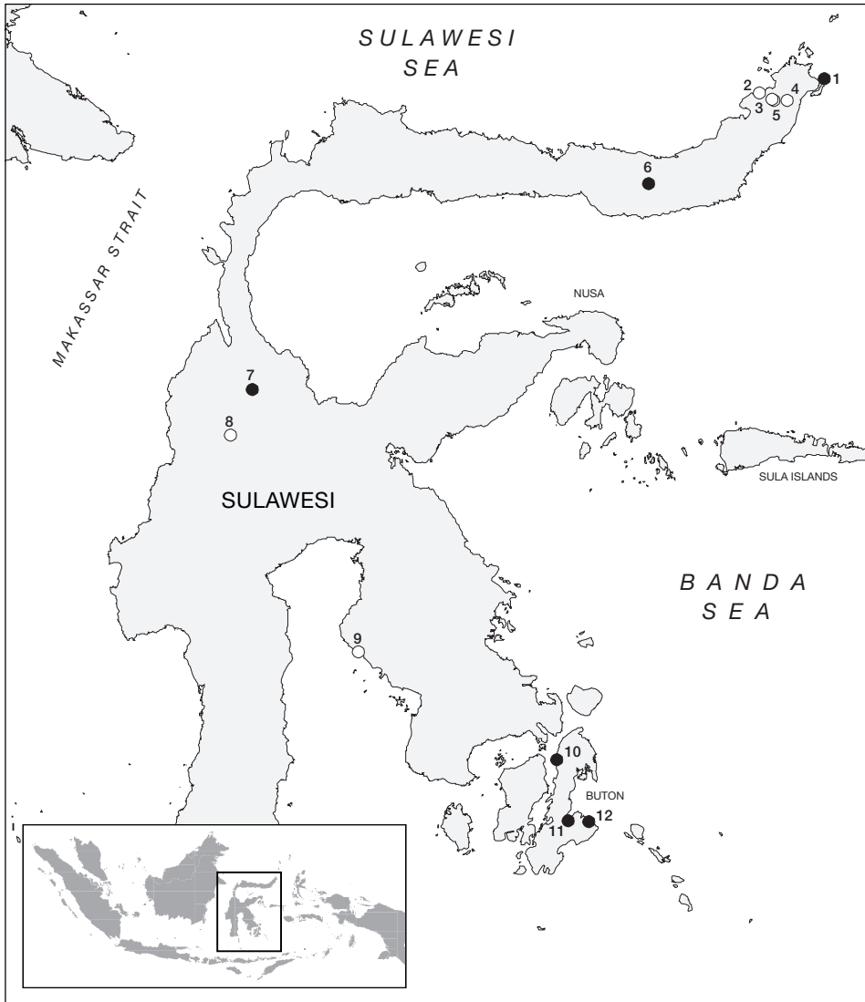
The distribution of Snoring Rail Aramidopsis plateni : (1) Tangkoko Nature Reserve; (2) Ranotongkor; (3) Rurukan; (4) Tanggari; (5) Tomohon; (6) Bogani Nani Wartabone National Park; (7) Lore Lindu National Park; (8) Kantewu; (9) Wawo; (10) Maligano; (11) Laweli; (12) Lasalimu.

ECOLOGY Habitat The species's known habitat comprises dense second growth dominated by lianas and bamboo, with intersecting brooks, on the borders of tropical lowland evergreen and lower montane rainforest from sea-level to 1,000 m (Stresemann and Heinrich 1939–1941, White and Bruce 1986, Andrew and Holmes 1990, Collar et al. 1994); local reports of secondary scrub near rice-fields (Watling 1983b) may be mistaken (see Remarks 4). Streams and very dense undergrowth have been indicated as critical habitat features, in response to the discovery of birds (and what they eat: see Food) in so-called djoramé (bush and elephant