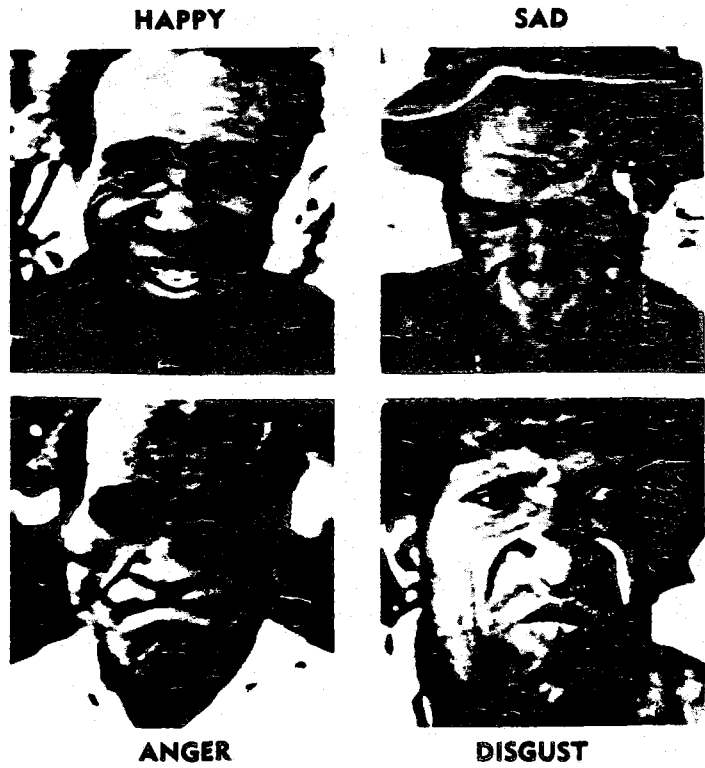
FIG. 5. Video frames of attempts to pose emotion by subjects from the Fore of New Guinea.