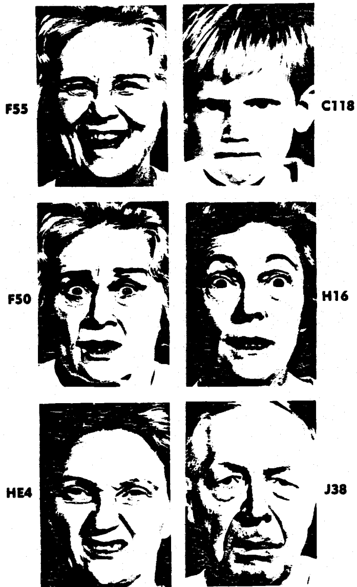
FIG. 4. Photographs from Tomkins's series utilized in cross-cultural research; observer norms on these faces reported in Table 4.