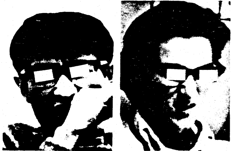
FIG. 3. Video frames of facial behavior scored by FAST as showing disgust; a Japanese subject on the left and a U.S. subject on the right.