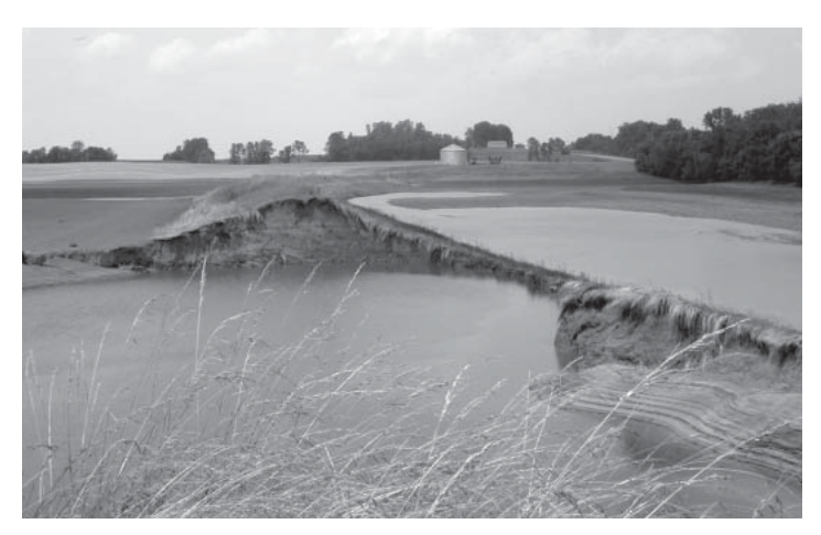
Levee breach near Newberry, Indiana

Floodwaters affected more than 25,000 people in Indiana as flood damages exceeded $1 billion. The devastation left behind in the flood's wake was extensive and affected roads, railroads, homes, businesses, hospitals, dams, parks, flood protection works, and water and gas utilities. Mudslides occurred in Morgan, Owen, and Johnson counties. This was the largest agricultural disaster to strike Indiana, affecting about 9 percent of the state's farmland.