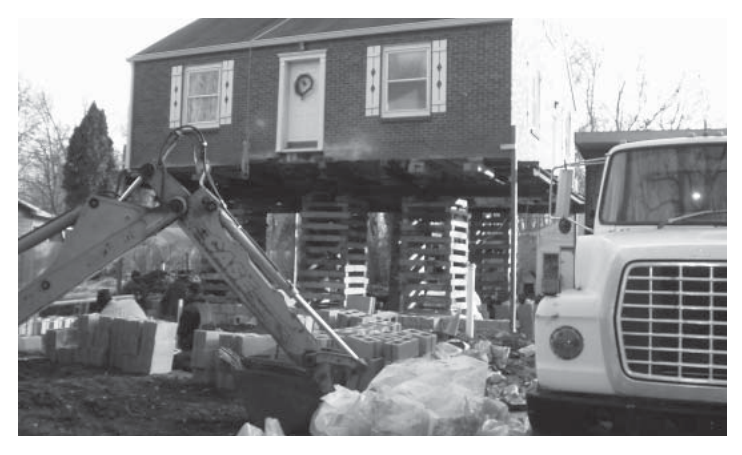
Indianapolis elevation project in process

If this information is not available, the applicant or local permitting officials should contact DNR in writing requesting this information. Once DNR has