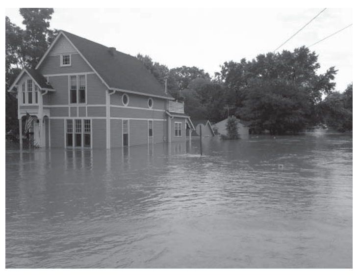
Flooded home in Franklin, Indiana

According to the NFIP's Flood Insurance Manual, the 1-percent-annual-chance flood is one that has a 1-percent chance of being equaled or exceeded in any given year. Formerly called the "100-year flood," the 1-percent-annual-chance flood is synonymous with "base flood."