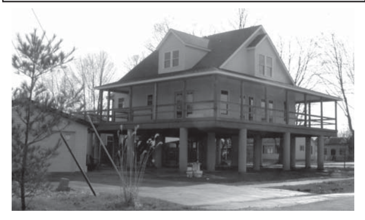
Completed elevation project in Spencer

The Flood Control Act is specific to the floodways in Indiana where the upstream drainage area from a given site is greater than one square mile. The floodway is the portion of the floodplain that carries the peak flow of floodwaters during a flood event - being more hazardous than the remaining portion of the floodplain located outside the floodway (called the flood fringe) because of higher velocities. For both State and Federal regulatory purposes, the frequency of flood adopted to determine the limits of the floodway, flood fringe, and overall floodplain, is the 100-year flood. The 100-year flood is more accurately described as the 1-percent-annual-chance flood, having a 1-percent chance of occurring in any given year. As shown in the beginning of 2008, this magnitude of flood can occur more than once in a year and can certainly be exceeded.