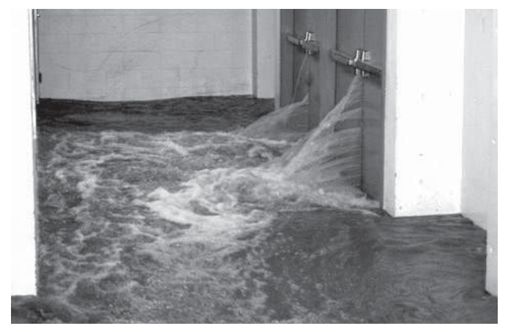
Floodwaters pouring into Columbus East High School Gymnasium

patients. Schools and businesses were not spared either. Floodwaters poured into the gymnasium of Columbus East High School. At Columbus, the East Fork White River went from lowland to record flooding in six hours.