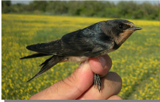
Barn Swallow. Spring. Juvenile (26-VI).