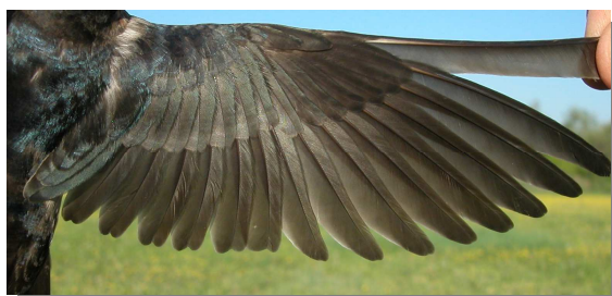
Barn Swallow. Spring. Juvenile: pattern of wing (26-VI).