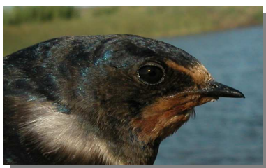
Barn Swallow. Autumn. Head pattern: top adult male (24-VIII); middle adult female (24-VIII); bottom 1st year (24-VIII).