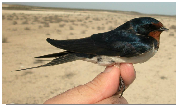
Barn Swallow. Spring. Adult. Female (29-III).