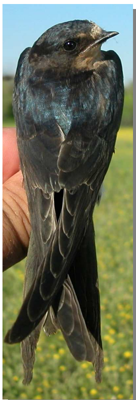
Barn Swallow. Spring. Upperpart pattern: top left adult male (29-III); top right adult female (29-III); left juvenile (26-VI).