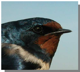
Barn Swallow: pattern of head, tail and rump.

17-20 cm. Blue metallic upperparts; deep chestnut forehead and throat; pale underparts; long outermost tail feathers.