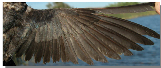
Barn Swallow. Autumn. Adult. Female: pattern of wing (24-VIII).