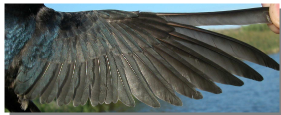
Barn Swallow. Autumn. 1st year: pattern of wing (24-VIII).