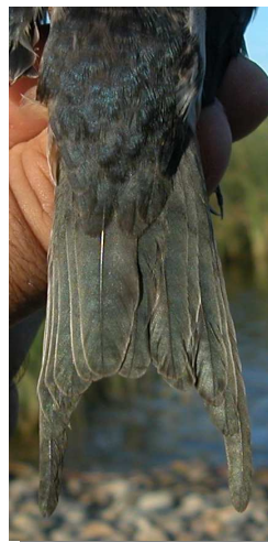
Barn Swallow. Autumn. Length of the outermost tail feathers: top left adult male (24-VIII); top right adult female (24-VIII); left 1st year (24-VIII).