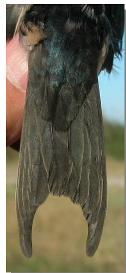
Barn Swallow. Spring. Length of the outermost tail feathers: top left adult male (29-III); top right adult female (29-III); left juvenile (26-VI).