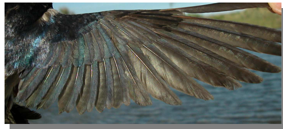
Barn Swallow. Autumn. Adult. Male: pattern of wing (24-VIII).