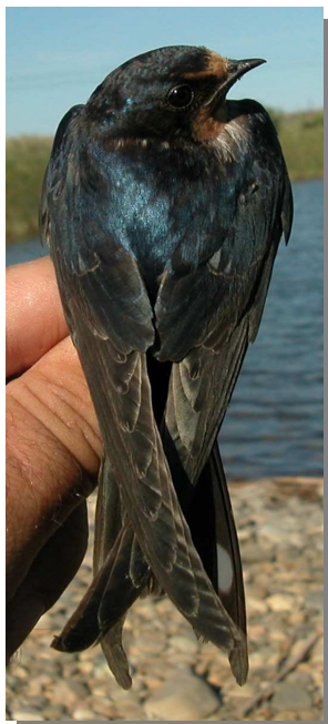
Barn Swallow. Autumn. Upperpart pattern: top left adult male (24-VIII); top right adult female (24-VIII); left 1st year (24-VIII).