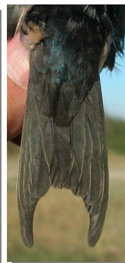
Barn Swallow. Ageing. Length of the outermost tail feathers: left adult; right juvenile/1st year.