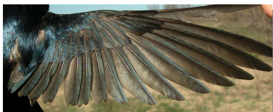
Barn Swallow. Spring. Adult. Female: pattern of