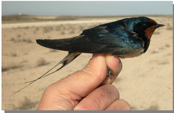
Barn Swallow. Spring. Adult. Male (29-III).