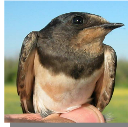
Barn Swallow. Spring. Pattern of breast and chestnut patches on throat: top left adult male (29-III); top right adult female (29-III); left juvenile (26-VI).