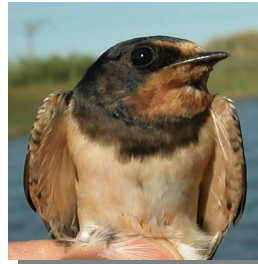
Barn Swallow. Autumn. Breast pattern: top left adult male (24-VIII); top right adult female (24-VIII); left 1st year (24-VIII).