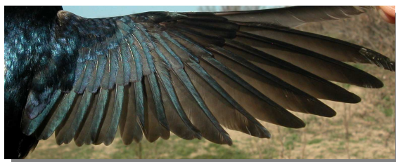
Barn Swallow. Spring. Adult. Male: pattern of wing (16-III).