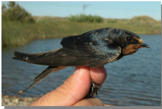
Barn Swallow. Autumn. 1st year (24-VIII).