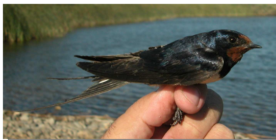
Barn Swallow. Autumn. Adult. Male (24-VIII).