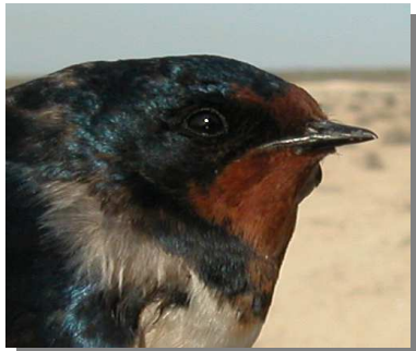
Barn Swallow. Spring. Head pattern: top adult male (29-III); middle adult female (29-III); bottom juvenile (26-VI).