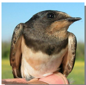
Barn Swallow. Ageing. Pattern of breast: left adult; right juvenile.