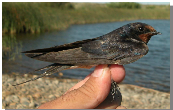
Barn Swallow. Autumn. Adult. Female (24-VIII).