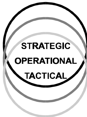
Figure 2. The Levels of War Compressed.

The distinctions between levels of war are rarely clearly delineated in practice. They are to some extent only a matter of scope and scale. Usually there is some amount of overlap as a single commander may have responsibilities at more than one level. As shown in figure 1, the overlap may be slight. This will likely be the case in large-scale, conventional conflicts involving large military formations and multiple theaters. In such cases, there are fairly distinct strategic, operational, and tactical domains, and most commanders will find their activities focused at one level or another. However, in other cases, the levels of war may compress so that there is significant overlap, as shown in figure 2. Especially in either a nuclear war or a military operation other than war, a single commander may operate at two or even three levels simultaneously. In a nuclear war, strategic decisions about the direction of the war and tactical decisions about the employment