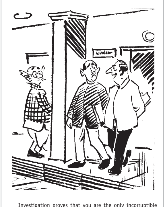
Investigation proves that you are the only incorruptible officer. So they suspect something fishy about your conduct.

A consequence of this situation is the daily transfer of scores of functionaries, particularly DCs and SPs, for having failed to deliver on the political behests conveyed to them, in many cases by the very person who seeks an unauthorised or even an unlawful decision to further his interests. This is not all.