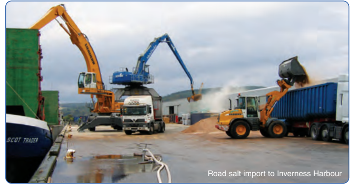
Road salt import to Inverness Harbour

expansion project has regenerated the port area and is the catalyst for further major improvements that will help the continued growth of Inverness. These improvements follow a vision that encompasses the activities of port users and the requirements of an expanding city and its people. The development involved extensive dredging of the river with some of the material dredged being used to create new lay down areas for the enhancement of the port's freight handling abilities, and a new 150m quay was also constructed. This new quay incorporates a heavy lift pad to allow single lifts of up to 200 tonnes and with an immediate laydown area of 20,000 sq m and a new main entrance capable of accommodating the longest turbine trailers with ease.