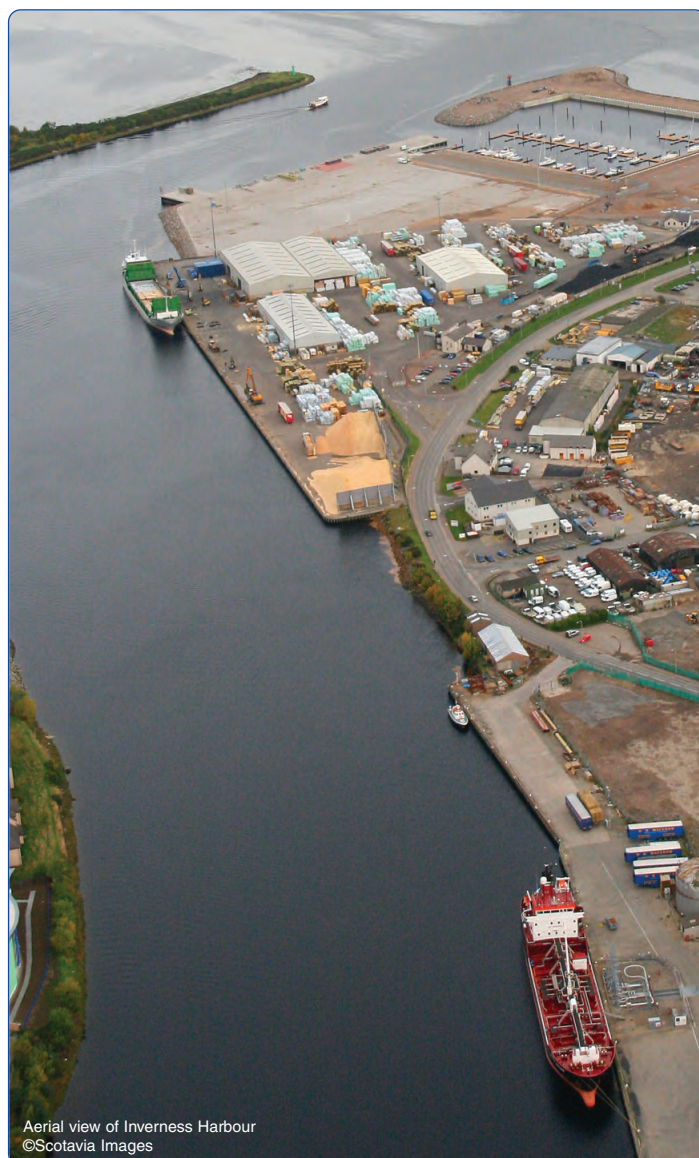
Aerial view of Inverness Harbour

Weighbridge - 50 tonnes capacity. Available if required.