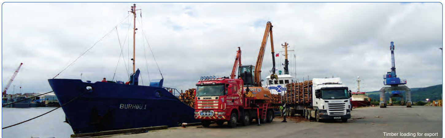
Timber loading for export

Cromwell Road, Inverness, IV1 1SX Tel: 01463 232370 Fax: 01463 232388 Web: www.scottishfuels.co.uk