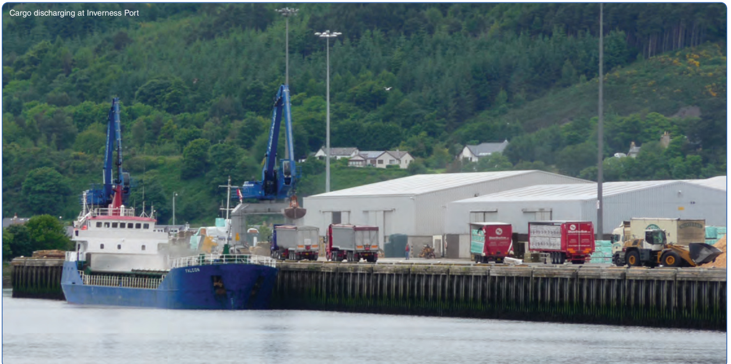
Cargo discharging at Inverness Port

A wide range of agricultural and industrial products constitute the rest of the port's export activity, which includes potatoes, salmon smolts, machinery, barley, rapeseed, pulpwood, fish waste and woodchips.