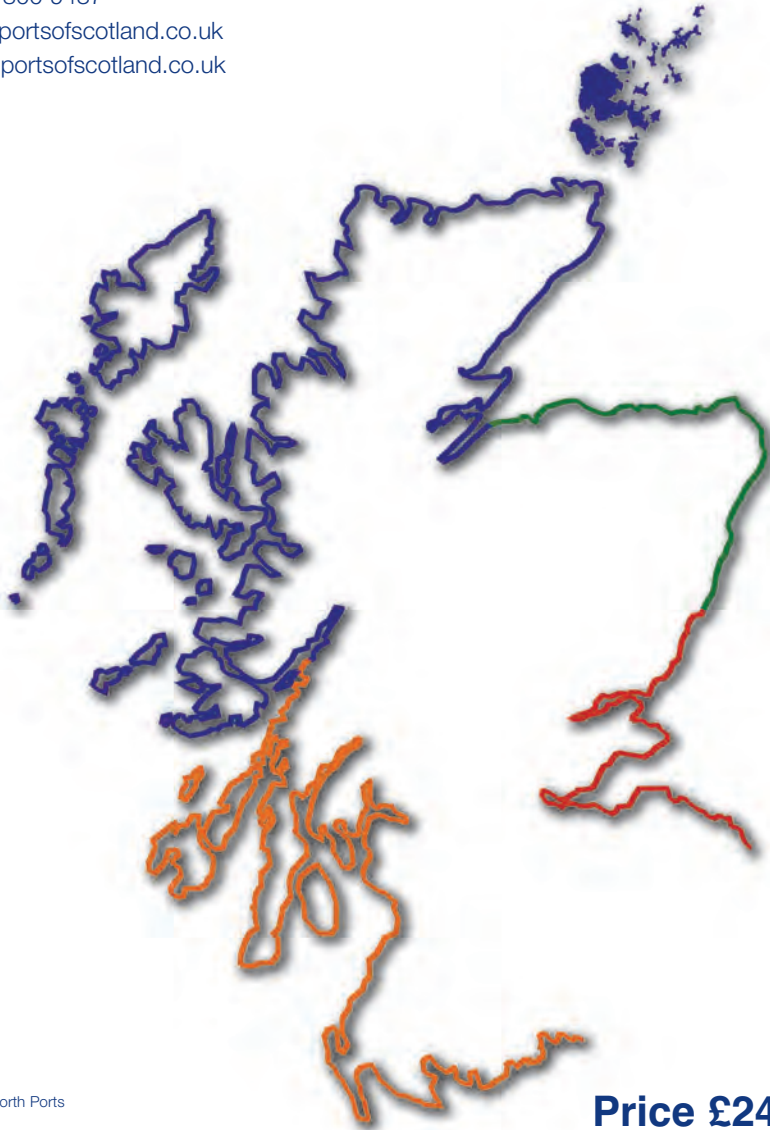
Cover photograph Aerial view of Rosyth, Forth Ports