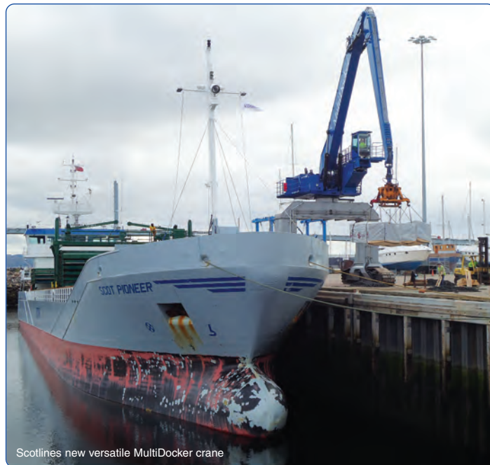
Scotlines new versatile MultiDocker crane