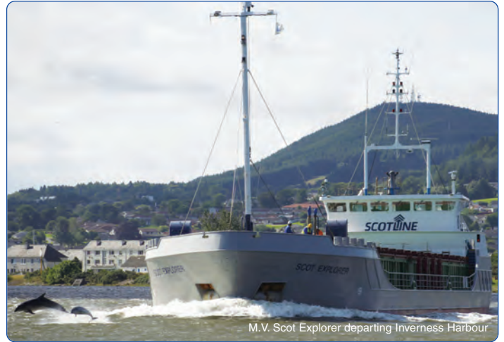
M.V. Scot Explorer departing Inverness Harbour

Recent improvements to its infrastructure have further increased its attractions to cargo and cruise shipping. The City of Inverness, the Highland capital, continues to experience growth in industry, commerce and tourism and the port has expanded its facilities and services to capitalise on opportunities in the renewables industry and the small cruise ship market as well as continuing to grow its commercial activities.