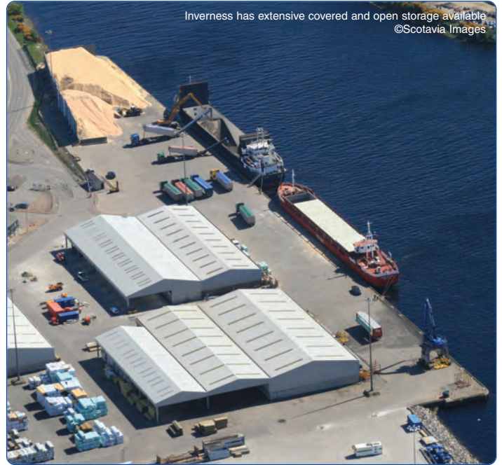
Inverness has extensive covered and open storage available

All types of mobile cranes available up to 70 tonnes. Arrangements can easily be made for heavier lifts; 350t to 500t cranes available with adequate notice. Elevators - Grabbing cranes available for grain and other bulk material.