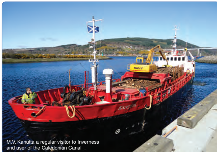
M.V. Kanutta a regular visitor to Inverness and user of the Caledonian Canal

Tipperty Industrial Centre, Ellon, AB41 8LZ Tel: 01224 729000 Fax: 01224 729001 Web: www.whytecranes.com