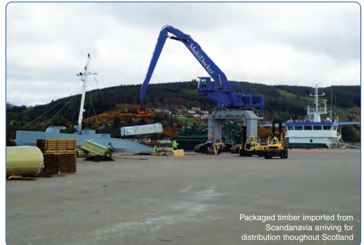
Packaged timber imported from Scandinavia arriving for distribution throughout Scotland