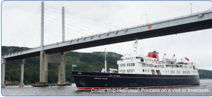
Cruise ship Hebridean Princess on a visit to Inverness.

As one of Scotland's most sheltered natural deep-water harbours, The Port of Inverness is a natural choice for the renewable energy industry. The port enjoys unrivalled accessibility and because of its sheltered location, it offers almost guaranteed access irrespective of the weather. The port offers renewables companies heavy load assembly and considerable storage areas immediately adjacent to the quayside, together with a dedicated heavy lift pad. The new main entrance has been completed and trials undertaken confirm that turbine blades of up to 50m in length can be accommodated.