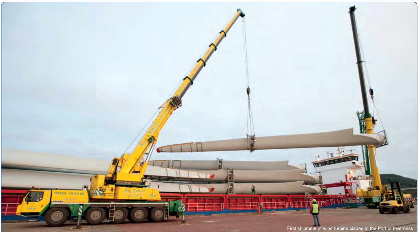
First shipment of wind turbine blades to the Port of Inverness

Maximum air draught at MHWS is 29.0 metres to clear Kessock Bridge. MHWS is a 4.8m tidal height.