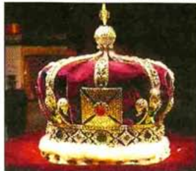
■ The Crown Jewels

4 The Docklands & East London Advertiser, Thursday March 15, 2012