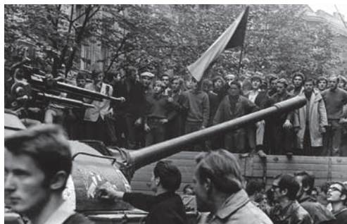
Demonstration against the occupation, Prague, August 1968

The logic of some of the steps taken by the new party leadership after January 1968, therefore, was determined by tactical considerations of the need to eliminate Novotný’s influence rather than by a well-considered reform programme. The newly awakening civil society and critical public opinion began to formulate demands that went far beyond the reform programme. Moreover, even though for the time being the reforms had been partially thought through in the academy, they were far from having been elaborated into a concise political programme. Dubček and other reform-oriented members of the KSČ leadership were truly popular with the public, authentically popular in a way that no other previous Czechoslovak communists had ever been. Of course, the public wanted