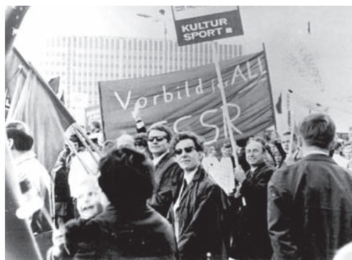
Demonstration of solidarity with the Czech opposition, May 1968 in Berlin. The two men carrying the banner “Role model Czech Republic” were arrested shortly after this picture was taken.

In its struggle for national identity and liberation from Russian rule, the Ukraine felt a special bond with the Czech and Slovak nations. In the 1920s many Ukrainian political exiles found a temporary home in Czechoslovakia under Tomáš G. Masaryk 1 , to the extent that Prague was dubbed the second capital of the Ukraine.