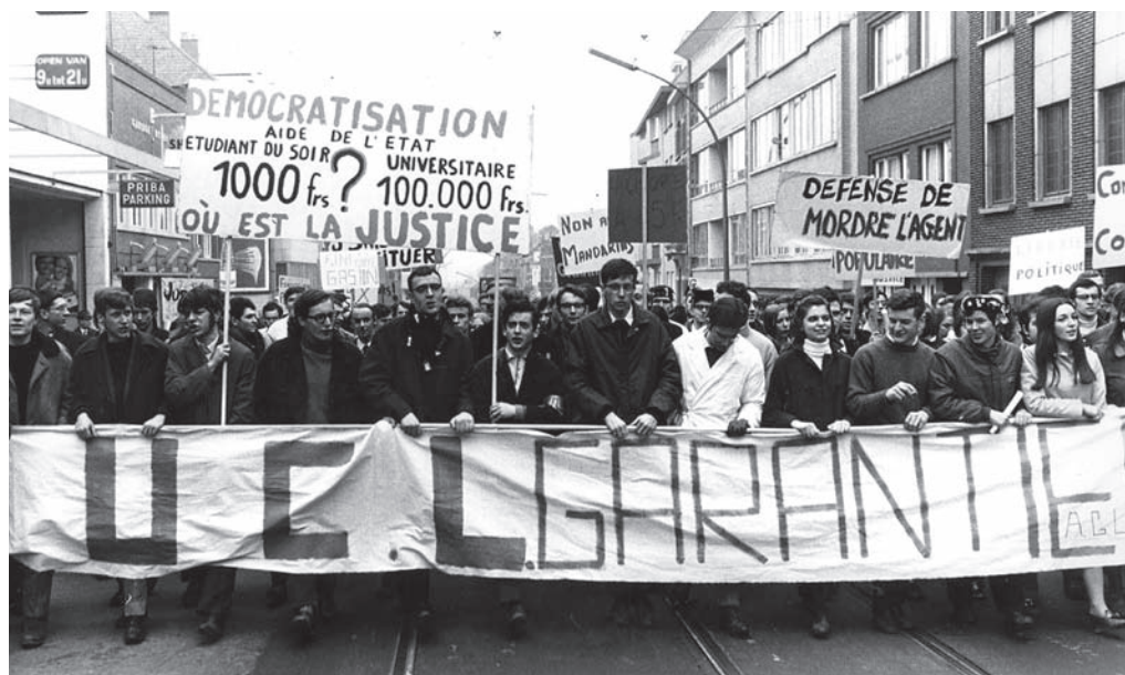
Francoophone students at Louvain University demonstrate for a more democratic education system and proper financial support for the transfer of the university to Wallonia, 20 March 1969.