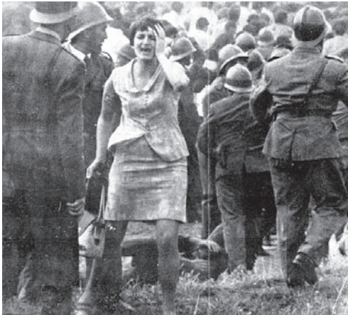
Belgrade, June 1968

The government was even prepared to ally with the nationalists, with whom it had had a long and bitter battle. One of the final fights was an armed conflict at the end of November 1968, with an Albanian national movement in Pristina. The second one, in Zagreb, saw the Stalinists and the nationalists join together to fight an emerging leftist movement. The first one ignited the government's arsenal, and the other ideological logistics. Holding on to the vision of strengthening the national state, left-wing ideas were denounced as a 'crazy utopia', undermining the natural unity of 'the organism of the nation'. Visions of the future were drowned out by visions of the nation's 'glorious past'. As a result of this, the beginnings of a nationalist mass movement emerged in June 1968 and continued until 1971, when it threatened the ruling party's government monopoly. The regime then brutally eliminated its most outspoken nationalist allies (through arrests, trials and removals from work and public life).