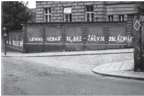
“Wake up Lenin, Brezhnev has gone crazy!” Prague, 1968