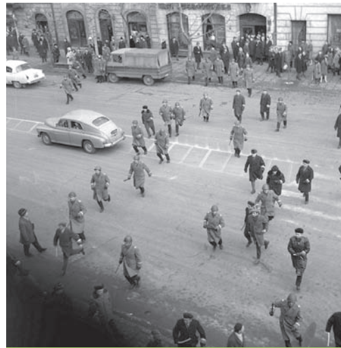
Streets of Warsaw, 1968

Today, I believe, we all know that a single surge of effort is not enough to change the course of history towards a better future. The reality is different. A plethora of forces and self-interests continuously clash and values are never safe. They must be guarded, sustained and protected.