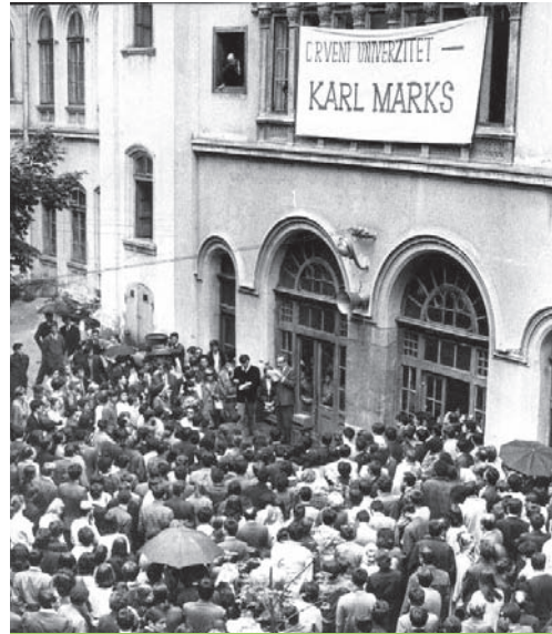
Karl-Marx Red University, Belgrade, June 1968

It is known that memory fades over time; that it forms part of knowledge but it cannot replace a complete or objective based knowledge. This especially applies to complicated social conflicts, in which it is difficult to remain an objective investigator. To be objective I therefore propose to adopt the attitude of the winning side, despite being, for many years, on the losing side myself. The victors in June saw the core of the conflict not so much as an ideological, political, economic and social struggle but predominantly one of culture. This is underlined by the concentration of almost all government resources in the fight against the 'black wave in culture', particularly in the period from 1969 to 1975. This fight was most evident in the banning of films, theatre productions, books, newspapers and magazines and science gatherings; in the stamping out of creativity and critical thinking in art, philosophy and sociology; in the elimination of the humanist tradition in education and upbringing; in the establishment of an obligatory norm of 'moral and political suitability' for employment; and in the battle against 'enemies of all colours', including the wide practice of informing. Many available sources can tes-