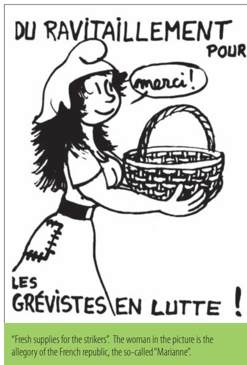
“Fresh supplies for the strikers”. The woman in the picture is the allegory of the French republic, the so-called “Marianne”.