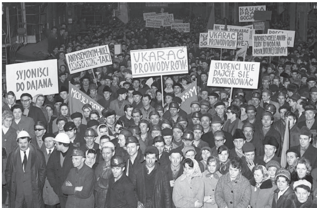
Demonstration in factory with banners against the student protests, i.e. "Anti-Semitism - No! Anti-Zionism - Yes!", March 1968