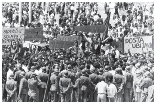
"Press Freedom and democracy!" "Stop the Killing!" Demonstration in Belgrade, June 1968