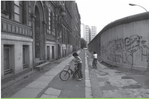
Berlin Wall, June 1965. Pavement and street are on East German territory – the houses are on West German territory.