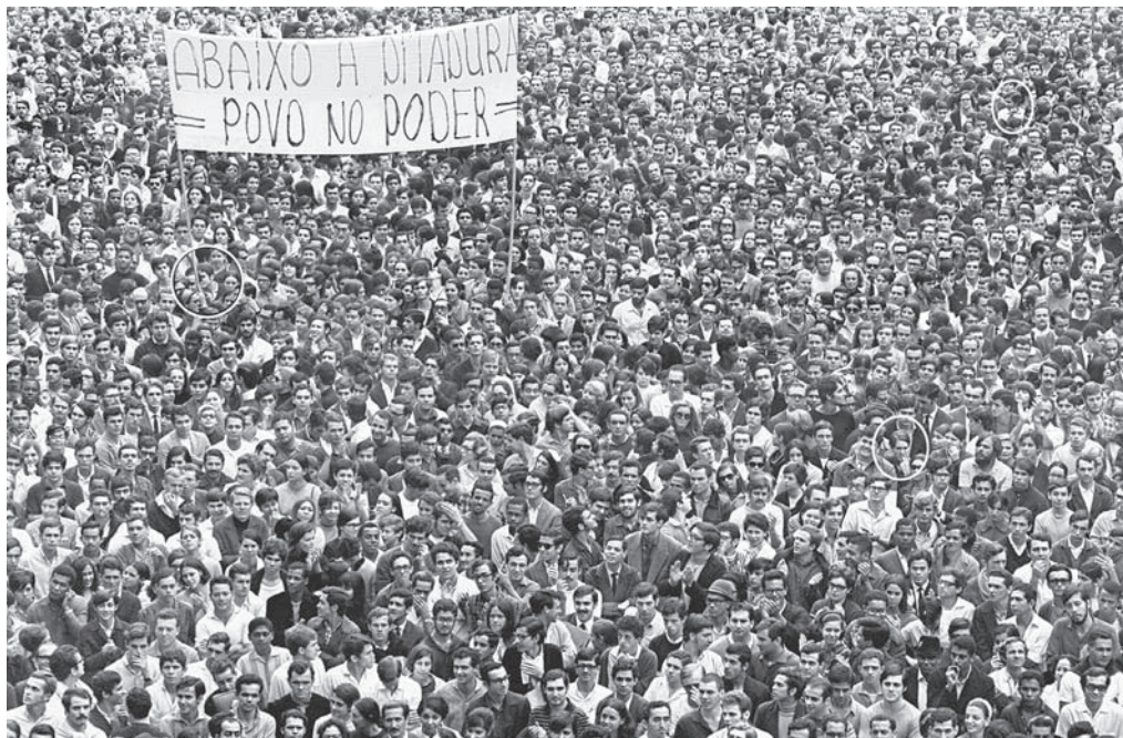
The One-Hundred-Thousand March on 26 June 1968 (Reason for circles in the original picture are unknown)