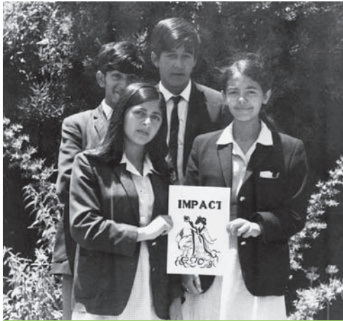
Students of Livingstone High School, Cape Town, with a copy of their 'Impact' magazine of February 1969 which celebrated the 1968 rebellion. The author, aged 17, is on the right at the rear.