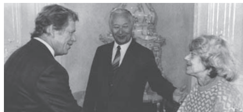
From left to right: Vaclav Havel, Alexander Dubček und Larisa Bogoraz, 21 August 1990

The story of the human rights movement does not end in August 1968, but a discussion of its further evolution, the history of its institutions, society's response to it, etc. is beyond the scope of this article.