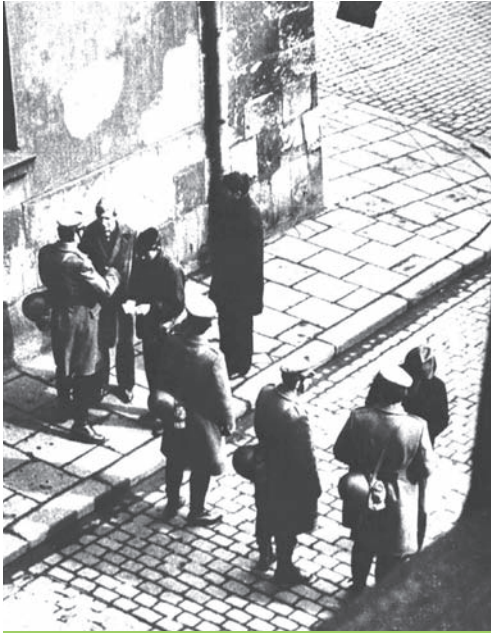
Militia on the streets of Warsaw, 1968