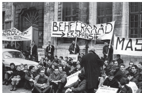
Flemish student support for the separation of the catholic university began early. Demonstration, 1 February 1967

Thus, the Flemish '68 is the only student movement that forced a government to resign. But the victory was ambiguous as was the slogan 'Walloons go home' which mixed the anti-imperialist claims of the movement against the Vietnam War with the claims of the nationalist struggle against the Walloons, who were often confused with the French-speaking bourgeoisie of Flanders. Of course, the SVB changed its slogan to 'bourgeois go home' but it was incapable of avoiding its use by the nationalist movement, even though the movement feared the leftists and workers as well as the claims for the democratisation of access to higher education. At that time, the SVB increased its presence at the gates of factories on strike (for instance at the Limburg mines, which were being closed). A few years later, some of its leaders founded a Maoist party – All Power to the Workers – which became the Parti du Travail en Belgique (PTB – the Belgian Labour Party).