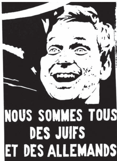
“We are all Jews and Germans” Popular chant among French students to demonstrate solidarity with Daniel Cohn-Bendit.

we have observed similar attempts to make 1968 responsible for all of society's troubles. For example, if today there is no respect, no authority, if school doesn't work, if individualism and selfishness is growing, it is the post-1968 ideology that should be blamed. It is fascinating to observe how the bourgeoisie and the descendants of the world we fought against have a huge need for revenge, even today, as if they had never accepted the fact that their power had started to collapse then. Paradoxically, someone like Sarkozy has a real fascination for 1968 and his behaviour truly follows the style of 1968. When he steps up onto the stage, when he puts on his show of 'boundless pleasure and orgasms', he does what we called in Germany thirty years ago, politics in the first person singular. In other words, he does not act in the name of the revolution, but in his own name. At that time we said that everything was political and Sarkozy even makes politics out of his private life. His 'rupture', supposedly symbolising a will to modernize French society, is driven by a form of self-determination that says: if you want something, you can get it. In other words, if you want more purchasing power, you can get it. His problem is that it is not working. Everyone knows that. That is