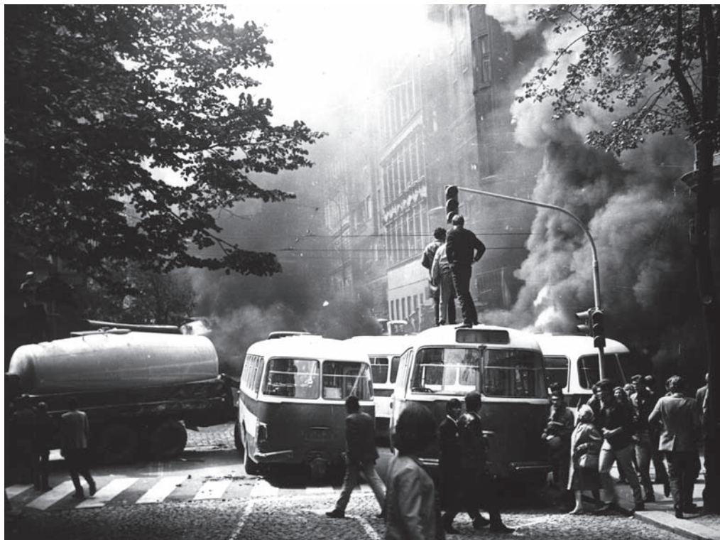
Vinohradská street in Prague, 21 August 1968