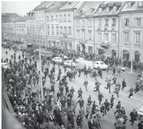
Warsaw, March 1968