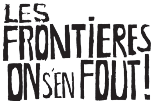
“Frontiers - we don’t give a damn about them” Popular slogan in 1968

The challenge of globalization is also a choice that the emerging countries have to make. They have to make the choice between the invention of a new carbon-free civilization or keeping the old model, which destroys the environment. Brazil with its biofuel is going in the latter direction. These biofuels, a new kind of productivity, are leading us to a food disaster. Bio-fuels and GMOs are the symbol of the next great source of conflict for civilization. Either we will head towards a new model of destructive productivism or we will achieve real sustainable development that will enable us to enter a new civilization. To move away from our European point of view is also to understand that we have to build the conditions for emerging countries not to choose the old system.