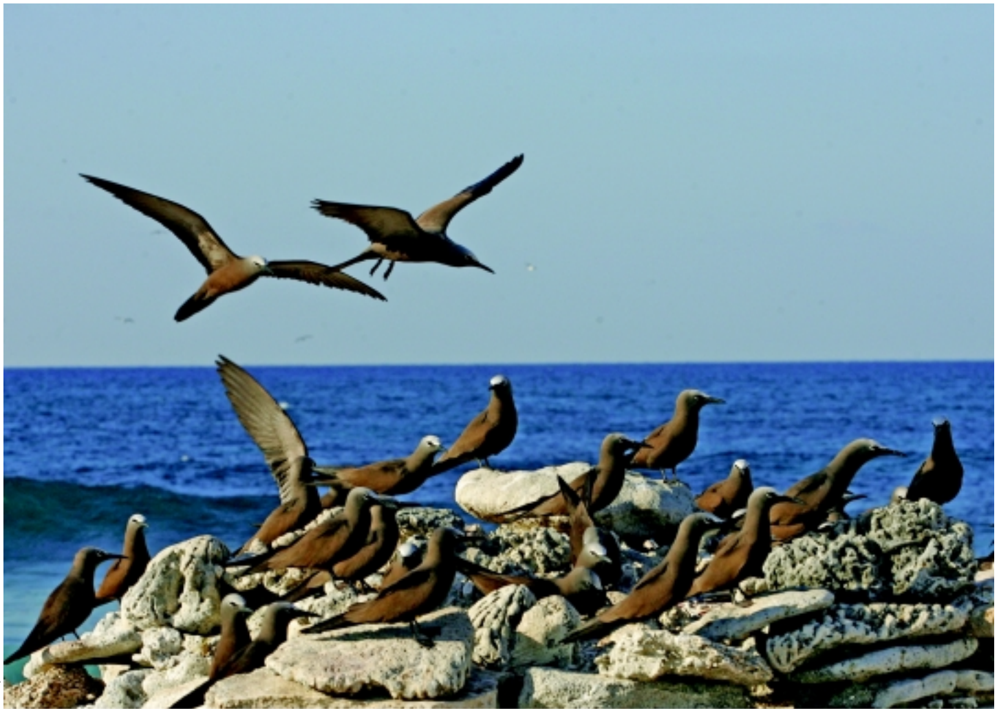
A flock of Brown Noddies Anous stolidus

recorded during our survey—one species from the Phaethontidae, one from Stercorariidae and six from Laridae. In addition to these 19 non-pelagic species were also recorded (Table 1). We observed that Lesser Crested Tern Sterna bengalensis had the widest distribution, occurring on 13 islands followed by Large Crested Tern S. bergii , which was found on eight islands. Sooty Tern S. fuscata , Brown Noddy Anous stolidus , Whimbrel Numenius phaeopus and Common Sandpiper Actitis hypoleucos were recorded on 5 islands. Ruddy Turnstone Arenaria interpres and Pond Heron Ardeola grayii were recorded on four islands. Lesser Sand Plover Charadrius mongolus and Grey Heron Ardea cinerea were seen on three islands while the other species were seen only on two or one of the islands surveyed.