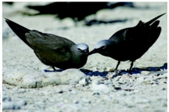
A Brown Noddy Anous stolidus pair

Relative percent distribution of terns irrespective of species recorded on various islands in Lakshadweep Archipelago has been shown in Fig. 1. Percent occurrence of various terns in Lakshadweep Archipelago and percent terns of each species that were breeding has been shown in Fig. 2.