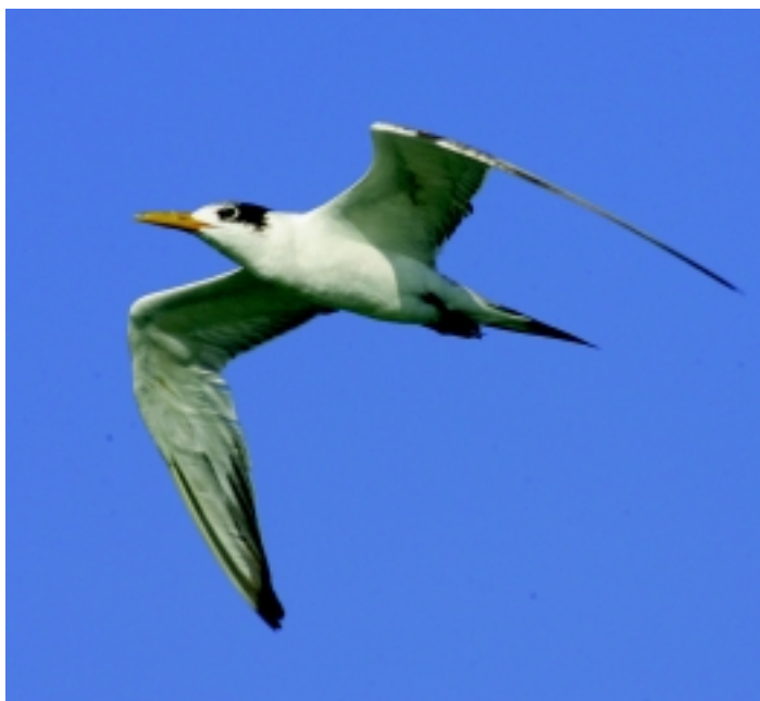
Juvenile Large Crested Tern Sterna bergii