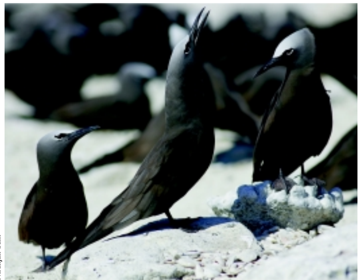
Courting Brown Noddies Anous stolidus