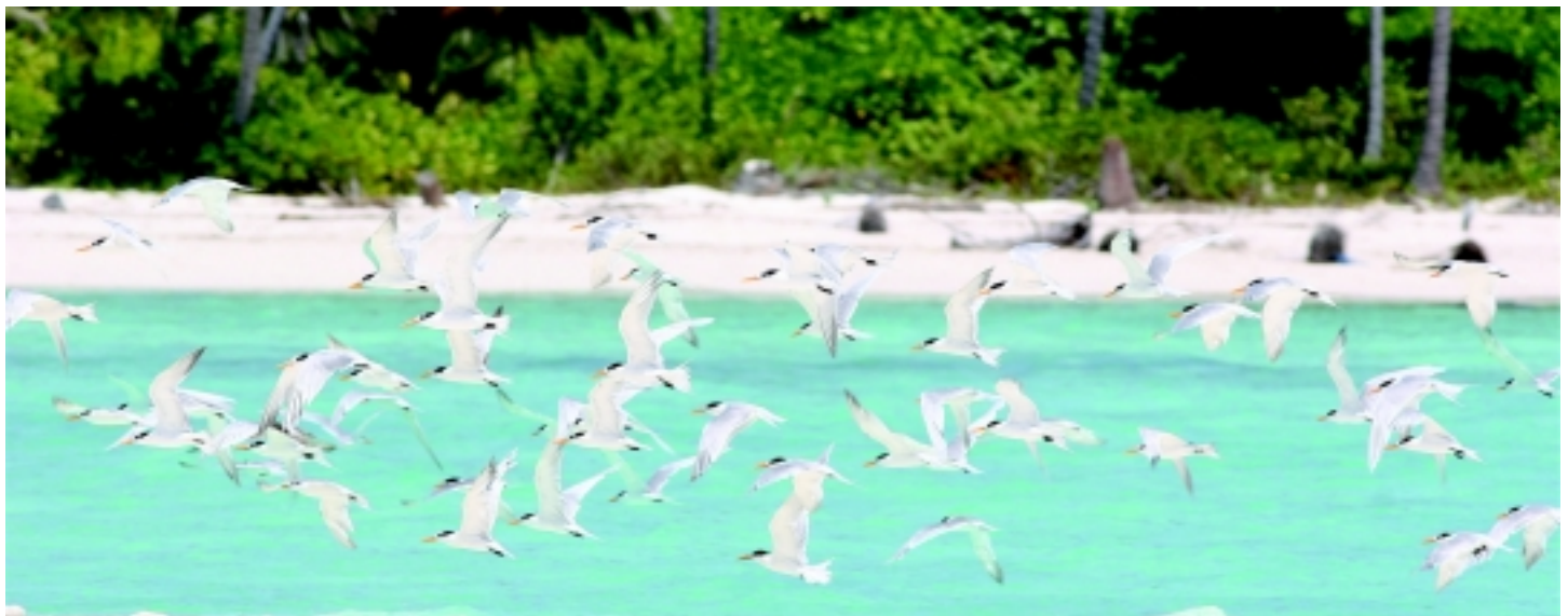
Lesser Crested Terns Sterna bengalensis