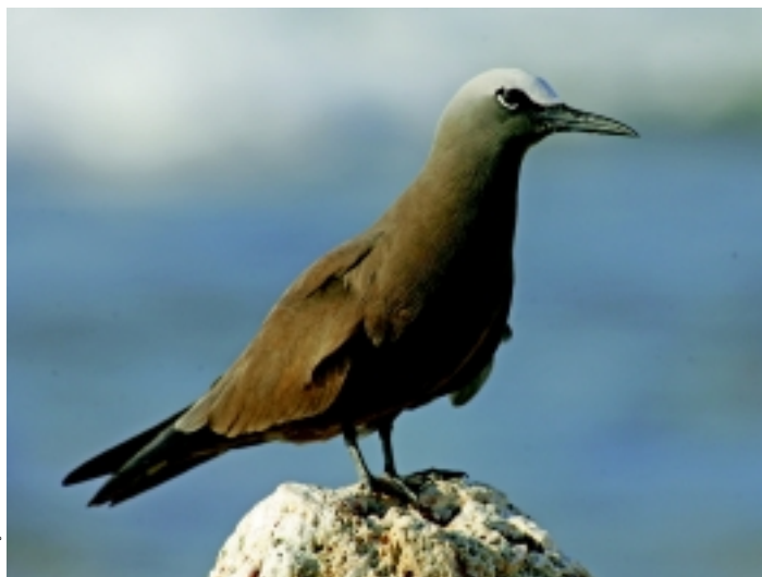
Brown Noddy Anous stolidus

Eight species of pelagic birds from three families were