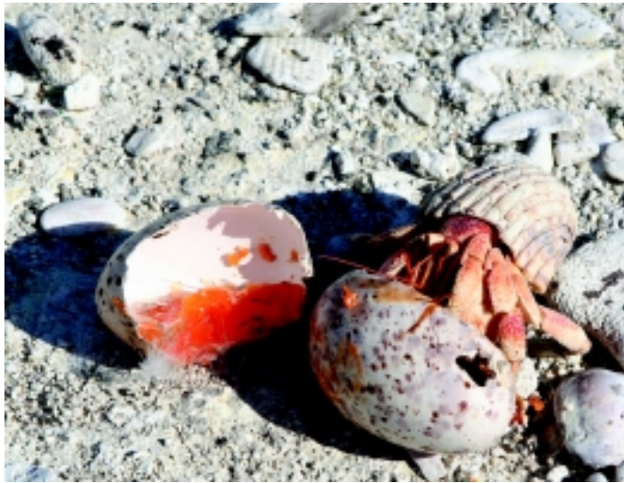
Hermit Crab Pagurus sp. preying on egg