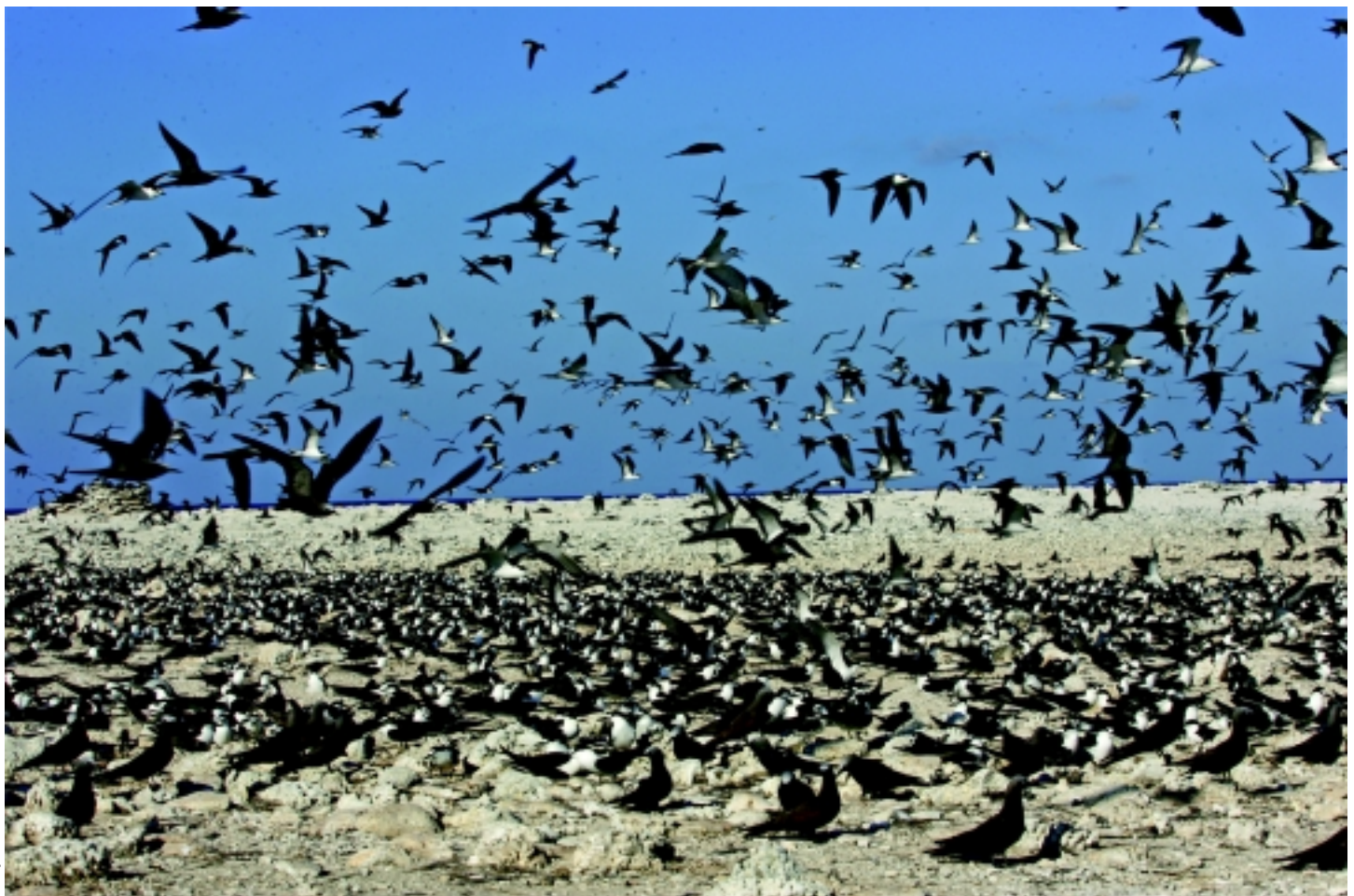
Mixed colony of Sooty Terns Sterna fuscata and Brown Noddies Anous stolidus