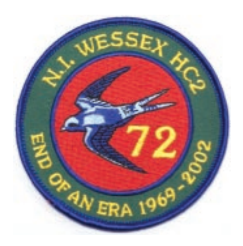
72 Squadron - end of an era

The SH in Northern Ireland operated in a difficult and dangerous environment. They often came under attack with small arms fire and sometimes from rocket-propelled grenades (RPG). In July 1991 2 Wessex from 72 Squadron were attacked with a shoulder-launched SAM 7 surface to air missile. Luckily the SAM 7 passed between the 2 aircraft.