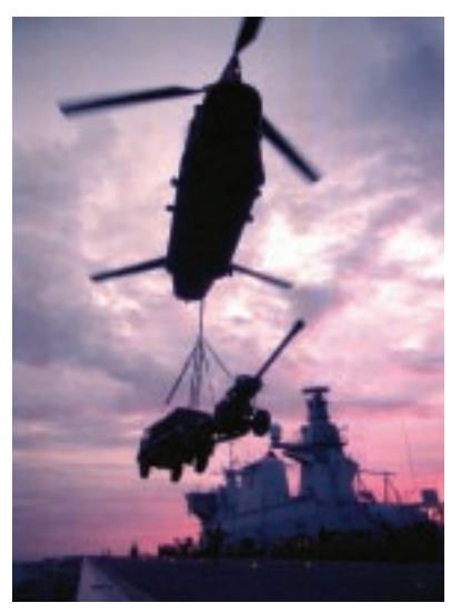
Last lift of the day. A Chinook lifts a 29 Commando, Royal.Artillary. 105mm gun and a one ton Landrover from the deck of HMS Ocean enroute Sierra Leone

50,000 people had been killed and over half the population displaced. The UN was to oversee the disarmament of the RUF and a force of some 11,000 peacekeepers was allocated to assist UN Mission in Sierra Leone (UNAMSIL). About 8,000 of these were present in the country by Spring 2000.