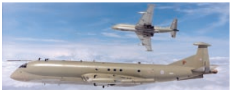
Two 51 Squadron Nimrod R1s

The RAF made a significant contribution to the coalition reconnaissance capability. RAF aircraft flew 274 recce missions.