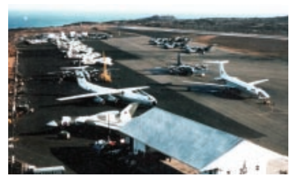
The pan at Ascension