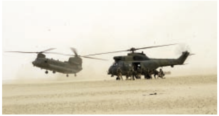
Chinook and Puma Operation TELIC

The Tornado GR4s were fitted with the new Storm Shadow stand-off missile. Storm Shadow has a range of over 230 kilometres and can be used day or night in all weathers. It is designed to achieve exceptional precision against high value targets and minimise collateral damage.