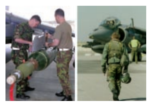
1,000 lb Paveway 2 loaded on a Harrier GR7, Kosovo mission complete a Harrier GR7 pilot at Gioia

Milosevic stepped up the process of ethnic cleansing of the Kosovo Albanians and thousands of refugees streamed into neighbouring Albania and Macedonia. NATO responded by increasing the number of aircraft available for operations and the RAF despatched a further 4 Harrier GR7s to Gioia and another Tristar to Ancona. Tornado GR1s were put on standby at RAF Bruggen in Germany and were supported by 3 VC10 tankers. To help relieve the growing humanitarian crisis. RAF Hercules began airlifting tents, blankets and medical supplies to Tirana in Albania and Skopje in Macedonia. With the arrival of better weather in April, operations intensified. On the 5 April, 6 Tornado GR1s from Bruggen flew their first sorties against bridges and tunnels on the main supply route between Serbia and Kosovo. On 7 April, Harrier GR7s used medium level RBL755 cluster bombs for the first 1,000lb free fall bombs through cloud.