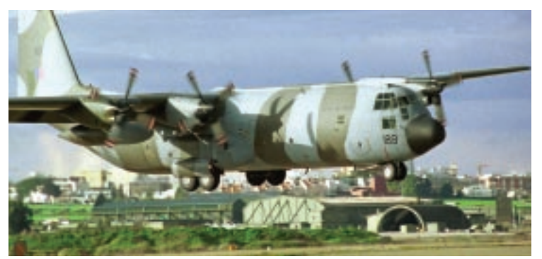
A Hercules transits through Italy during Operation CHESHIRE

The UN organized a relief effort to provide food and medicine to besieged towns and cities, including the capital, Sarajevo. The Sarajevo airlift began in July 1992 and became the longest running airlift in history, ending in January 1996. The UK played a leading role in setting up the airlift and participated throughout the duration. The RAF's contribution, under the name Operation CHESHIRE, was Hercules operating initially from Zagreb in Croatia and then from Ancona in Italy. Experienced RAF AT liaison officers worked alongside representatives of other participating nations and civilians at the airlift centre in the UN HQ in Geneva to organise the flights and cargos. By the end of Operation CHESHIRE the RAF had delivered 26,577 tonnes of supplies in 1,977 sorties.