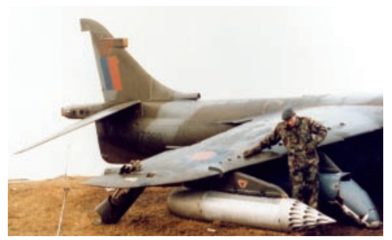
Crashed Harrier GR3 on the Falklands

Without the Harriers operated by the RAF and the RN the Task Force and British ground units would have had to face the very considerable Argentine forces with no on-the-spot fixed wing air support. The consequences of this would have been severe.