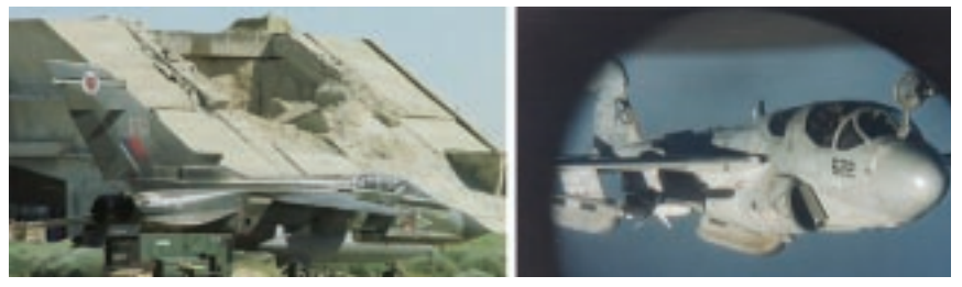
A 12 Squadron Tornado GR1 next to a HAS destroyed by the RAF in 1991, VC10 refuelling a US Navy EA-6B Prowler

This action against Iraq was code named Operation DESERT FOX. From 16-19 December 1998 the RAF and USAF attacked 1993 targets in Iraq, mainly around Baghdad, Tikrit in the north and Basra in the south. Of a total of 250 bombing missions 12 Sqn's Tornado GR1s flew 32 medium level sorties and dropped a combination of 61 UK Paveway 2 and Paveway 3 LGBs. One of their targets was a hangar at Tallil containing the so-called "drones of death" remotely piloted vehicle (RPV) aircraft capable of carrying chemical and biological weapons.