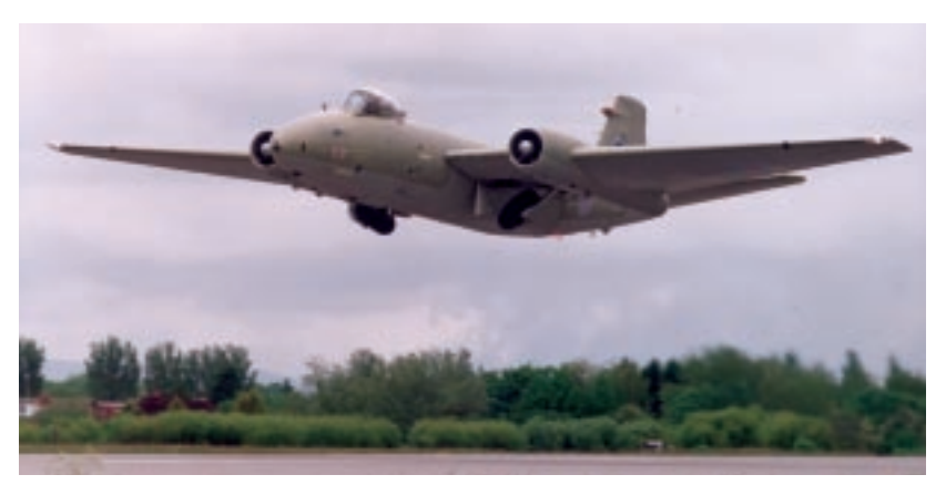
Canberra PR9 takes off

In April 1993 the RAF deployed 6 Tornado F3s to Gioa del Colle in Italy as part of Operation DENY FLIGHT, primarily an aerial monitoring task to enforce compliance with UNSCR816. Successive detachments of F3s deployed and, by the time they were withdrawn in February 1996, had flown nearly 3,000 sorties. A Sentry E3-D based at Aviano, also in Italy and 2 VC10 tankers based at Palermo in Sicily also support the operation while RAF Chinooks and Pumas deployed to Split in Croatia. Nimrod and Canberra aircraft in the maritime surveillance and reconnaissance roles patrolled over Former Yugoslavia and the Adriatic.