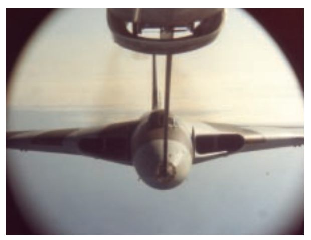
A BLACK BUCK Vulcan viewed through a Victor's periscope

The Vulcans not only reached and bombed their targets but, in doing so showed the Argentineans that the RAF had the potential to hit targets in the Argentine. This forced them to move their Mirage fighters further north. This prevented the Mirages from escorting the Sky Hawk attacks against the British, especially the RN and Merchant Navy ships in San Carlos Water. This stretch of water became known to the Navy as 'Bomb Alley'. The Vulcan raids also impacted on morale, damaging that of the Argentine forces but uplifting that of the British, especially before the landings at San Carlos. Furthermore, BLACK BUCK was a considerable strategic success, forcing Argentina to re-deploy Mirage fighters to protect Buenos Aires.