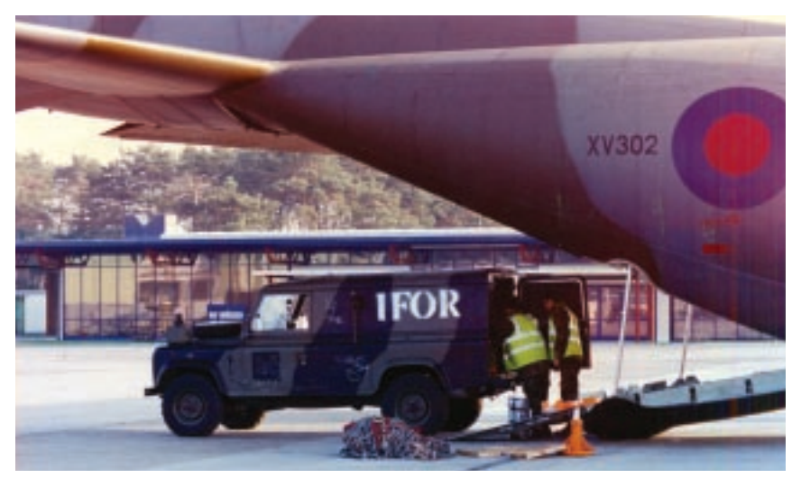
Loading IFOR equipment at RAF Bruggen, Germany December 1995