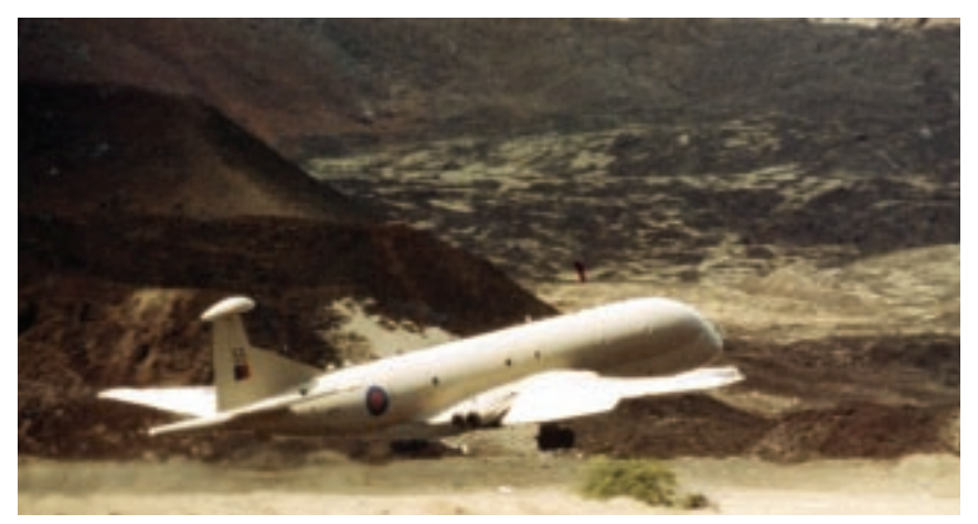
A Nimrod departs Ascension for the long flight south

No Argentine submarine or warship attacked Ascension or the British forces at sea. The Nimrods had made a significant contribution towards deterring offensive naval action by Argentina.