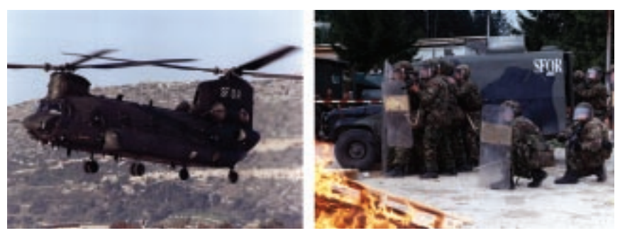
RAF Regiment in Bosnia, SFOR Chinook in Bosnia

In December 1996 IFOR became SFOR (Stabilisation Force) and Operation DECISIVE EDGE became Operation DELIBERATE GUARD. In February 1997 Jaguars replaced the Harrier GR7s. The RAF Regiment field force first deployed in April 1992 as part of UNPROFOR, and became part of the British Army roulement until January 98. They provided security for the divisional HQ of NATO's Multi-National Division (South West) and performed a wide range of tasks including inspecting weapon storage sites, monitoring Bosnian Serb military activities, supervising elections and community aid projects.