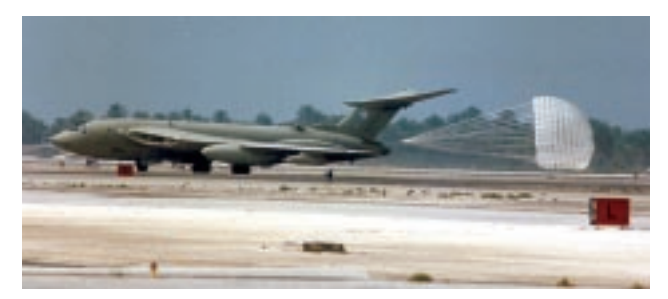
A Victor tanker streams in brake parachute