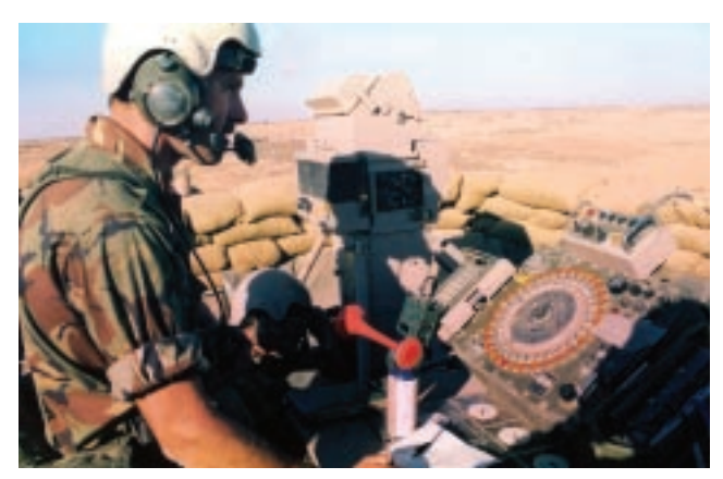
Rapier FSB1M fire control point

Whilst the UN tried to make Saddam withdraw from Kuwait by peaceful means the Coalition built up their forces. In November the UN issued Iraq with an ultimatum, leave Kuwait by 15 January 1991 or be forced to. With authority from the UN, the shield in place, Saudi air space secure and the Coalition build-up of forces sufficient to ensure success, operations now turned to the offensive.