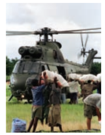
Loading a Puma Operation BARWOOD

The RAF was also called on to fly mercy missions to areas struck by natural disasters: mud slides in Chile 1991, earthquake in Turkey 1992, hurricanes in the Caribbean 1992, famine in Somalia 1993, floods in the Netherlands 1995, and UK 1998,volcanic eruptions in Montserrat 1995, forest fires Cyprus 1995 and 1998 and floods in Mozambique 2002.