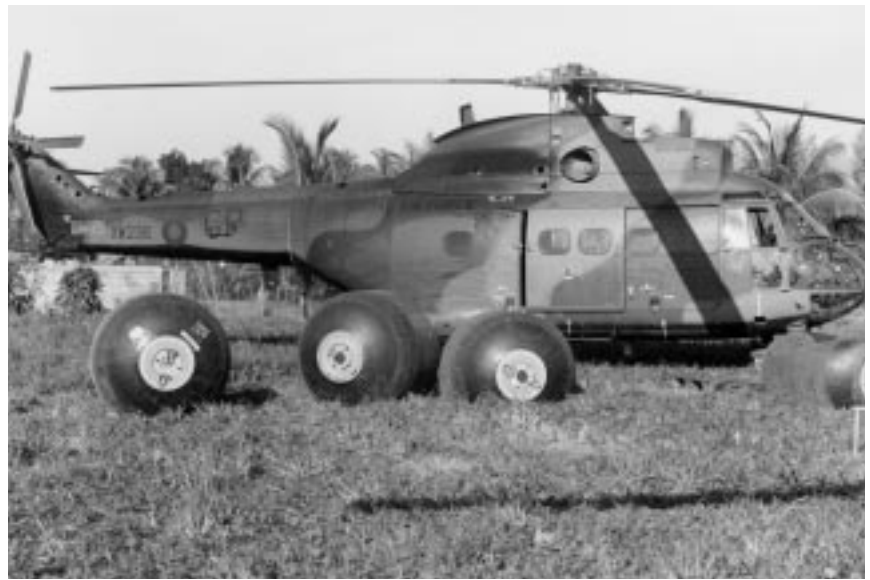
Aviation fuel pillow tanks beside a Puma

The 1990s saw the end of British commitments in Belize. This former British colony (then called British Honduras) lies on the north east coast of Central America and has had a long-standing border dispute with its neighbour, Guatemala. Guatemalan claims became progressively more threatening and RAF assets were sent to reinforce Belize in 1971. The heightened tension led to the deployment of 6 Harrier GR3s, via Goose Bay and Bermuda, and supported by Victor tankers. Three Puma helicopters and an RAF Regiment squadron also deployed. In 1976 Guatemala suffered an earthquake, this was felt to have reduced their military capability and the Harriers were withdrawn. However, they were redeployed again in July 1977.