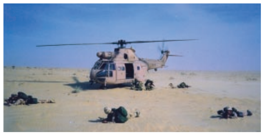
Puma deploys troops

The land campaign began after 38 days of intensive air attacks on targets in both Kuwait & Iraq. This campaign was a classic one of land/air manoeuvre in which the RAF Chinooks and Pumas supported the first (UK) Armoured Division by rapidly ferrying troops forward and bringing up supplies and weapons. Within a very few days the Iraqi army began a massive withdrawal from Kuwait. To prevent the retreating Iraqis linking up with their Republican Guard north of Kuwait, Coalition air attacks continued, one target being the road to Basra. However, so complete was the Iraqi defeat that the Coalition governments were able to call a halt to the fighting after only 100 hours of ground combat.