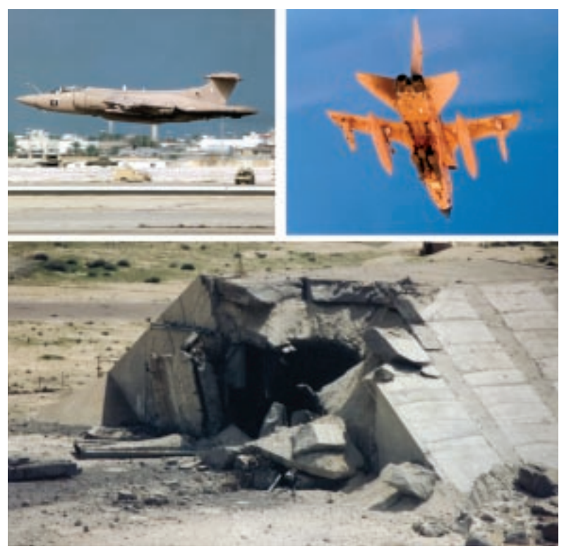
Pave Spike Buccaneer, Tornado GR1 with 3 LGBs, The result of an LGB attack against an Iraqi HAS

By the 21 January 1991 the Coalition counter-air campaign had driven the Iraqi Air Force into hiding, effectively destroyed the Iraqi integrated air defence system and seized the middle and upper air space for Coalition use. The Tornado GR1s had played a key part in this achievement and it allowed them to fly the majority of subsequent sorties in the daytime and at medium level above 12,000 ft. This enabled the GR1s to fly above most of the Iraqi anti-aircraft defences.