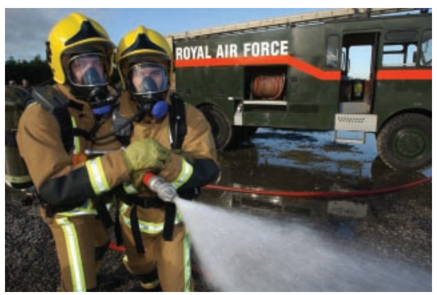
RAF firefighters Operation FRESCO

The Services have also been involved when civil authorities have been unable to manage, an example of this being the Foot and Mouth epidemic of 2000-01. They have also been called upon to mitigate the effects of workers' strikes, most recently the Firemens' strike of 2002–03. The RAF's contribution to Operation FRESCO, as the Services' fire fighting effort was called, included specialist breathing apparatus teams as well as crews for the 'Green Goddess' fire engines.