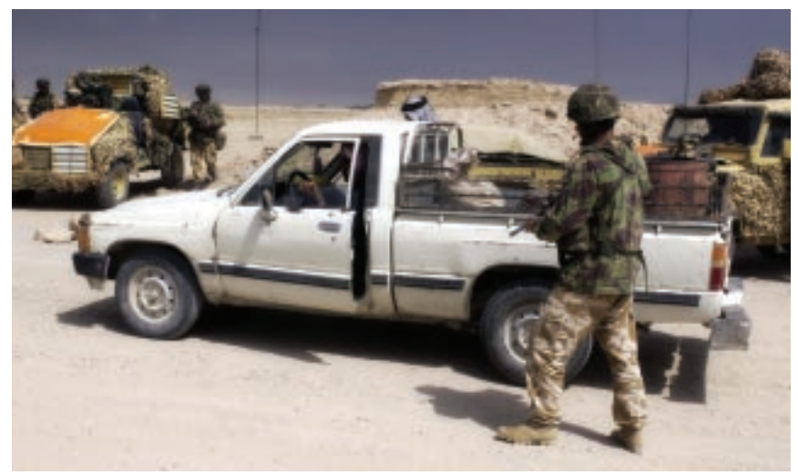
RAF Regiment on street patrol

In addition to the airborne assets 6 RAF Regiment Squadrons deployed together with 2 TAC STOs. The Regiment Squadrons provided ground based air defence, force protection, Joint NBC protection and Joint Helicopter Force protection. Some 15 specialist RAF ground support units also deployed.