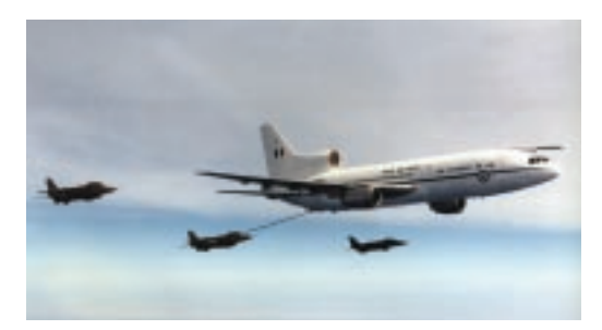
216 Squadron Tristar tanking Jaguars

By April 1998 the situation in Bosnia-Herzegovina was sufficiently stable to allow a reduction of forces in the region. The RAF Jaguars and their supporting Tristar tankers returned to the UK but the RAF E-3D Sentrys remained in theatre until 2000.