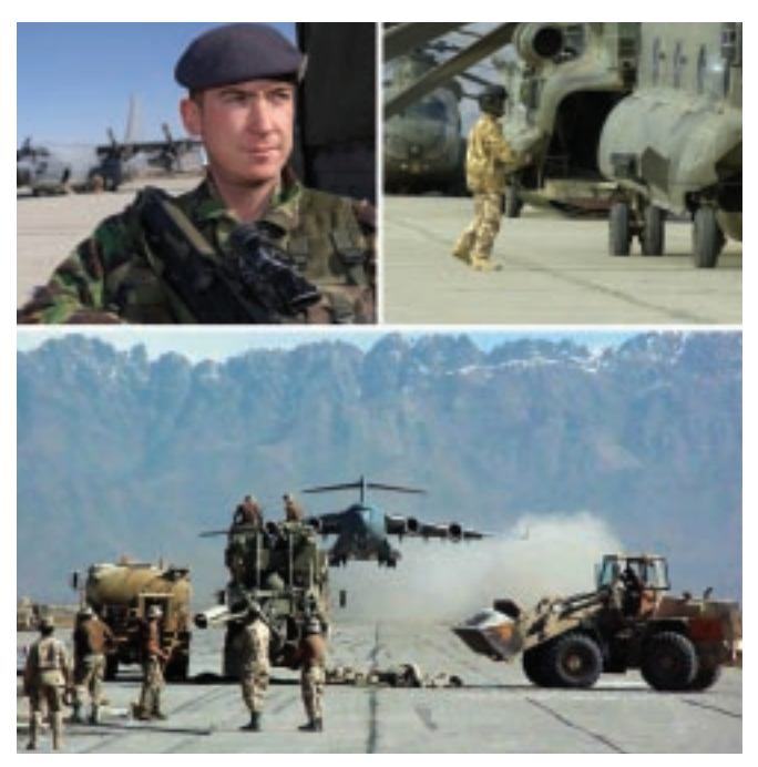
Afghanistan ops, Chinooks in Afghanistan C-17 taking off from Bagram

Following the terrorist attack on the Twin Towers in New York on 11 September 2001 domestic security in the UK was raised and the AD element of the RAF went onto very high alert. On the world stage, Operation ENDURING FREEDOM began in October 2001 against Al Qaida forces in Afghanistan. Canberra PR9s undertook photographic reconnaissance and monitored refugee movement. Nimrod MR2s patrolled the Gulf and surrounding area to provide protection to naval shipping in the area. The E3-D Sentry took part in joint UK/US AWACS coverage in theatre, performing both surveillance and airborne C2 functions. The British inputs to Operation ENDURING FREEDOM were known as Operations VERITAS and FINGAL.