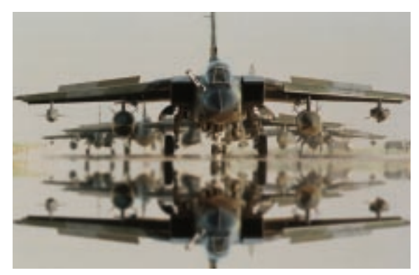
Tornados in the Gulf

Immediately prior to the start of the war RAF Tornado GR1As (Recce variant) were deployed. This was the first aircraft in the world to be equipped with video recording of sensors and a day/night capability. Some 140 GR1A Tac Recce sorties were flown, usually in pairs, low-level at night and the crews were required to be over enemy territory for extended periods. On 18 January 1991 Iraq fired SCUD missiles at Israel in a move designed to widen the conflict and break Arab support for the Coalition. The 6 RAF GR1As with the infrared linescan equipment were primarily employed on the counter-SCUD campaign, but they were also used against enemy defences and positions, supply routes and bridges for damage assessment.