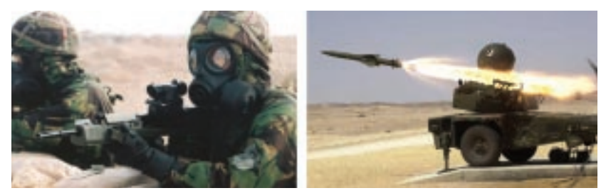
In the heat of the day, RAF Regiment in full individual Protection Equipment to protect them from the biological and chemical weapon threat (left) and target engaged by a Rapier (right)

RAF Regiment units deployed to Cyprus, Bahrain, and Saudi Arabia to carry out a variety of duties including short range air defence (SHORAD) with the Rapier, NBC monitoring, ground defence and other specialist tasks. In total they comprised 19% of the total RAF deployed force. The rapid arrival of this force, together with those of other Coalition air forces, acted as a strong deterrent to any aggressive Iraqi move against Saudi Arabia.