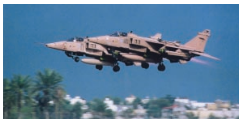
Jaguars take off from Muharraq

RAF Jaguars, flying by day from Bahrain, were also busy attacking a variety of targets in Kuwait. They undertook Battlefield Air Interdiction (BAI) missions at medium level attacking supply dumps, surface-air missile (SAM) sites, Iraqi artillery positions and Silkworm missile sites. They operated with great success in an anti-shipping role against Iraqi naval vessels, destroying patrol boats and landing craft. Jaguars also undertook some medium level Tac Recce.