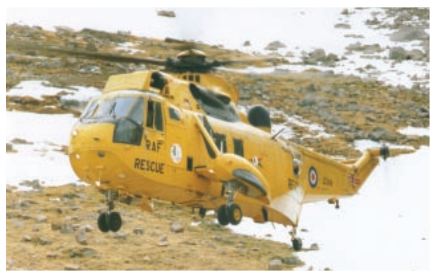
Search and Rescue Sea King

The RAF also supports the efforts of HM Coastguard and The Royal National Lifeboat Institute in rescues at sea by making available search and rescue (SAR) Sea King helicopters. The primary role of these aircraft is the rescue of downed aircrew but they are well known for their civilian rescue work both on land and at sea. RAF Mountain Rescue Teams and SAR helicopters are also called in to assist with rescues of lost and injured walkers and climbers. Another role of the Mountain Rescue Teams is to provide crash guards at the sites of military aircraft accidents