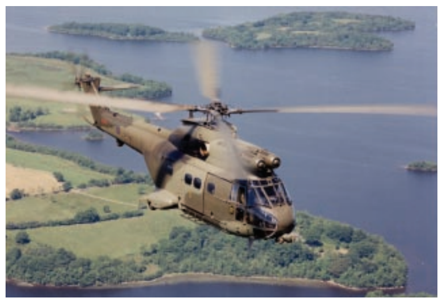
Puma over Northern Ireland

In-theatre helicopters have been constantly in use. The first to arrive were the Wessex of 72 Sqn. In December 1972 the Pumas of 33 Squadron joined the Wessex to form the RAF Helicopter Detachment, Northern Ireland. The Pumas of 33 Squadron were replaced with those of 230 Squadron in May 1992. From the late 1980s Chinooks deployed to Northern Ireland when required. On 1 October 1999 the Joint Helicopter Force Northern Ireland (JHFNI) was formed from RAF, Army Air Corps and RN Fleet Air Arm assets. On 31 March 2002, 72 Squadron disbanded as a helicopter squadron having completed the longest period of sustained support in one operational theatre, namely 38 years.