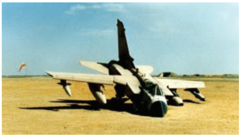
Tornado GR1 off the runway

because of the premature detonation of the bomb or bombs it was carrying, but it has not been possible to determine the cause of the loss of the other two GR1s. Flying at very low levels en route to the target carried its own inherent risks; adding to this the need to fly over heavily defended air bases, it becomes apparent that the RAF were lucky not to sustain heavier casualties.