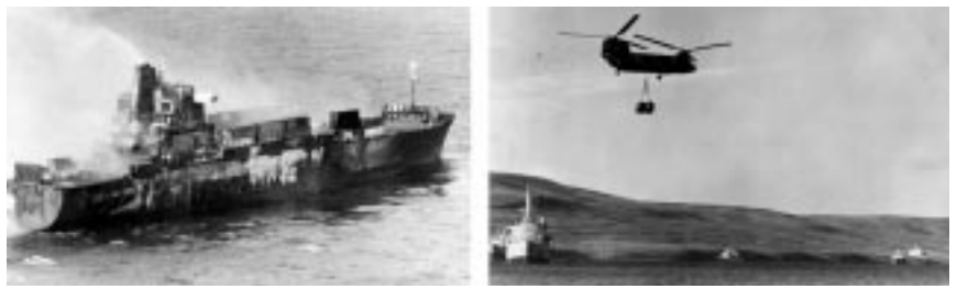
Atlantic Conveyor post attack, The only Chinook left to take the load

The main helicopter support for operations was provided by the Royal Navy, the RAF contribution was 4 of its new Chinook medium-lift helicopters. These left Ascension for the Falklands aboard the Atlantic Conveyor, a merchant ship. On 25 May an Exocet missile sank the Atlantic Conveyor, only one Chinook survived to support the ground forces in the land battle. With borrowed tools and much ingenuity, this aircraft, Bravo November was kept flying; based at Port San Carlos she logged 109 flying hours before the Argentine surrender. Using to the full the Chinook's ruggedness and heavy lift capability Bravo November took part in assaults, including an SAS night sortie where she carried 3 light guns (2 internal & one external) together with 22 troops. This was in addition to her task of ferrying supplies.