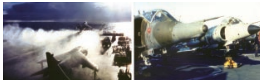
HMS Hermes steams south, Harrier GR3 and Sea Harrier embarked

RAF GR3s reinforced the SHARs on the 2 aircraft carriers of the Task Force; initially, they helped to provide air defence and later turned to their normal task of providing offensive air support to the troops during the landings and as they advanced inland. Three RAF GR3s were lost, all to ground fire. The first GR3s had to be modified to carry air-to-air missiles, to be transported by sea and to operate from aircraft carriers, while the pilots had to be trained for operations at sea - a remarkable achievement in engineering and training completed in 14 days. Other GR3s later flew not only direct from the UK to Ascension using air-to-air refuelling but also onto the operational area - a 9 hour flight from Ascension Island direct to the carriers in position off the Falklands.