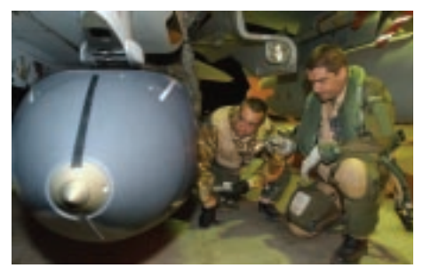
Officer Commanding 9 Squadron and pilot prepare for the first Storm Shadow mission

Due to the need, since 1991, to enforce the NFZs over Iraq the RAF already had some 25 aircraft and 1,000 personnel in the Gulf. During Operation TELIC a further 100 aircraft were deployed together with a further 7,000 personnel. This deployment included Tornado GR4s and Harrier GR7s in the offensive role, Tornado F3s for AD, VC10s and Tristars for AAR, Nimrods and Canberras in the recce role, E3-D Sentrys for AEW and control and Hercules and the new C17s for AT. Support Helicopters were also provided, 20 Chinooks and 7 Pumas.