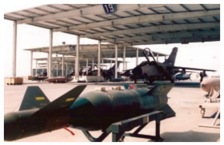
Paveway 2 LGB ready to be loaded on-to a Tornado

Although the first bombs were dropped on 20 March 2003 the air campaign proper began on the 21 March. Precision attacks by both aircraft and cruise missiles were made against several hundred military targets in Iraq. These precision attacks continued for several weeks. As the land battle developed, an increasing number of CAS sorties were flown. Up to 700 sorties a day were flown against Iraqi ground forces and the RAF played a significant part in this effort. RAF aircraft flew 2,519 sorties, 1,353 of which were offensive strike, and released 919 weapons, approximately 85% of these were precisionguided. Operation TELIC also saw the first use of the Stormshadow stand-off precision air-to-ground missile.