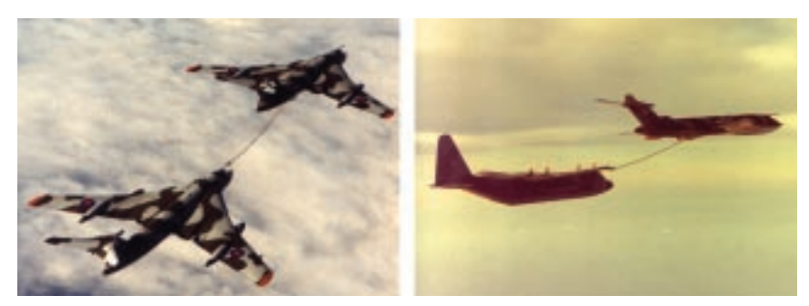
57 Squadron Victor refuels a 55 Squadron Victor, Hercules receiving fuel from a Victor

With the vast distances of the South Atlantic to be covered, AAR was essential. At first only the Harrier and the Vulcan were equipped for this (although the Vulcan required the re-instatement of its probes). Within a few weeks, Nimrods and Hercules were also given this capability thus greatly increasing their range and ability to undertake missions in support of the Task Force.