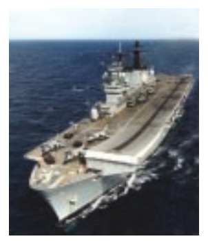
HMS Invincible with Harriers and Sea Kings deployed on board

Coalition forces in the Gulf began to be built up as the situation deteriorated. Twelve Tornado GR1s and over 400 personnel deployed to Ali Al Salem in Kuwait as part of Operation BOLTON. These were supported by VC10 Tankers and Hercules AT. In addition 8 Harrier GR7s were embarked on HMS Invincible patrolling the Persian Gulf. All attempts at a peaceful resolution to the situation failed and the Coalition resorted to military force.