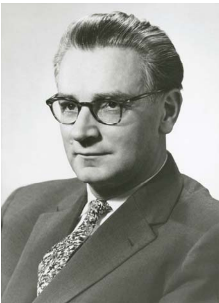
Konrad Zuse (1910–1995)