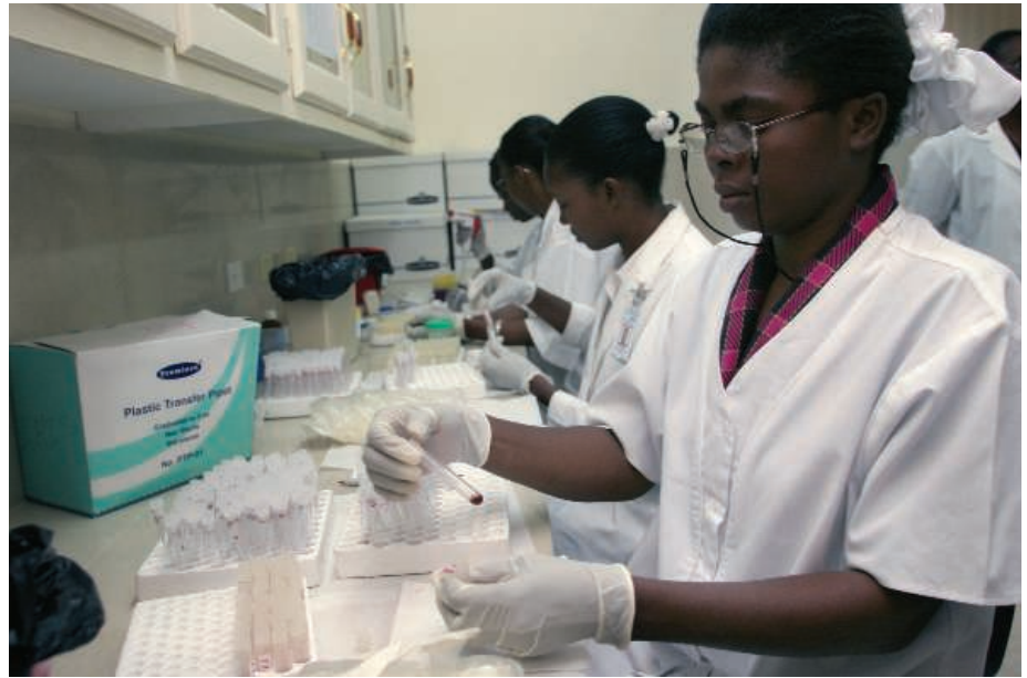
Testing 1, 2, 3. GHESKIO’s well-equipped labs ran 35,000 HIV tests last year, as well as thousands of CD4 counts, TB stains, and rapid tests for syphilis.