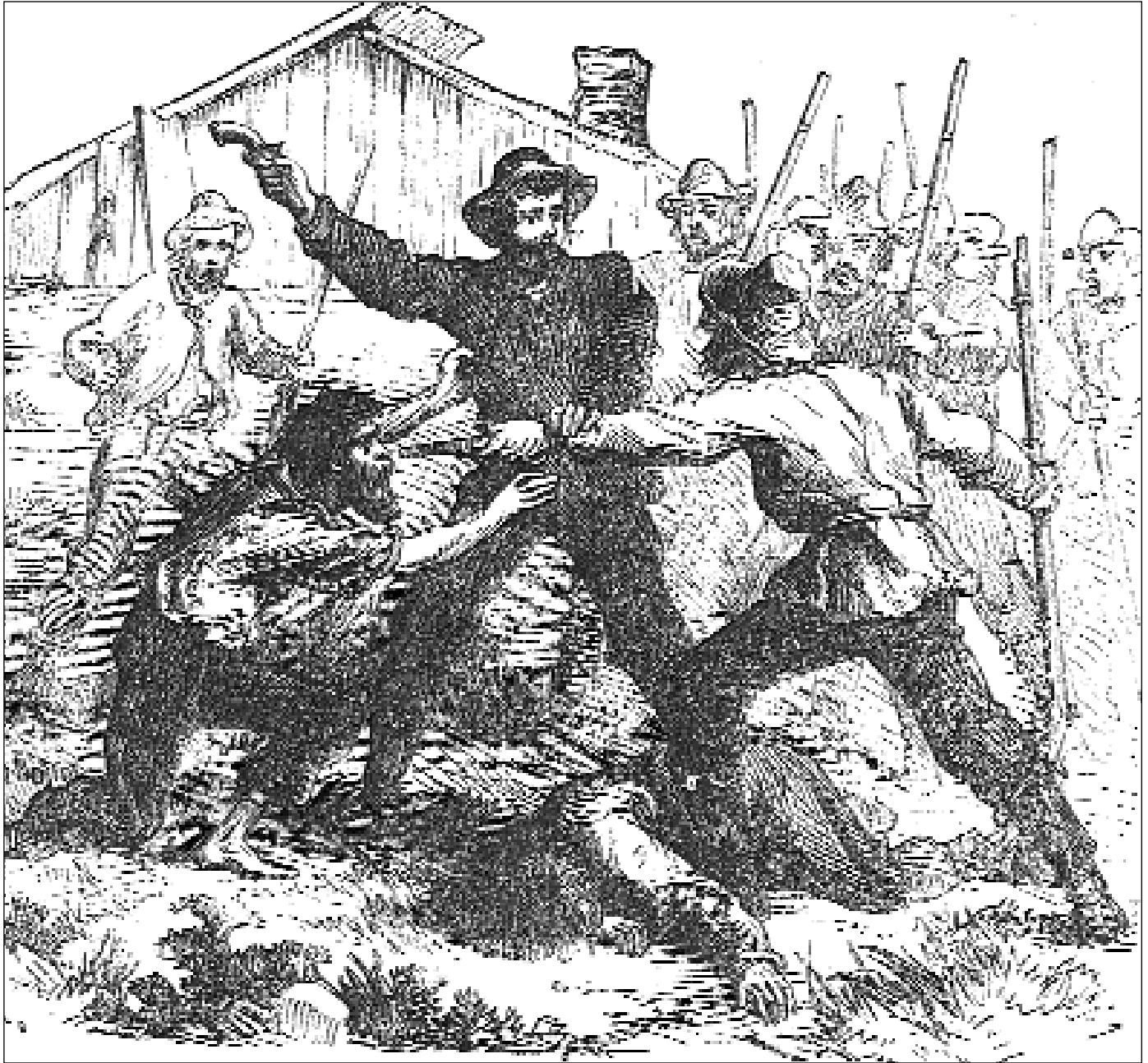
A political conflict at Fort Titus, Douglas County, on August 16, 1856, resulted in the deaths of two proslavery men and one abolitionist.