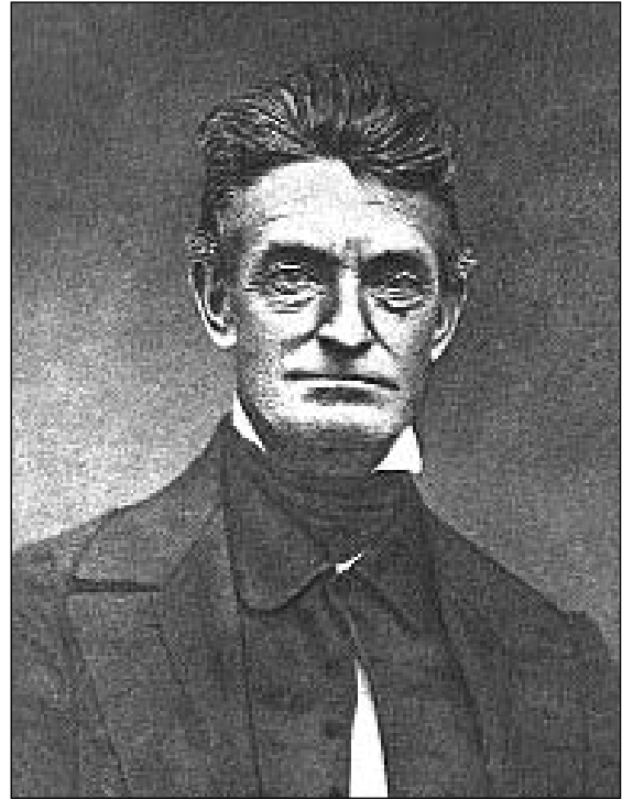
Antislavery leaders Charles Jennison (left) and John Brown (right). Their atrocities, committed in the name of the free-state cause, were not always politically motivated.