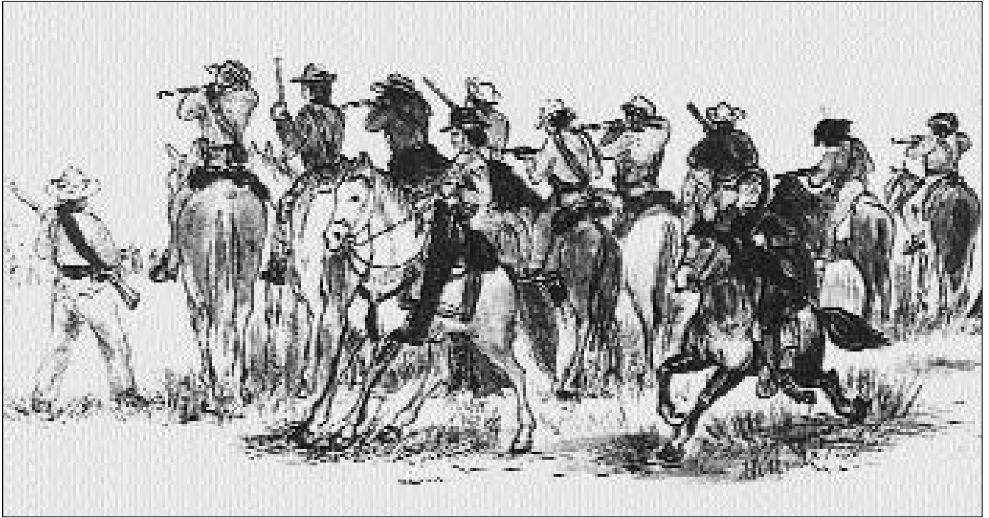
The Battle of Hickory Point in Jefferson County in September 1856 involved a clash between free-state and proslavery forces in which one proslavery advocate was killed.