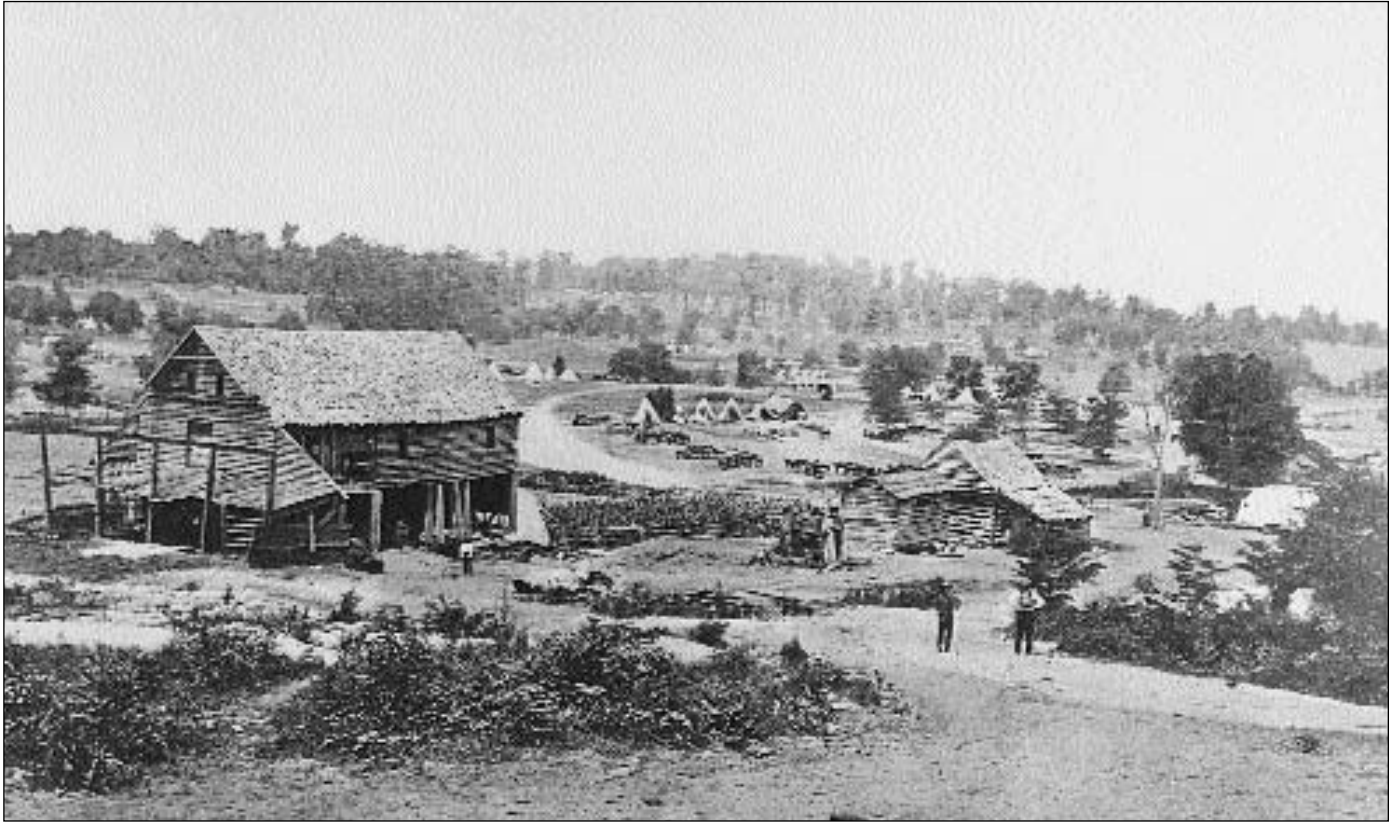
A proslavery party from Fort Saunders, Douglas County, was responsible for the death of one free-state man in August 1856.