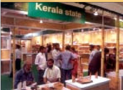
The State's pavillion- in a bamboo cast

Other than the State Bamboo Development Corporation and the Kerala Forest Research Institute,