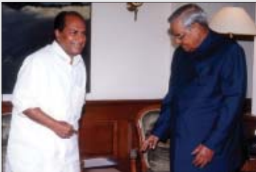
Chief Minister Mr. A. K. Antony meets Prime Minister Mr. A. B. Vajpayee at New Delhi and appraises him of the gravity of the drought situation in the state.

Chief Minister Mr. A.K. Antony has sought Rs.1400 crore from the Centre as drought relief. He met the Prime Minister Mr. A.B. Vajpayee at New Delhi and impressed upon him, the gravity of the drought situation in the State. The Prime Minister has assured the Chief Minister that the Centre would adopt a favourable attitude in granting the drought relief and that measures would be taken in this regard as soon as the report from the Central team