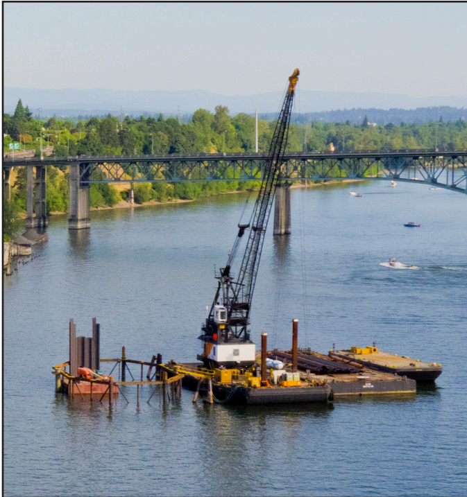
Cofferdams will be used to construct in-water piers.

is created. As it lengthens, the bridge span will connect above the middle of the river with a center closure pour and then to the landside span portion on either bank.