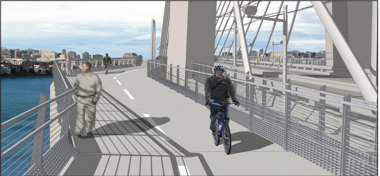
The Portland-Milwaukie Light Rail Bridge will have 14-foot bike-pedestrian paths on each side of the bridge, as well as extra width at the towers.

increase in path width to 14 feet, providing 28 feet of pedestrian and bike facilities, more than on any current bridge over the Willamette River.