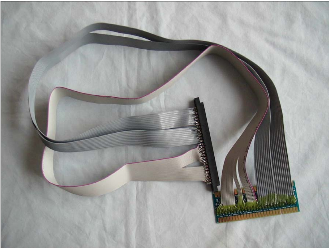
Figure 1: Sample TM-500 extender

The extender consists of the JB-3 Jamma Board, a 56-pin 0.156" pitch edge connector with solder eyelets, and wires between them, about 3 feet (Figure 1). The goal is to provide the same signals present on the edge connector inside the TM-500 frame to the extender connector.