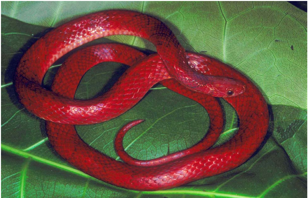
Figure 1. Dorsal view of Oligodon booliati holotype, ZRC.2.5153 (live coloration).

ca. 700 m asl and (2) ZMB 64446, adult female, collected in May 2001 by W. Grossmann and C. Scafer on the top of the Tekek-Juara Trail at 300 m asl.