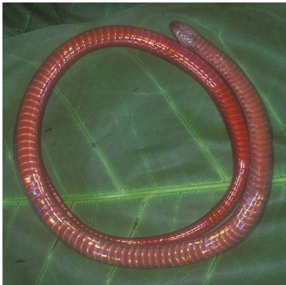
Figure 2. Ventral view of Oligodon booliati holotype, ZRC.2.5153 (live colouration).

hol, the colours gradually faded to a lighter shade. A lateral view of the head is illustrated in Fig. 3.