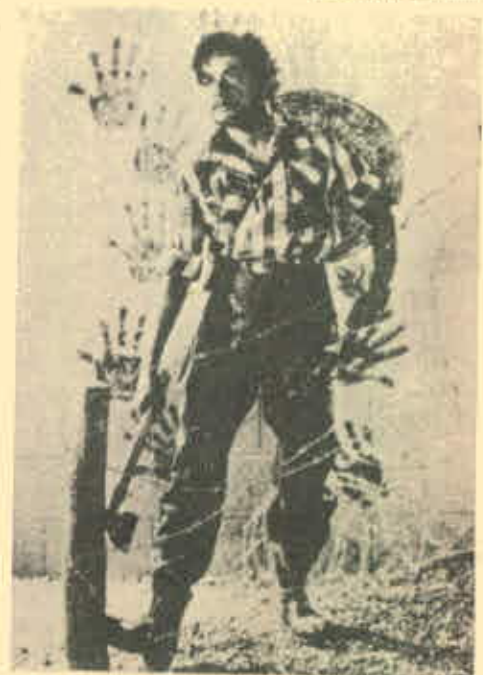
—Do Ankhon Barah Haath

Hrishikesh Mukherjee would be bagging the Silver medal for the best Hindi film with his Raj Kapoor - Nutan starrer "Anari" and the very next year (1960) the President's Gold medal with his "Anuradha", a sensitively told tale of marital tensions with Leela Naidu in the title role. The competition that "Anuradha" faced included Tapan Sinha's "Kshundhita Pashan" (2nd best film), Satyajit's Ray's "Devi" (Silver medal), K. Asif's opus "Mughal-e-Azam" (Silver medal), Rajan Tarafdar's much talked about "Ganga" (Certificate of merit), Raj Kapoor's Radhu Karmakar—directed "Jis Desh Mein Ganga Behti Hai" (Certificate of merit) and B.R. Chopra's songless "Kanoon" (Certificate of merit). It seems Ritwik Ghatak's "Meghe Dhaka Tara" was also eligible that year.