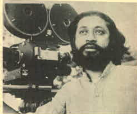
An eminent director in Malayalam, P.A. Backer came to limelight with his very first film KABANEE NADHI CHUVANNAPPOL. His film MANI MUZHAKKAM had earlier won the National Award for the Best Malayalam Film in 1977.