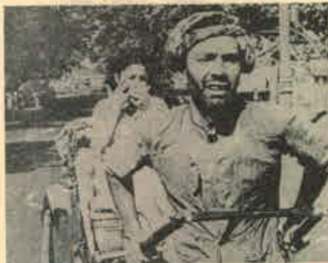
—Do Bigha Zamin

"State Awards for films have been instituted on the basis of the recommendation of the Film Enquiry Committee in order to encourage the production of films of a high aesthetic and technical standard and educational and cultural value", said the official brochure issued on the occasion of the presentation of India's first ever Government-sponsored film awards. "Awards have been instituted", said the brochure "for the best feature film as well as the best documentary and the best film for children. In subsequent years there will also be Regional Awards for feature films."