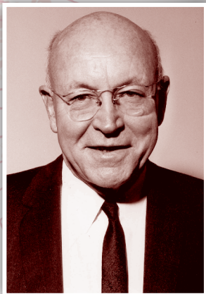
Wendell M. Stanley

Wendell M. Stanley, Class of 1926, was awarded the Order of the Rising Sun, the second most prestigious national decoration given by the Japanese government. Stanley also received the Nobel Prize in Chemistry in 1946.