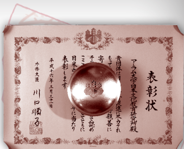
Foreign Minister's Commendation and Commemorative Cup