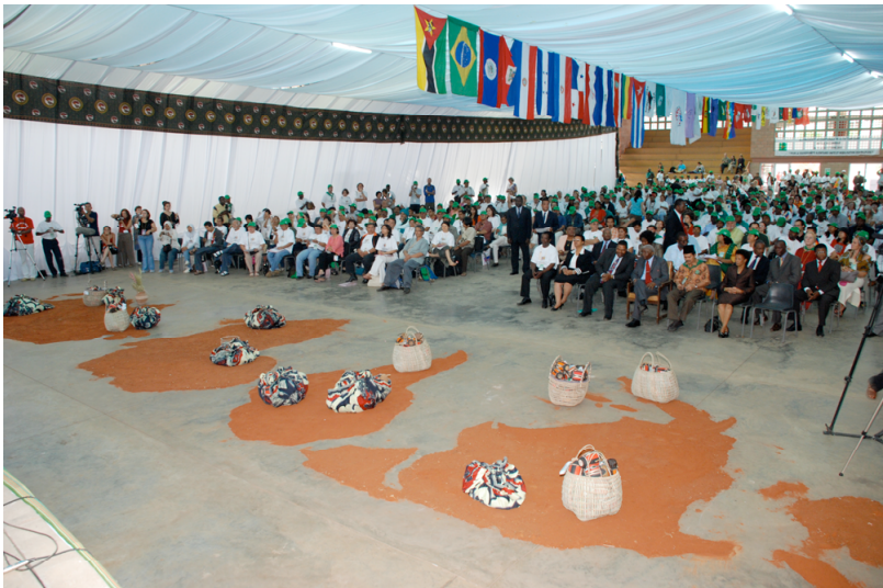
Opening ceremony of the Via Campesina 5th Conference