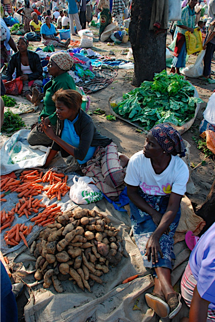
Women farmers from the UNAC cooperatives from the Marracuene district selling their products in the street.