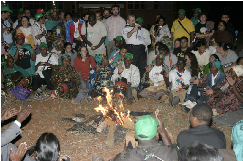
Closing session of the 5th Conference.