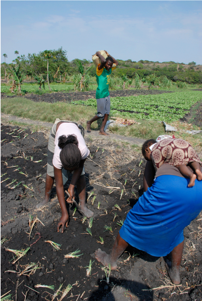
Women belonging to a cooperative of the Mozambican Farmers Union (UNAC) in Aldea Comunal Samora Machel, Marracuene, at about 60 km from Maputo. The cooperative gathers small farmers' families to produce vegetables and sell them in the streets.