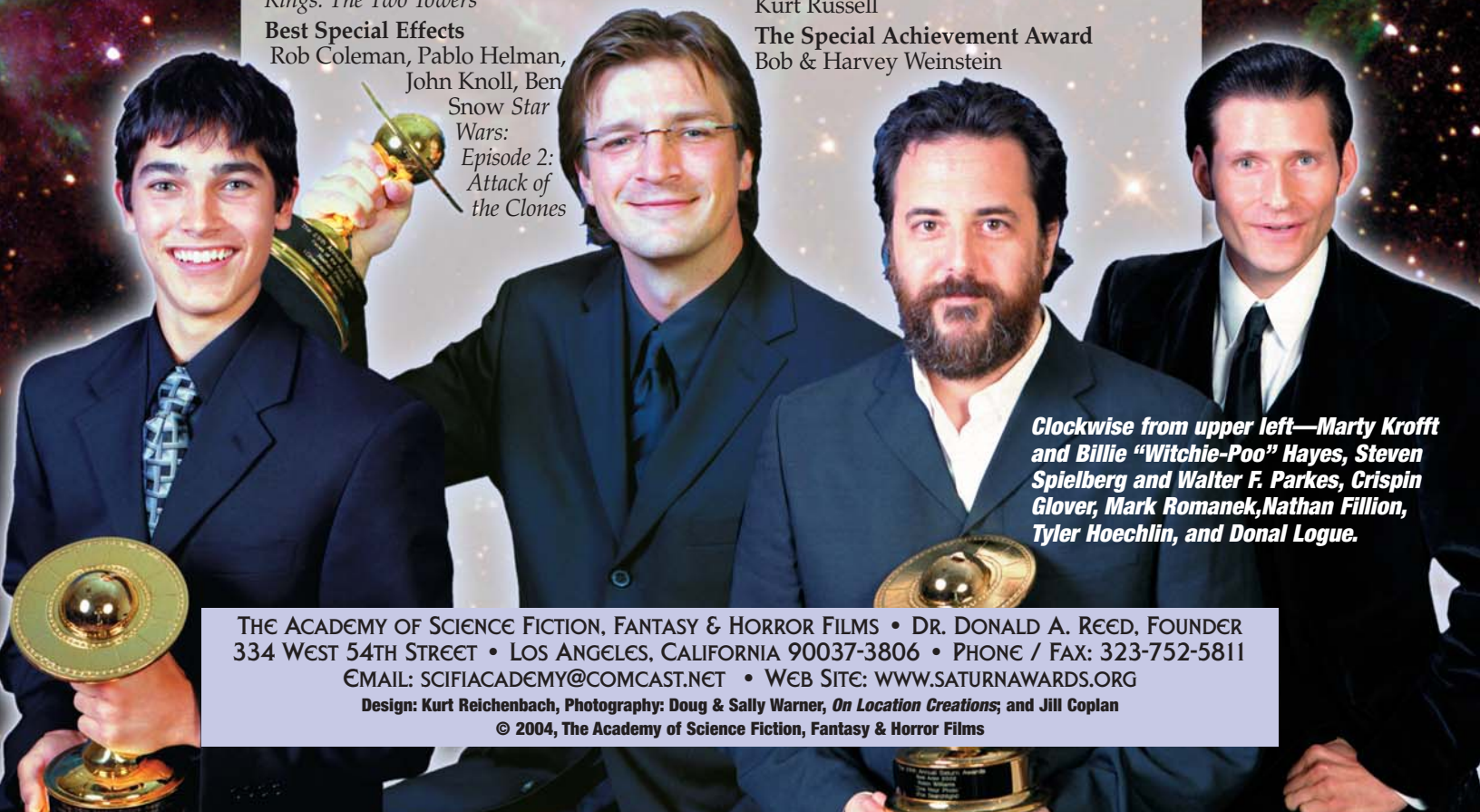
Clockwise from upper left—Marty Krofft and Billie "Witchie-Poo" Hayes, Steven Spielberg and Walter F. Parkes, Crispin Glover, Mark Romanek, Nathan Fillion, Tyler Hoechlin, and Donal Logue.