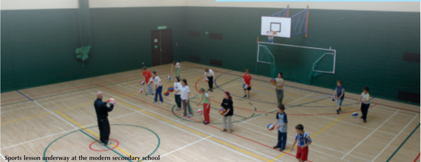
Sports lesson underway at the modern secondary school

The population has increased by over a third and is youthful, with 78% aged 55 years and under. Many Islanders can trace their origins back over 150 years to the early days of settlement and over 90% can claim either British birth or descent.