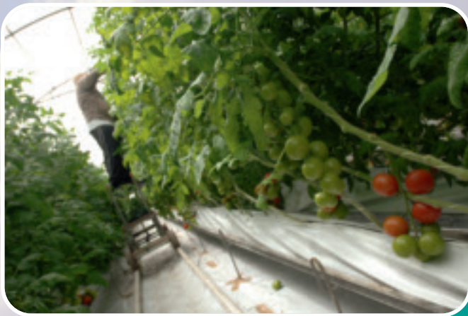
The hydroponic market garden

In this 25th Anniversary year of the Falklands Conflict, numerous visitors, including journalists, veterans and Royalty, have travelled to the Islands and witnessed first hand the remarkable Falklands success story.