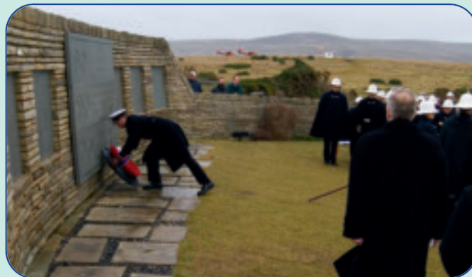
HRH the Earl of Wessex laying a wreath at San Carlos

On 17 June, ten thousand Falkland Veterans and their families took part in the National Commemoration in the presence of Royalty. Representing the Government was the Prime Minister, joined by senior military and political figures past and present, including Baroness Thatcher. The veterans marched down the Mall to the Queen Victoria Memorial, where HRH The Prince of Wales took the salute. A tri-service flypast, representing the squadrons that flew in 1982, paid their own tribute to the veterans. There was a live link up with the Falklands to a wreath laying ceremony at San Carlos, presided over by HRH The Earl of Wessex.