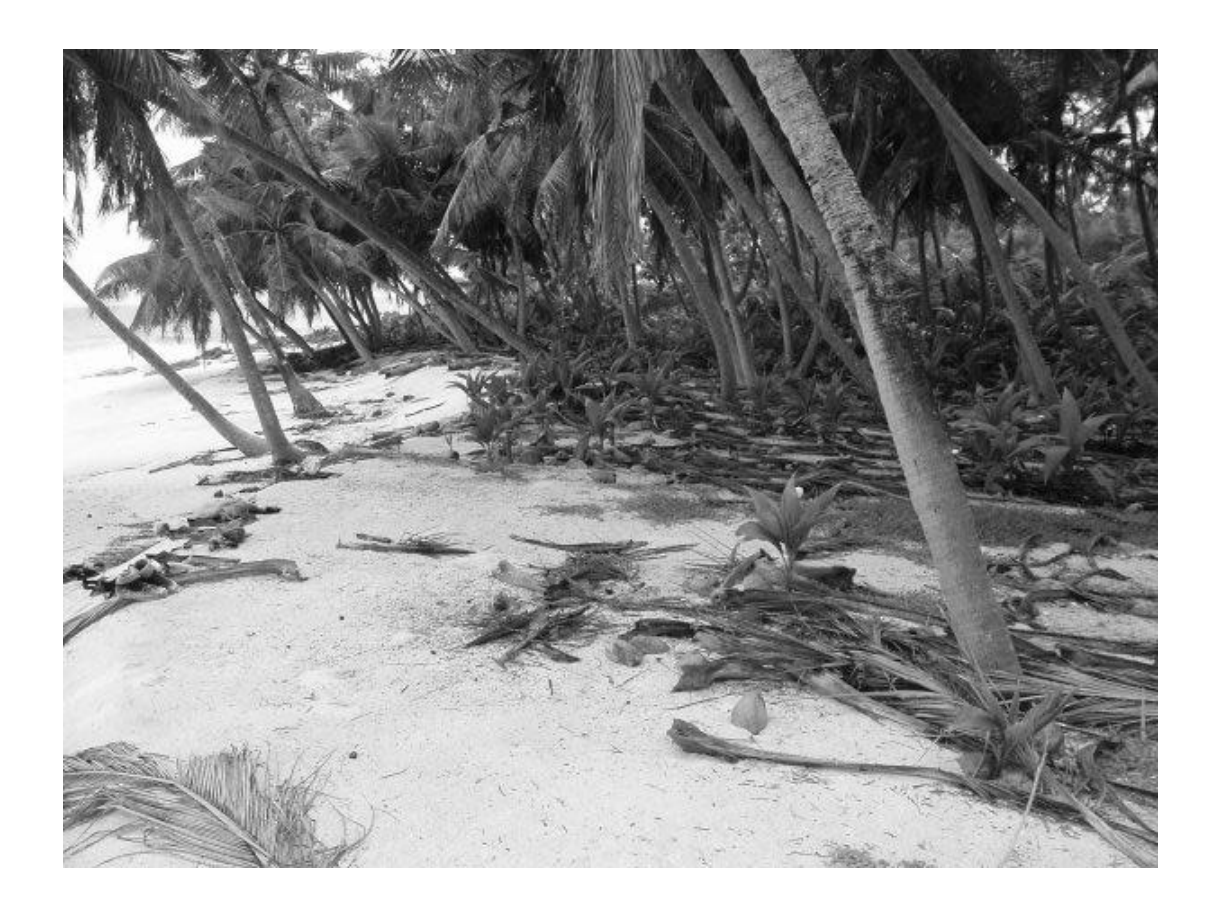
Figure 4. North Brother's thinning rim near the landing beach.

What of the corals themselves? These are critical for many reasons, one of which is that they grow, die and are turned into essential sand. The whole point of corals in this respect is to generate sand. I can end on good news. Underwater, no areas were found (yet) which were in any way stripped by the tsunami. This should not be surprising – after all, corals easily accommodate pounding storms and cyclones which last for days. In many areas, coral recovery is continuing very well following the massive mortality that took place in 1998. Many areas that were so depressingly devoid of live coral in the past few years now have 20, 30, even 50% of their substrate covered with young corals. This is not true everywhere yet, and many areas seem not to have recovered at all. But the corals are coming back slowly from their devastation of 1998. We can hope that those clones and clades that are returning are better warm-adapted than their predecessors were. They will need to be if they are going to survive far into the future given the general warning trends forecast for all tropical seas. The whole issue of the genetics and heat resistance of different corals is complex and alarmingly biochemical. It is one of the issues we will be researching in the 2006 expedition to Chagos, which will be focussing on many aspects of the longer term conservation and management of this extraordinary archipelago of reefs and islands.