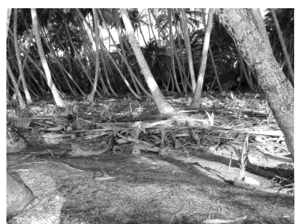
Figure 3. Eagle Island where all undergrowth was removed, including young palms and Scaevola . The ground vegetation here (2 months later) is only of newly sprouted coconuts. This is similar to the most heavily affected part of Diego Garcia.

In Salomon, more information was obtained from visitors on yachts than could be seen in our visit of just a few hours. Sand banks were shifted, and much sand apparently was pumped into the lagoon. Sand shifts around these islands seasonally, and probably the result of the tsunami was no more than an acceleration of this process. Anybody who did not know the area very well could think that nothing was out of the ordinary - there seem to be no areas of stripped vegetation. Observations of all shores and a walk around Ile Boddam, however, showed substantial erosion of the shores with 'steps' everywhere of 1-2 m high, and the yacht visitors reported that several turtle nests high on the shores had their eggs exposed, to be eaten by hermit crabs and, presumably, by rats.