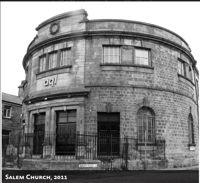
SALEM CHURCH, 2011