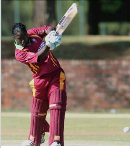
Deandra Dottin punches a ball