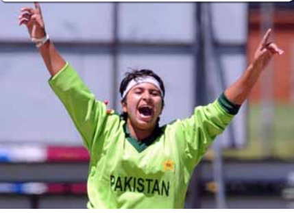
Nida Dar celebrates

FACT Batool is a fan of shopping and spending time with friends and family.