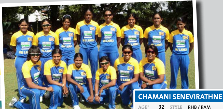
The Sri Lanka women's team