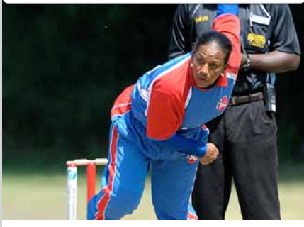
USA player in action against Canada