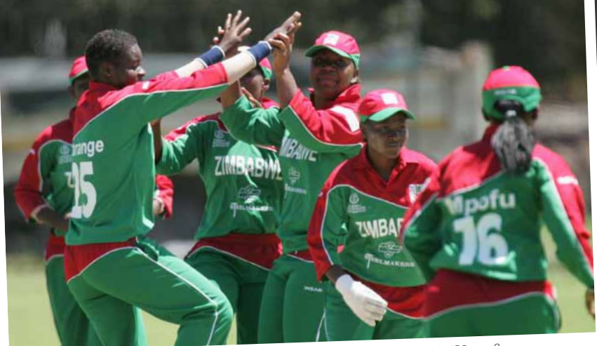
Zimbabwe celebrate the fall of a Scottish wicket at the ICC WWCQ 2008