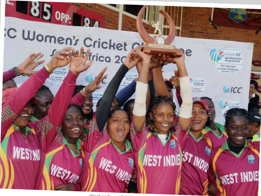
West Indies celebrates with trophy

FACT Ouintyne has a twin sister who is also very sporty.