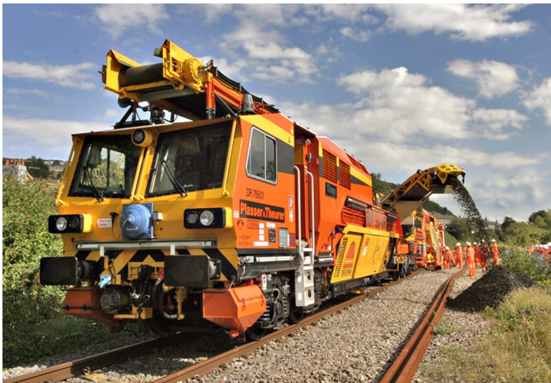
ABOVE: Seco-Rail showed off its new Medium Output Ballast Cleaner at Risca on 25 September to invited guests. The vehicle, No. DR76601, pictured during the demonstration, carries the name Olwen , a character from Welsh mythology. John Stretton

One of the local newspapers has reported that the new station would become a transport interchange, providing easy connections between rail and public transport bus services and could also have a bridge linking Armada Way with Central Park.