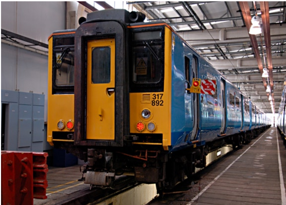
ABOVE: The latest Class 317 to be refurbished, No 317892 inside Ilford Depot on 27 September prior to being named.

■ The North Wales Coast line was closed for a short period on 26 September after a car left the A548 road, overturned and landed on its roof on the railway. Both occupants suffered minor injuries and no trains were involved.