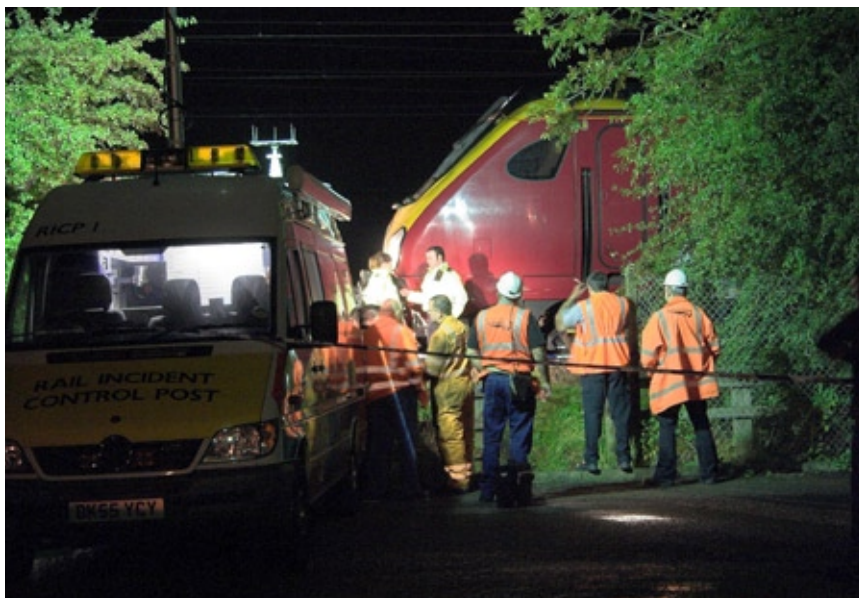
ABOVE: On the evening of 25 September, Network Rail staff, police and accident investigators surround the front of Class 221 No. 221136 Yuri Gagarin at Copmanthorpe, just south of York.

1A66 19.25 Newcastle-Sheffield, which will be extended to Derby for the duration of the hire.