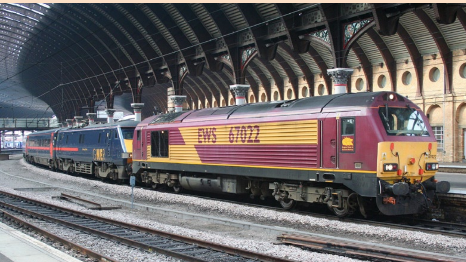
BELOW: Engineering work on the East Coast Main Line resulted in the 08.50 Doncaster - Glasgow Central, powered by Class 91 No. 91127 Edinburgh Castle , being dragged as far as York by Class 67 No. 67022. The train is pictured shortly after arrival at York. Ian Broadhead