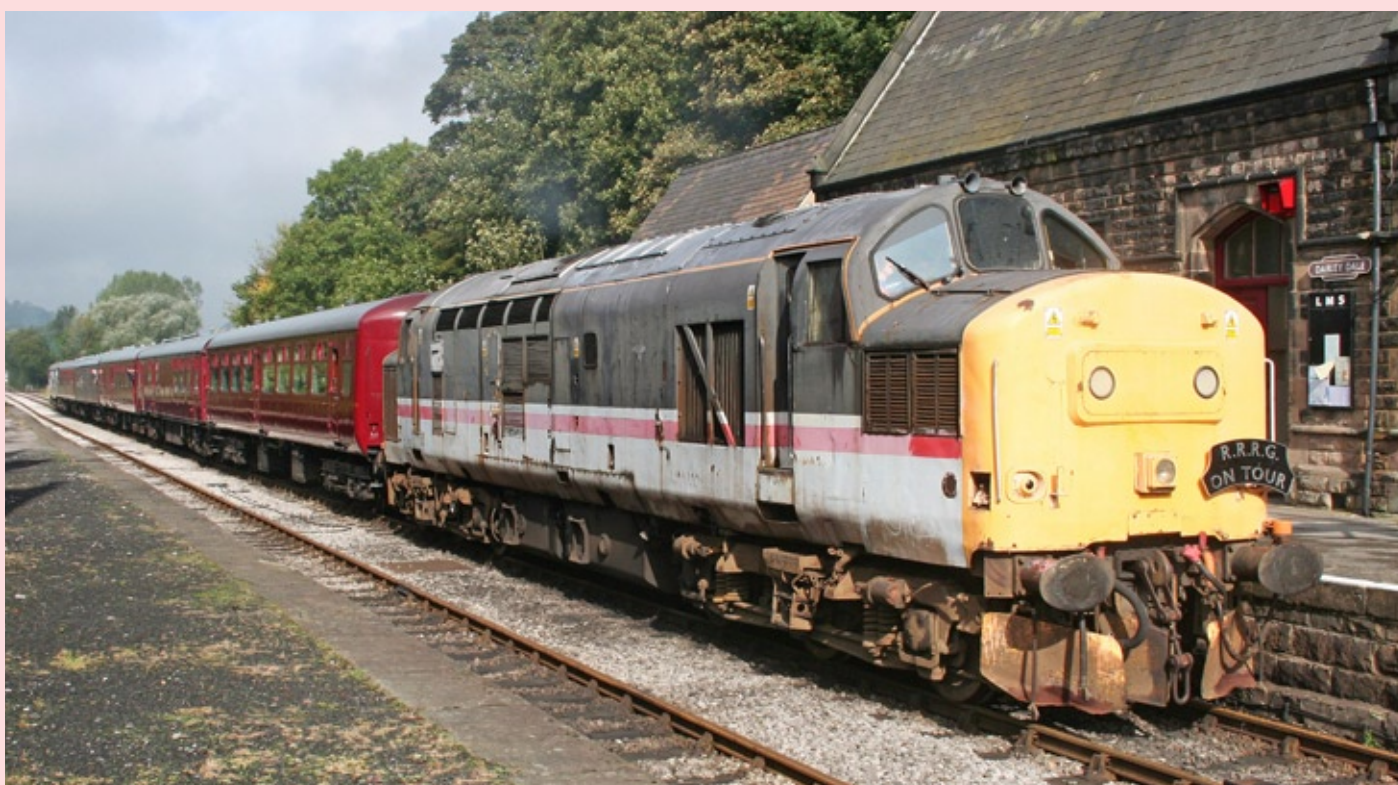
BELOW: The first Class 37 to carry the Intercity colour scheme is back in traffic on Peak Rail. The locomotive, No. 37152 is pictured at Darley Dale on 23 September with a Rowsley to Matlock Riverside service during the line's diesel gala weekend. The Heritage Shunter Trust collection of ex-BR diesel shunting locomotives were also in use and on display during the event. Ian Broadhead