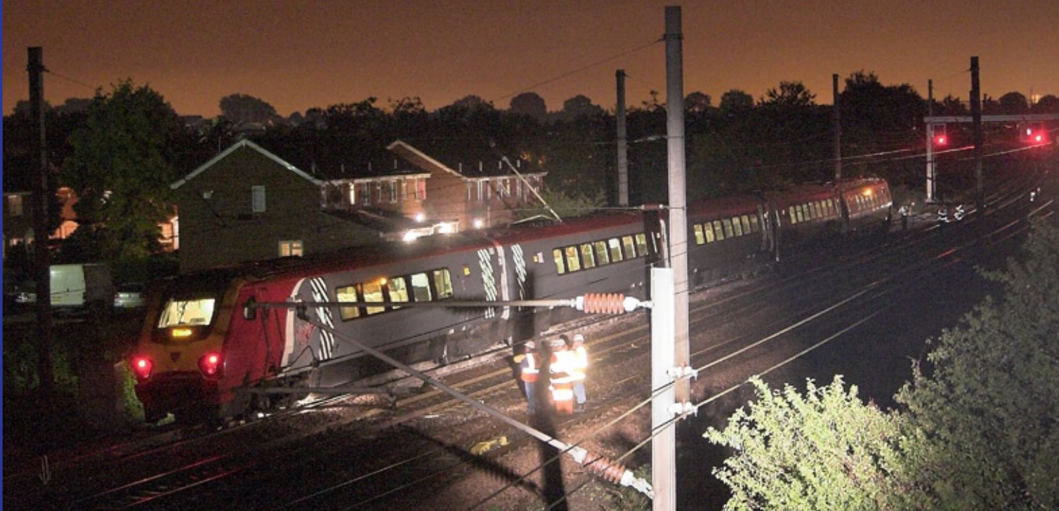
ABOVE: Late on 25 September, Class 221 No. 221136 Yuri Gagarin stands on the down Leeds line at Copmanthorpe, south of York, shortly after the accident, with Network Rail, British Transport Police and accident investigators on the scene.