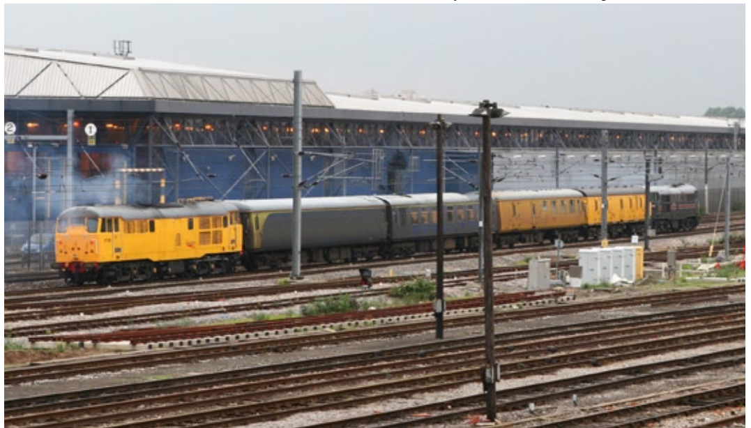
BELOW: With North Pole Eurostar depot in the background, a facility which will close in the not-too-distant future with the opening of the new depot at Temple Mills, FM Rail Class 31 No. 31105 leads Network Rail yellow-liveried classmate No. 31106 westwards with the 17.01 Old Oak Common - Newton Abbot Hackney Yard test train on 25 September. Chris Holt

Late News ■ Late News ■ Late News ■ Late News ■