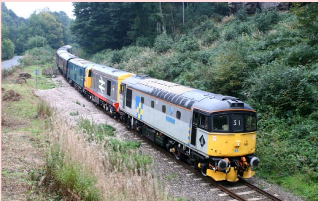
LEFT MIDDLE: Following the success of its recent Diesel Gala, the Spa Valley Railway held a Diesel Day on 16 September. The number of locos working each train increased as the day wore on! Class 33 No. 33063 R. J. Mitchell in Railfreight Aggregates livery, visiting Class 20 No. 20118 in Railfreight red-stripe from the South Devon Railway and Class 73 No. E6047 (73140) in electric blue-livery power past High Rocks with the 16.30 service from Tunbridge Wells West to Groombridge. On the rear of the train was fellow resident Class 33 No. 33065.