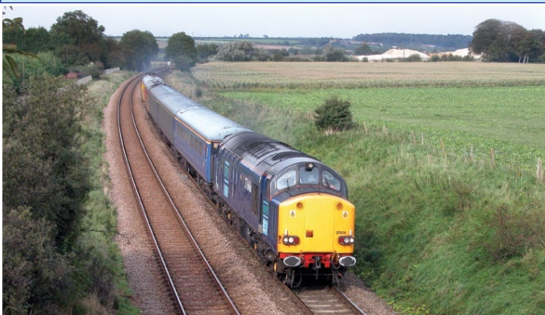
ABOVE: DRS Class 37/6 Nos. 37606 leads the 09.28 Derby RTC-Derby RTC via Immingham on 27 September past Kettleby, near Barneby on the return leg to Derby. On the rear is classmate No. 37610 The Malcolm Group.

It is the intention that home printing will be rolled out on suitable routes across the national rail network and that there should be in due course a single national standard, based on the early experience.