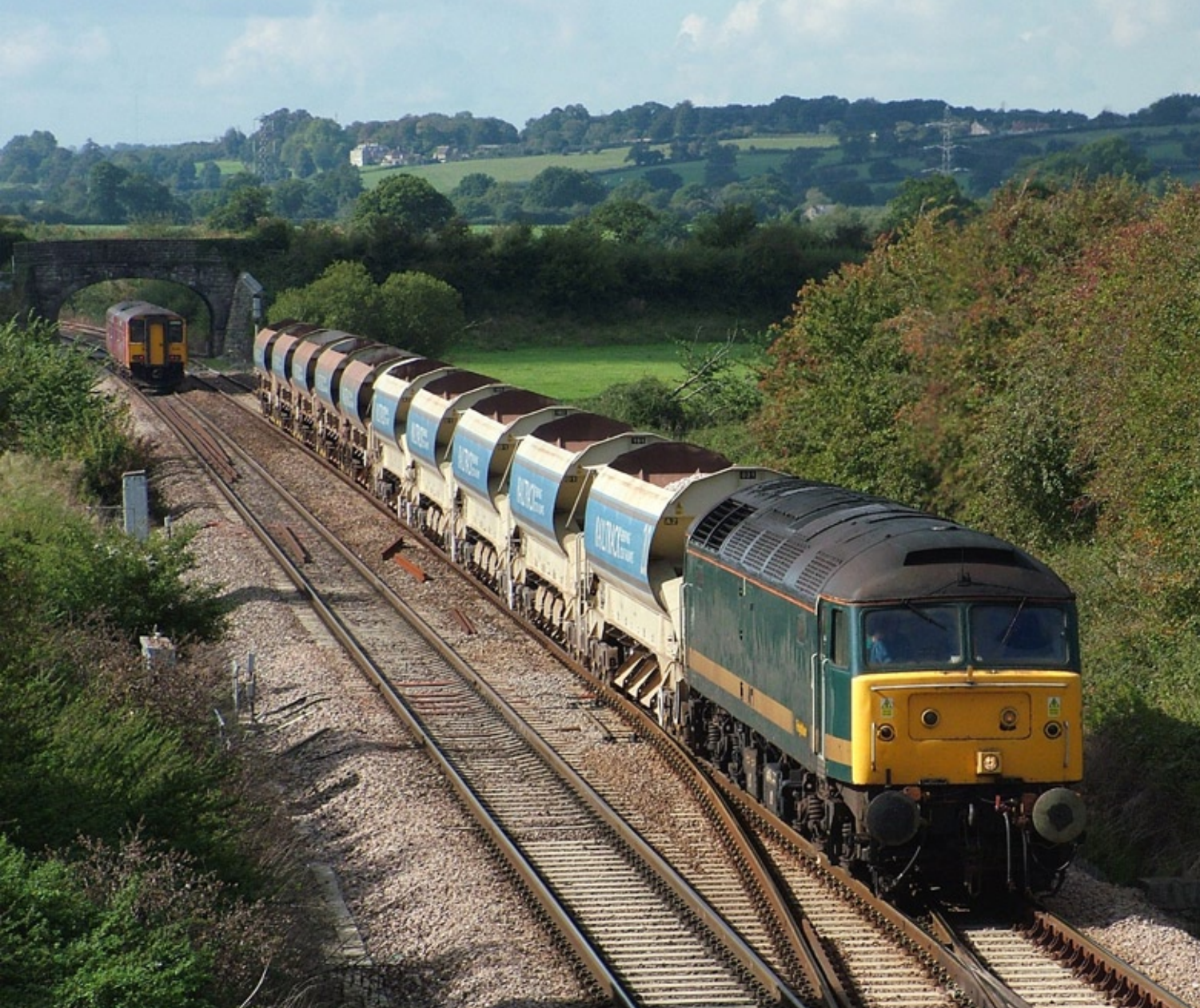
ABOVE: Freightliner Heavy Haul has begun operating Network Rail trains to and from the revamped Fairwater Yard at Taunton. On 26 September, Class 47/4 No. 47811, still carrying the base green livery of its previous operator, First Great Western, approaches Westbury with the 10.00 departmental service from Fairwater Yard formed of 10 'Autoballaster' wagons for reloading at the 'Virtual Quarry'. Mark Few