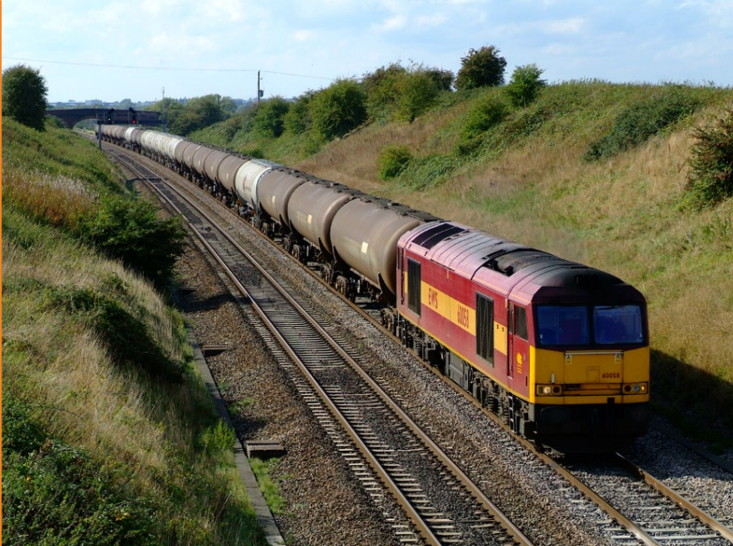
ABOVE: EWS Class 60 No. 60058 was in charge of the Westerleigh to Lindsey oil train on 23 September, which diverted via Kemble, Didcot and Banbury. The train is shown passing Bouton on the Great Western main line, providing the rare sight of an eastbound petroleum service on the GWML in daylight! Chris Wilkinson