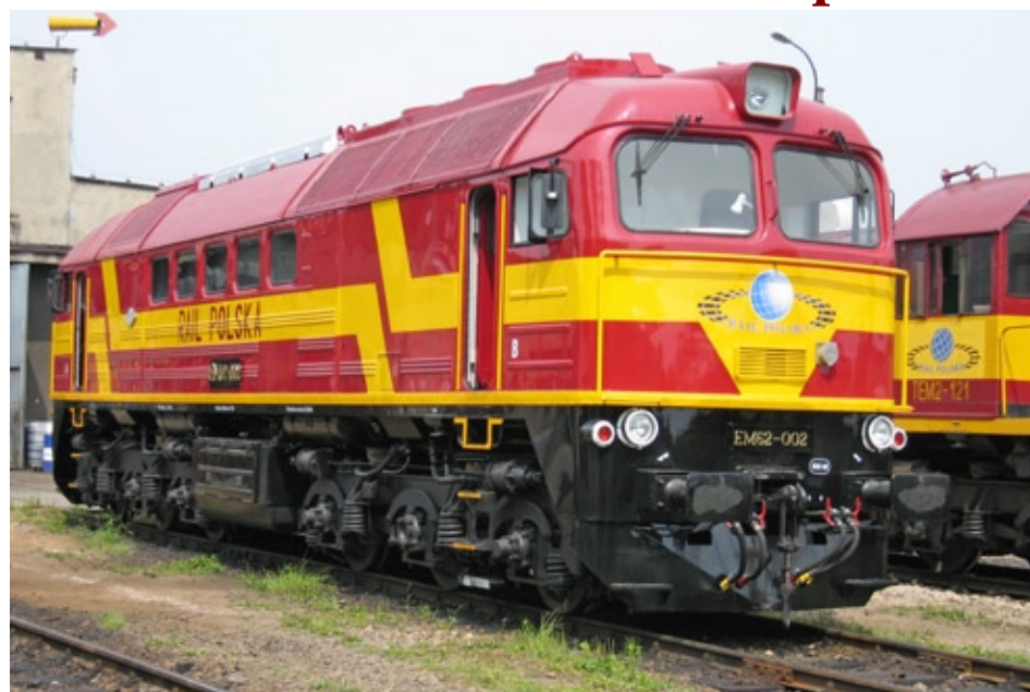
RIGHT: EM62-002 is seen at the Rail Polska workshops at Wlosienica in southern Poland.

The bodyshell was completely stripped and prepared before a 16-cylinder GM 16-645E3 from a former Amtrak F40PH locomotive was installed. The bogies and traction motors are from withdrawn German class 120 diesels; these were chosen as they had the same bogie and brake rigging equipment as on the sister ST44 locos that already operate in Poland. The bogies were overhauled at Bydgoszcz by Polish locomotive rebuild factory PESA. It is possible that EMD traction motors may be used on future rebuilt locos. Six locos are being converted during 2006 and more will follow in 2007.