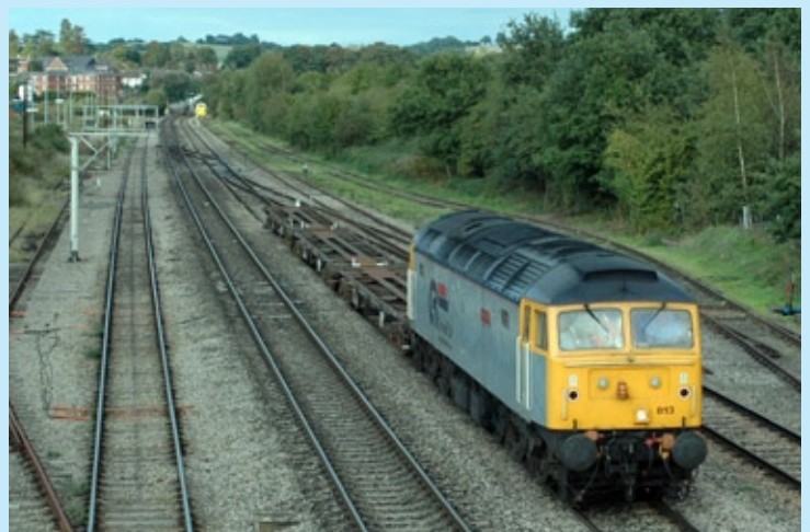
ABOVE: Class 47/4 No. 47813 John Peel passes Bromsgrove on 28 September at the foot of the Lickey Incline while working the 12.30 Healey Mills to Gloucester freight service for Cotswold Rail, conveying three container flat wagons.

Kingfisher has also rescheduled No. 34067 Tangmere for its 11 November outing from Victoria to Margate to replace No. 850 for the same reason.