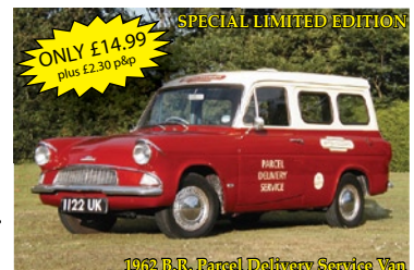
1962 B.R. Parcel Delivery Service Van

To download an order form, visit our website at www.1122uk.com