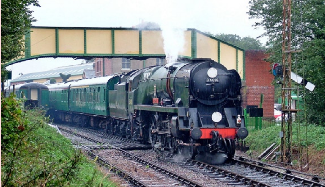
LEFT: Producing a realistic image of a Southern Region operation, ex-Southern Railway West Country Pacific No. 34016 Bodmin departs from Ropley in pouring rain with the 12.36 Alton - Alresford service on 22 September. Don Benn