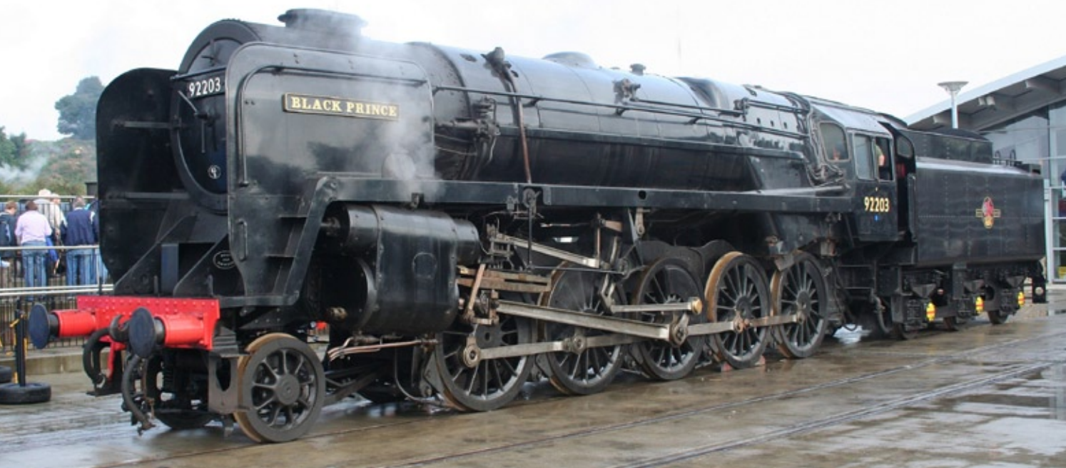
ABOVE: As part of the Rail Festival, the National Railway Museum at Shildon played host to two locomotives in steam, one being the NRM's own ex-GWR 'City' 4-4-0 No. 3440 City of Truro , the other being David Shepherd's ex-BR 9F 2-10-0 No. 92203 Black Prince , pictured here on 24 September. Ian Broadhead