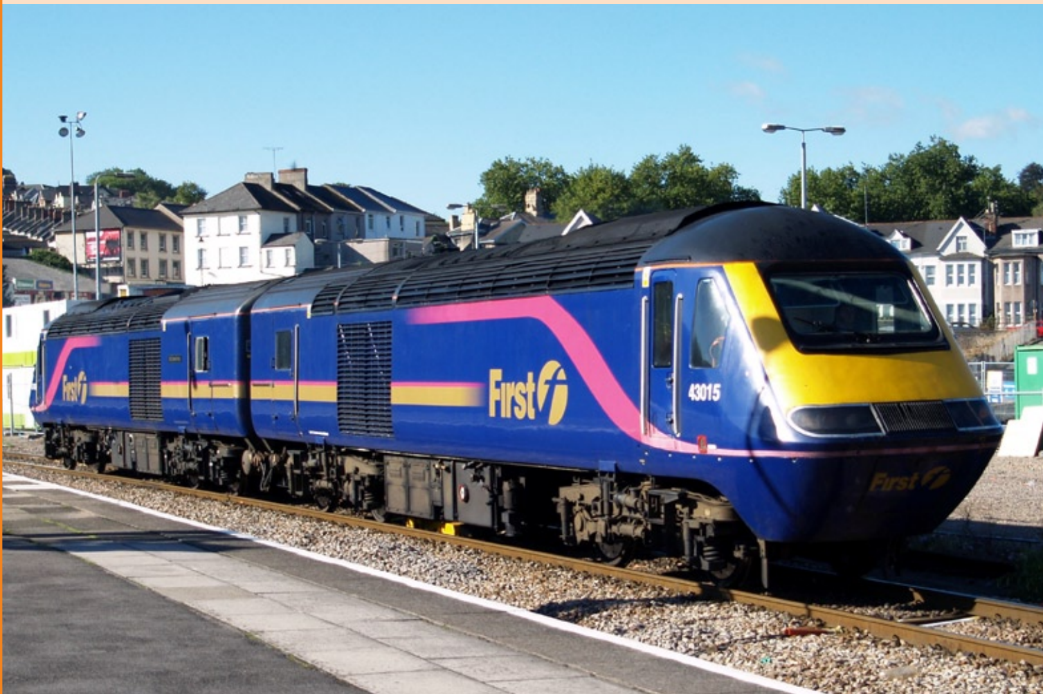
BELOW: First Great Western power cars Nos. 43015 and 43149 BBC Wales Today pass through Newport on 26 September, forming a Swansea Landore to Bristol St. Philips Marsh move.