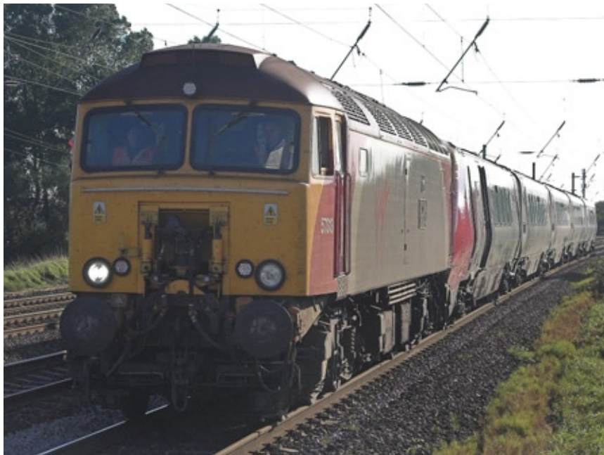
BELOW: Late afternoon the following day and Class 57/3 No. 57313 Tracy Island prepares to move the damaged Voyager into York, finally clearing the line, nearly 20 hours after the accident.