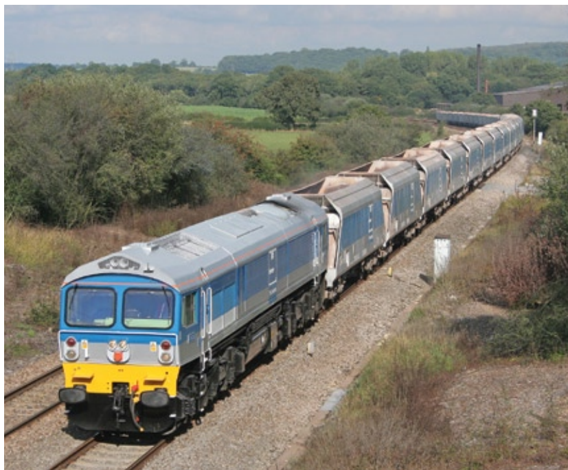
ABOVE: Recently repainted from its green and orange Mendip Rail livery back into standard Foster Yeoman blue and silver colours, Class 59/0 No. 59002 Alan J. Day passes Witham Friary on 25 September with an Acton-Merehead Quarry empty aggregate service. Tom Curtis