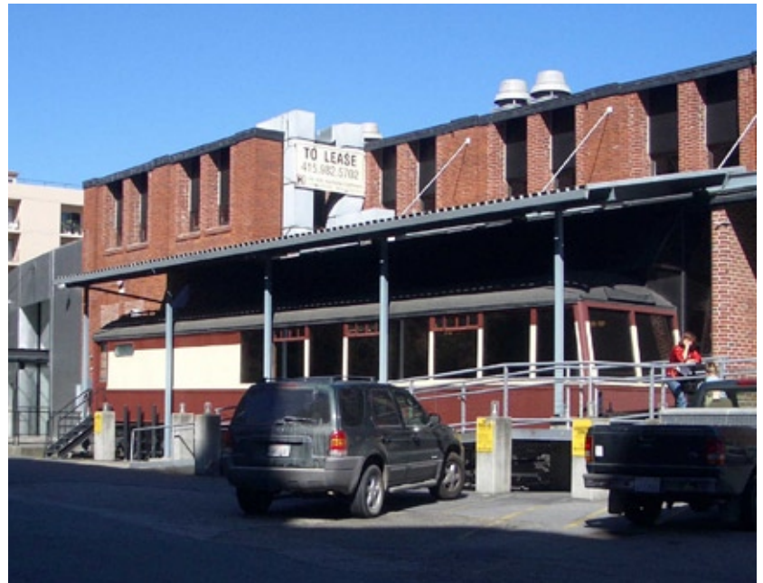
ABOVE: Pullman Car 14 as it is today, surrounded by San Francisco offices. The Swanage Railway hope to return the coach to the UK and restore it for use on the railway.

After withdrawal in 1967 with the end of steam, Car 14 went to North America as part of the Flying Scotsman