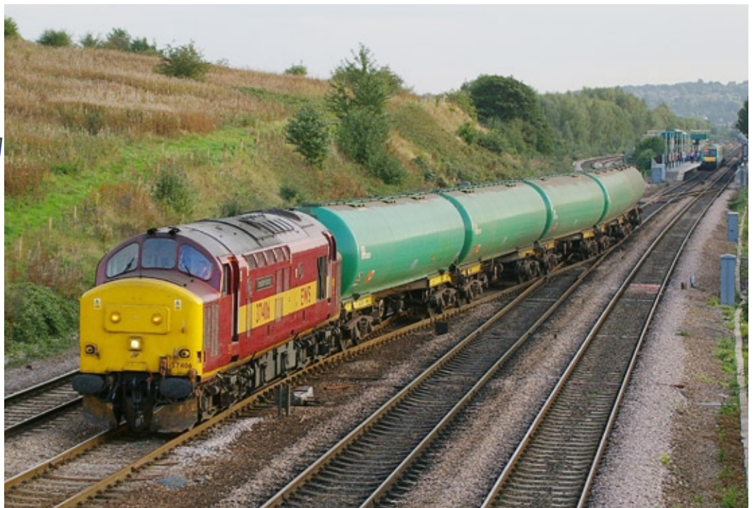
ABOVE: Class 37/4 No. 37406 The Saltire Society crosses to the freight lines at Chesterfield on 21 September with the 16.16 Sinfin - Doncaster Belmont tanks. Steve Philpott

Railway Herald is produced by Railway Herald Ltd © Copyright Railway Herald Ltd 2006