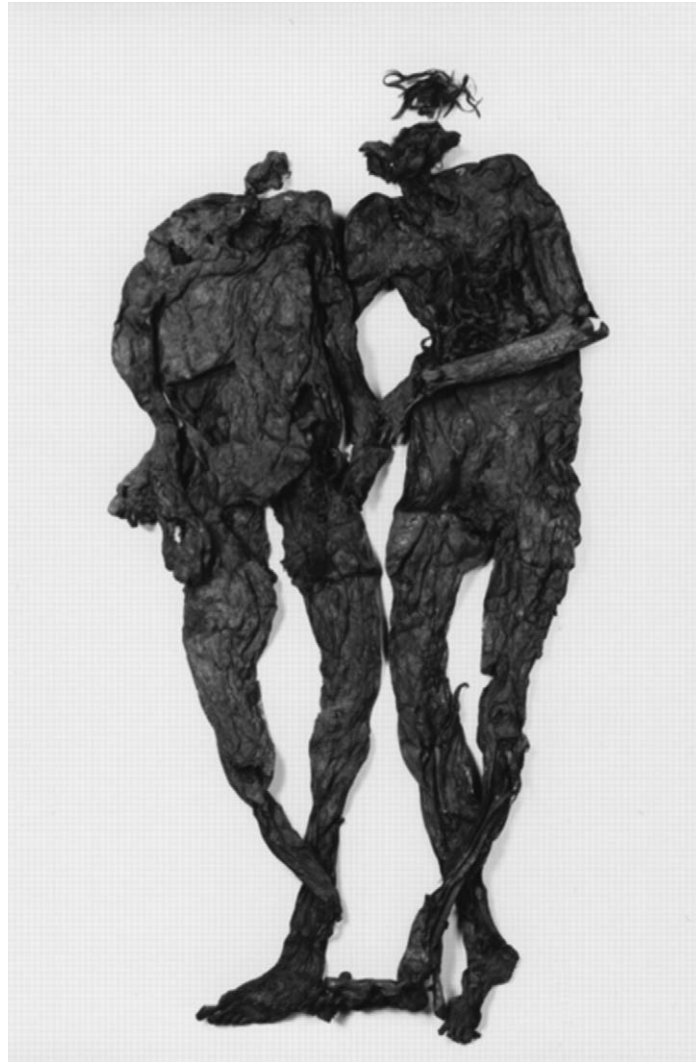
Fig. 1. The “Weerdinge Couple”—two men whose bodies were found in Bourtangter Moor near Weerdinge, the Netherlands, in 1904. The men died approximately 2000 years ago. Drents Museum, Assen.

in 1952 [33]. It was another 20 years before the next two bodies, of Tollund Man and Elling Woman, were to be radiocarbon dated [34]. Until the discovery of Lindow Man, in 1984, radiocarbon analysis was not considered an ideal means for dating bog bodies. This is understandable, because a substantial amount of bone or skin was needed for conventional radiocarbon dating, and museum curators were of course reluctant to sacrifice the necessary samples. Moreover, bog bodies were not a ‘hot issue’ in those days.