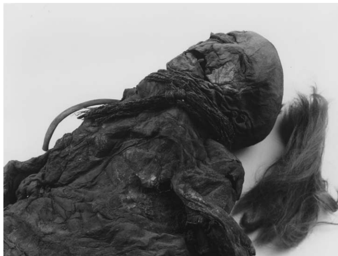
Fig. 2. “Yde girl”, the body of a strangled 16-year-old girl found near Yde, the Netherlands, in 1897. Note the cord used to strangle the girl visible around her neck. Drents Museum, Assen.

is consistent with our measurements. Bone from the body (KIA-15123) yielded a younger date. An associated wood sample (KIA-15911) yielded a date in the Bronze Age, which is of course too old.