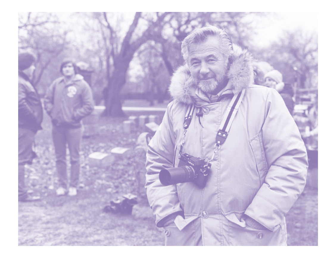
British Academy of Film and Television Arts A Tribute to Bryan Forbes CBE