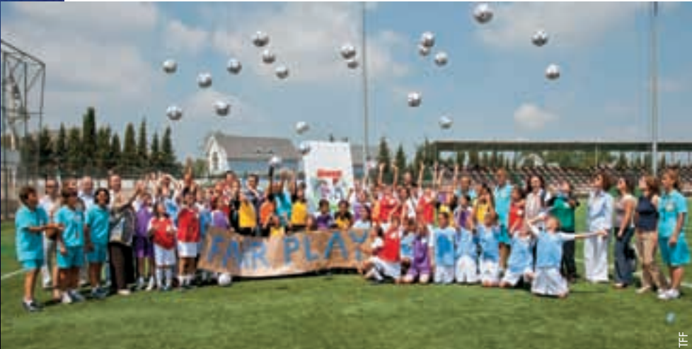
The biggest ever children's football tournament to be held in Turkey