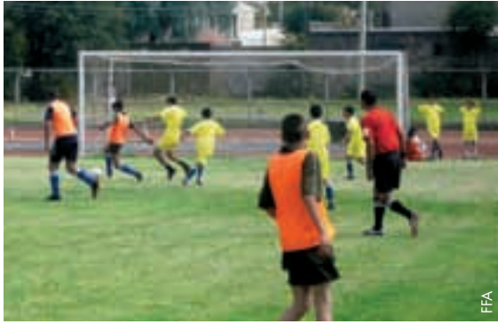
Football was a very popular activity of the Day of Sportsmen.

The Day of Sportsmen was celebrated on 23 June in the city of Artashat. About 800 local school and kindergarten children took part. The event was organised by the Football Federation of Armenia's grassroots department in cooperation with the non-governmental organisation Sevan, under the supervision of experienced instructors from the Open Fun Football Schools. All sorts of sports activities were on offer at the city's stadium, including boxing, wrestling, karate and football, of course. The day ended with a tournament for local football teams. Brightly coloured sports kits and the happy smiles of the children and football fans gave the day a festive atmosphere.