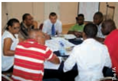
The FA is sharing its expertise in the field of club and league development.

Given the mature and well-established football systems which exist in England, the participants on the course were keen to adopt FA good practice in the administration of the game in their respective countries.