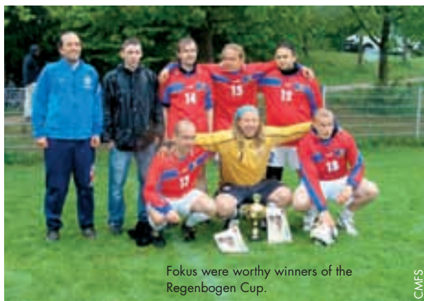
Fokus were worthy winners of the Regenbogen Cup.