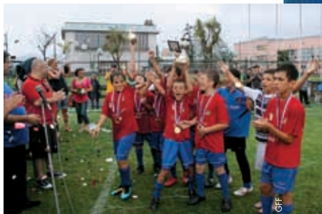
The Zugdidi school No. 4 won the schools cup.