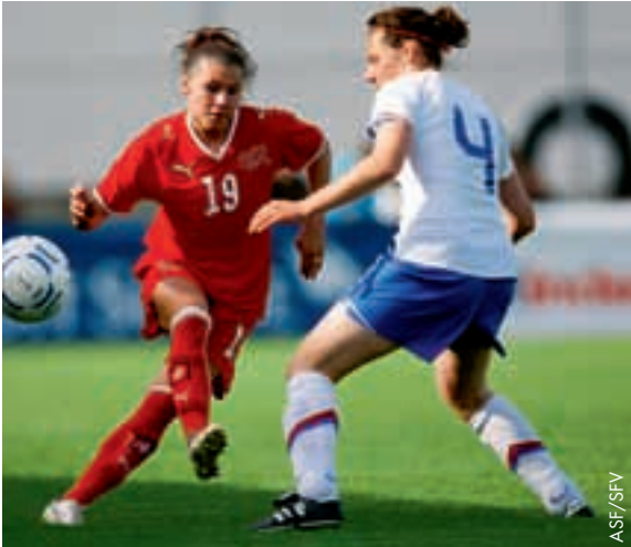
Swiss striker Ramona Bachmann in action