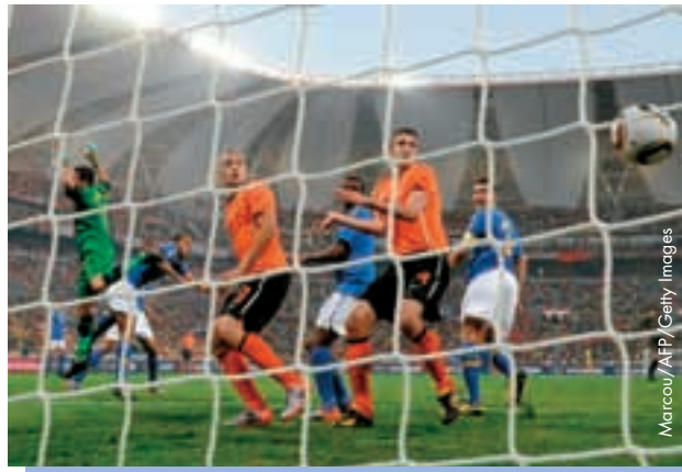
The Netherlands pulled off a major feat by beating Brazil in the World Cup quarter-finals before going on to reach the final.

England, who have decided to retain Fabio Capello as coach despite a disappointing World Cup, are expected to win Group G, where they will face a Switzerland side used to big-match occasions. However, apart from a win over world champions Spain, Ottmar Hitzfeld's team failed to convince in South Africa. Bulgaria, led by Stanimir Stoilov, will hope to qualify for the final round again after missing out in 2008.