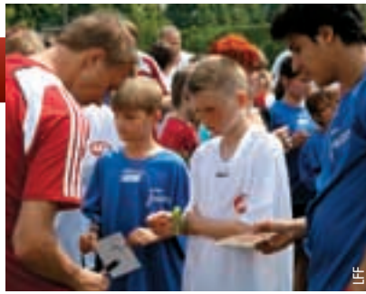
Latvian internationals signing autographs

The trip to Hamburg is being organised in cooperation with the Samaritan organisation in Hamburg and the children's tickets there and