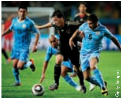
Mesut Özil (8) in action against Uruguay's Walter Gargano during the World Cup in South Africa – Özil is just one of Germany's European U21 Championship winning team who has risen to the ranks of the senior national team.