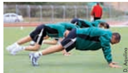
The referees participating in a practical session during the residential course

Maltese top division referees and assistant referees were busy at the end of last season when they spent time at a hotel during a weekend residential seminar, the first of its kind, organised by the Malta FA's referee board. This was part of an ongoing series of seminars aimed at acquainting match officials with the latest refereeing techniques.