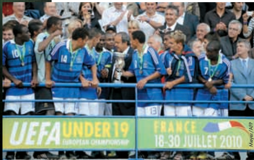
The UEFA president hands over the trophy.