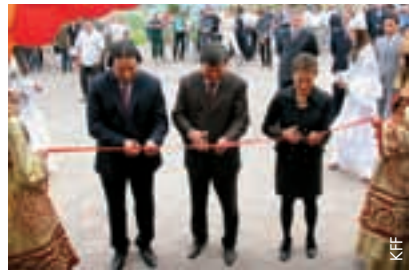
Cutting the ribbon

The hotel complex at the centre includes 19 double and 9 single rooms, a conference hall, pool, sauna and gym, medical and massage rooms, a kitchen, a dining room and recreation rooms. The technical centre, destined for Kazakhstan's national teams, is equipped to facilitate training and match preparation. Two natural turf pitches are soon to appear alongside the artificial one.