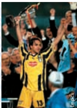
Alessandro Nesta, captain of S.S. Lazio, holds up the trophy at the end of the very last competition, in 1999.

The Cup Winners' Cup continued to prosper for almost 40 years, but eventually, like the two teams who had contested the first ever encounter in the competition back in 1960, it bit the dust. A victim of the success and the formula of the UEFA Champions League, the Cup Winners' Cup was staged for the final time during the 1998/99 season, after which it was absorbed by the UEFA Cup. ●