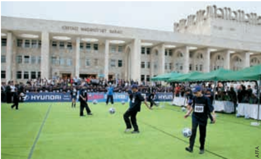
Who can keep the ball in the air the longest?