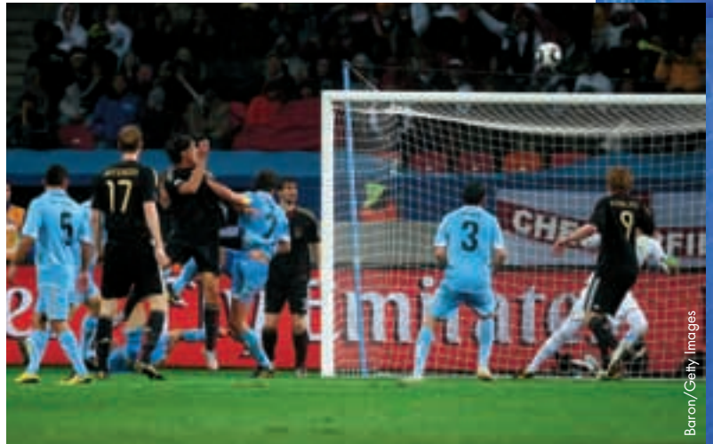
Germany, who are not renowned for flunking major tournaments, took bronze by beating Uruguay in the match for third place.

This time, they will face a Montenegro side coached by Croatian Zlatko Kranjcar. Meanwhile, John Toshack's Wales appear more than capable of causing the occasional upset against the favourites.