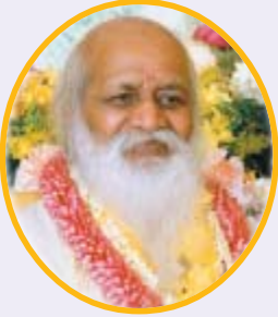
His Holiness Maharishi Mahesh Yogi