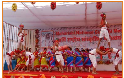
Students of MVM Bilaspur, Presenting folk dance.