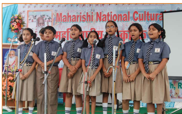
Students presenting Group Song in Interschool Group Competition