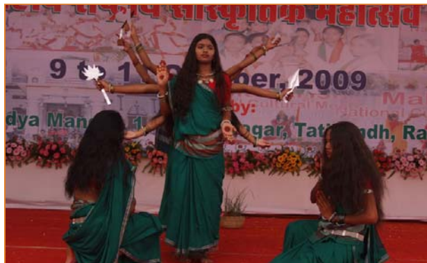
Students of Maharishi Vidya Mandir Presenting Nav Devi Avatar