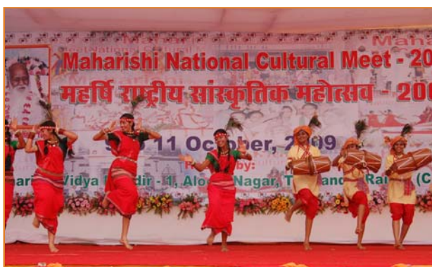
Students of MVM Bilaspur Presenting Chhattisgarhi folk dance