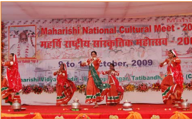
Students of Maharishi Vidya Mandir Presenting Rajasthani folk dance