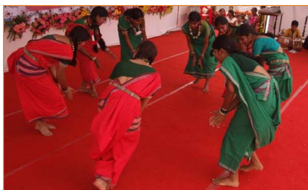
Students of Maharishi Vidya Mandir Presenting Chhattisgarhi folk dance