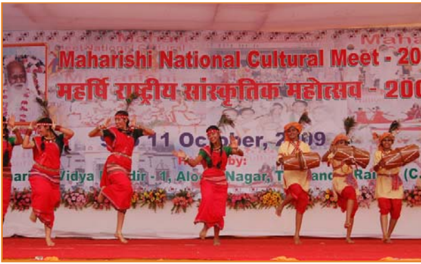
Students of Maharishi Vidya Mandir Presenting folk dance