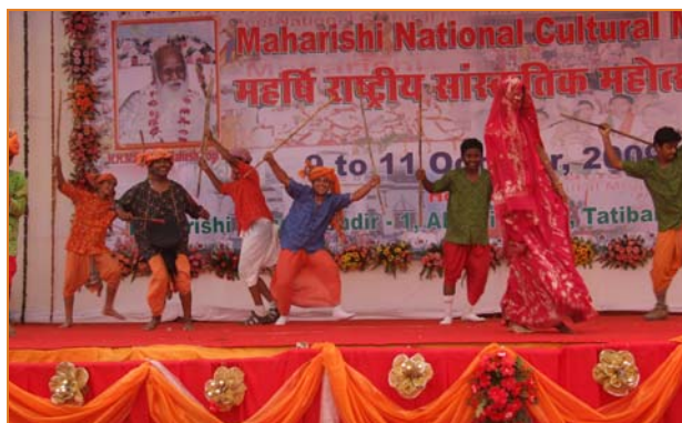
Students of Maharishi Vidya Mandir Presenting Raee folk dance