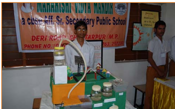
Students of MVM Chatarpur presenting their models in Science & Maths Exhibition.