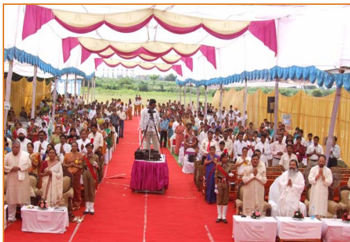
MVM students, Staff, Chief Guest and Guest of Honor are performing Guru Parampara Pujan on the occasion of Maharishi National Cultural Celebration.