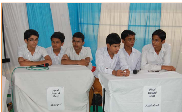
MVM Students Participating in National Level Quiz Competition.