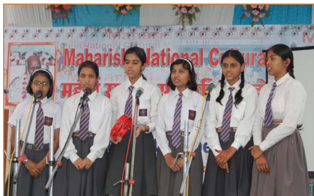
Students presenting Group Song in Interschool Group Competition