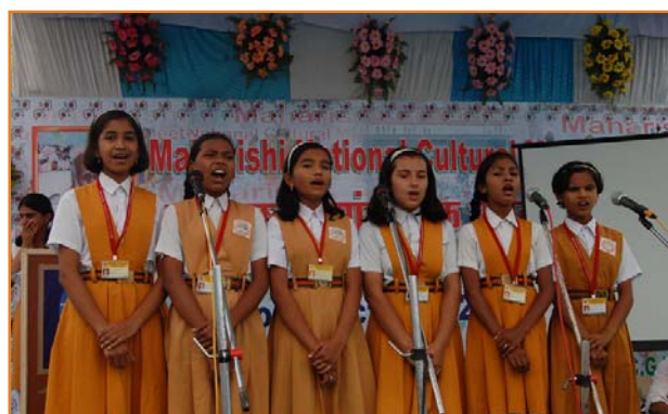
Students of Maharishi Vidya Mandir Presenting Group Song