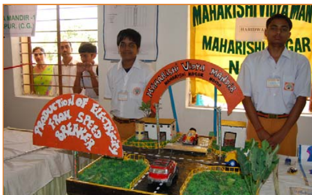
Students of MVM Maharishi Nagar, Noida presenting their models in Science & Maths Exhibition.