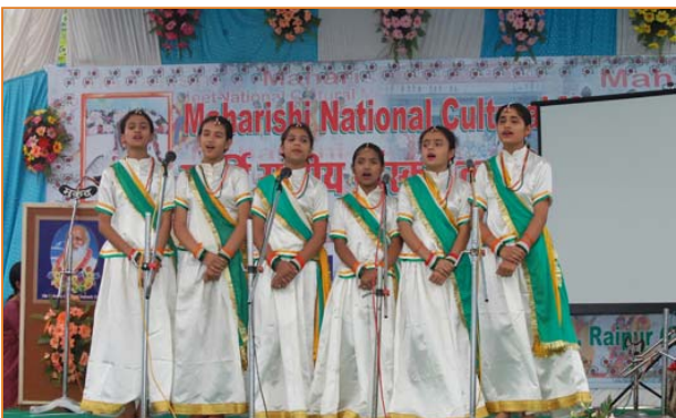
Students of Maharishi Vidya Mandir Presenting Group Song.