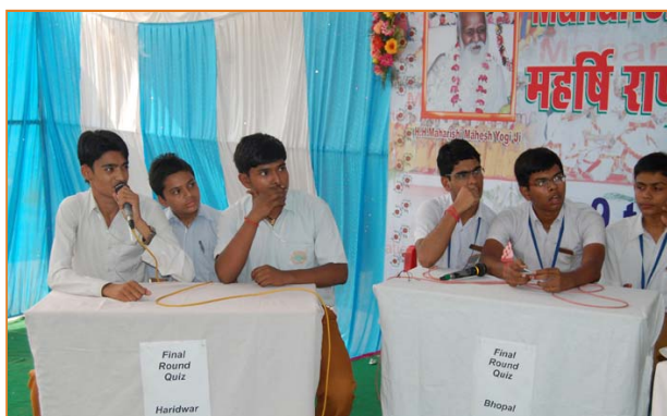
MVM Students Participating in National Level Quiz Competition.