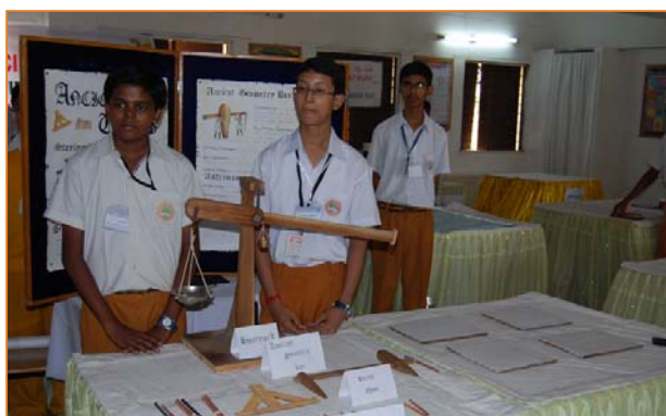
MVM students presenting their models in Science & Maths Exhibition.