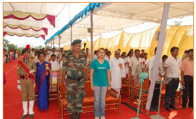
Audience at valedictory function Maharishi National Cultural Celebration Honoring National Anthem.