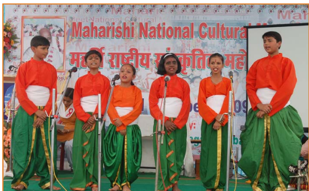
Students of Maharishi Vidya Mandir Presenting Group Song.