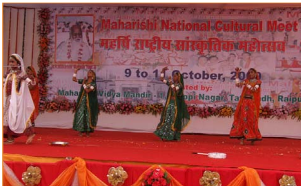
Students of Maharishi Vidya Mandir Presenting Rajasthani folk dance