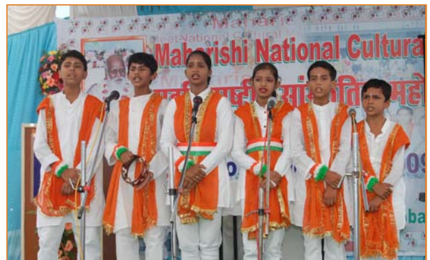
Students of Maharishi Vidya Mandir Presenting Group Song.