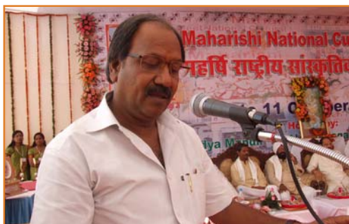
Hon'ble School Education Minister, Government of Chhattisgarh, Shri Brijmohan Agrawal addressing at the valedictory function.