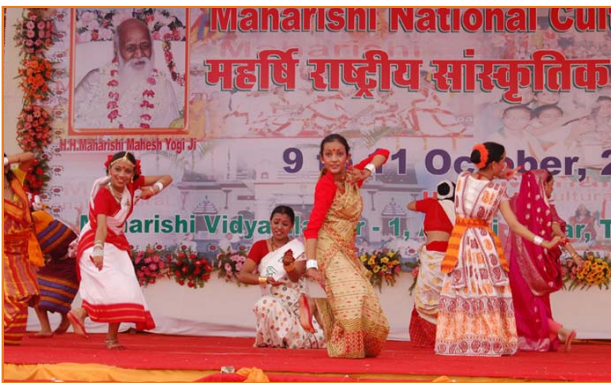
Students of Maharishi Vidya Mandir Presenting North-East folk dance