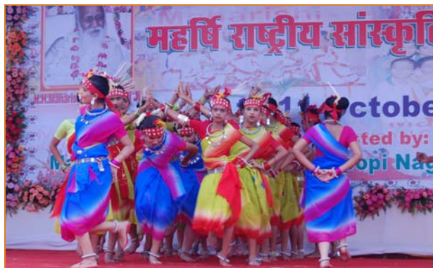
Students of Maharishi Vidya Mandir Presenting Chhattisgarhi folk dance