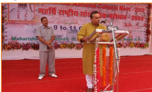
Hon'ble Agricultural Minister, Government of Chhattisgarh, Shri Chandrashekher Sahu addressing participants and audience.

“Cultural Meet is the best medium for the students of various states with different cultural and languages to learn and interact with each other and comprehend the value of nationalism and unity” – Hon'ble Agricultural Minister, Government of Chhattisgarh, Shri Chandrashekher Sahu expressed these views on Friday during the inaugural ceremony of the three-day Maharishi National Cultural Celebration 2009.