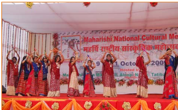
Students of Maharishi Vidya Mandir Presenting Garba dance