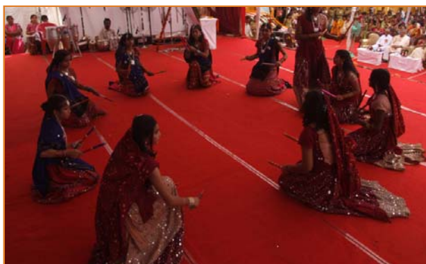
Students of Maharishi Vidya Mandir Presenting Garba dance