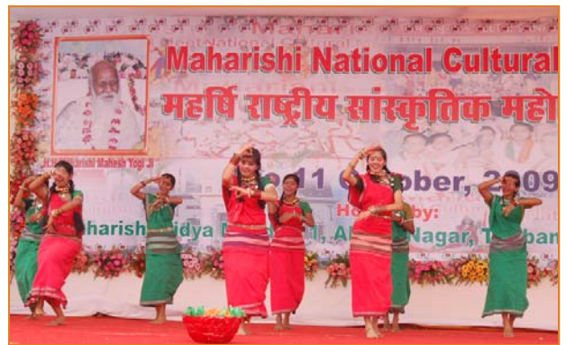
Students of Maharishi Vidya Mandir Presenting Chhattisgarhi folk dance