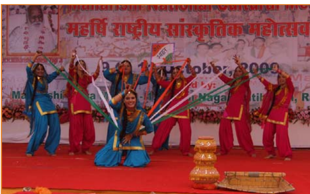
Students of Maharishi Vidya Mandir Presenting Punjabi folk dance