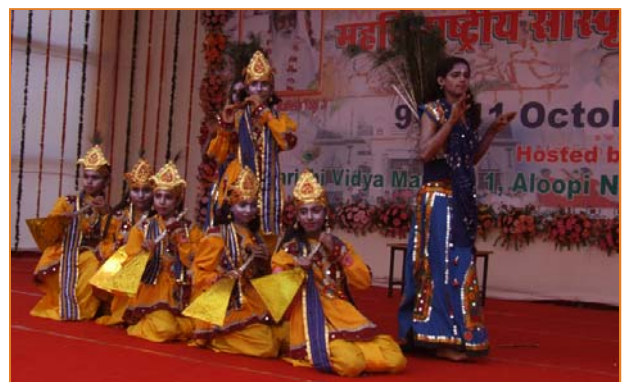
Students of Gyan Bharti Public School Presenting Krishna Leela