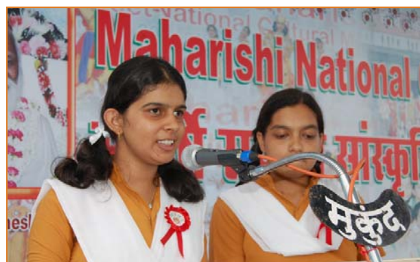
Students of Maharishi Vidya Mandir Raipur, Anchoring the Programme on the Occasion of Maharishi National Cultural Celebration 2009 at Raipur