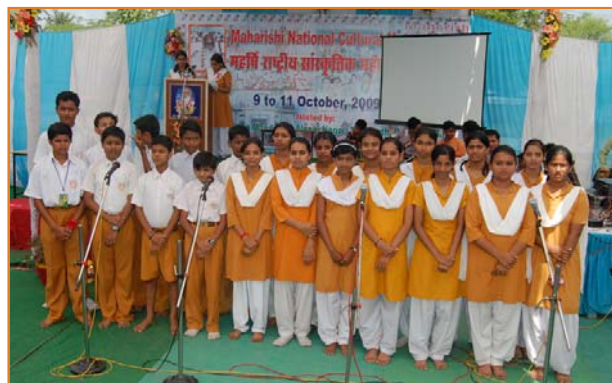
Students of Maharishi Vidya Mandir Presenting Group Song