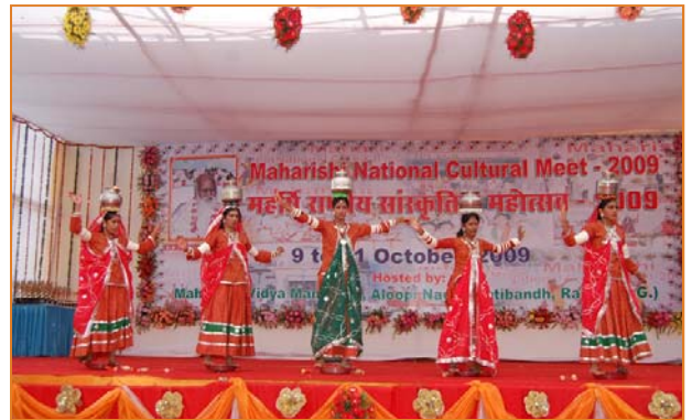
Students of Maharishi Vidya Mandir Presenting Kumaoni folk dance