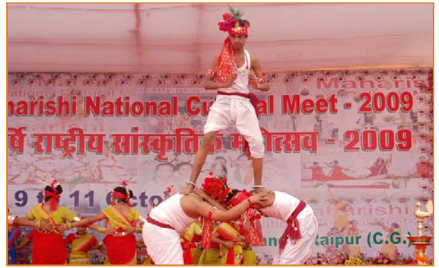
Students of Maharishi Vidya Mandir Presenting folk dance