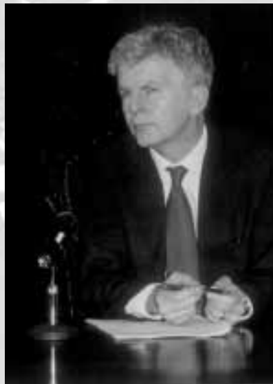
Mike O'Brien MP