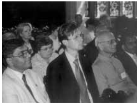
Participants at the National Meeting

The 2004 Network National Meeting, “Inter Faith Relations: the UK and Europe” held in June in London looked at the possibilities and challenges presented by being part of Europe and how to engage with its structures, influence policies and legislation and develop links with faith communities and inter faith bodies in other parts of Europe.