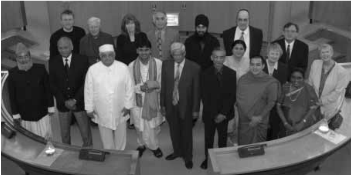
Harrow Inter Faith Council members in the local authority council chamber