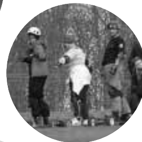
Liverpool Community Spirit members