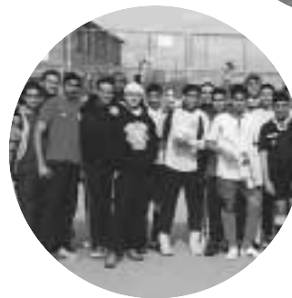
Blackburn Heats Volleyball Club