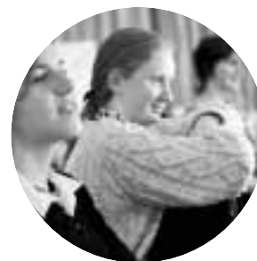
Faith Matters Conference, Scotland