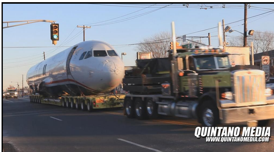
1549 on the way from the Hudson to the warehouse in Kearny, N.J.

I think most people will have to say WHAT A YEAR 2010!!!