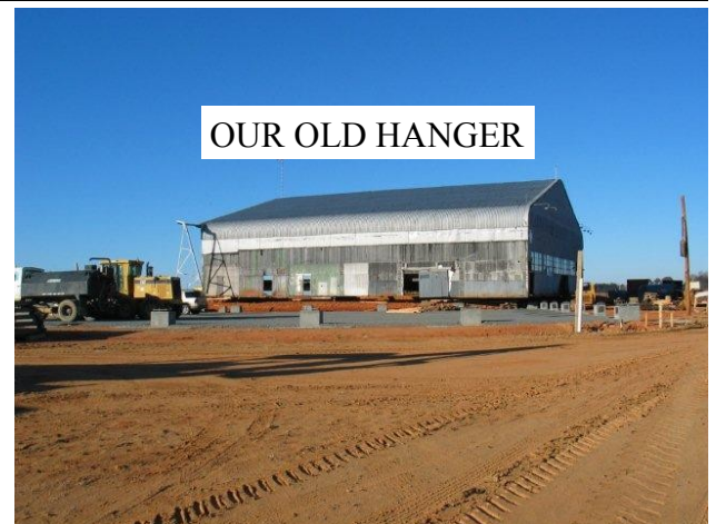
OUR OLD HANGER