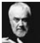
Gianluigi Gelmetti Chief Conductor and Artistic Director