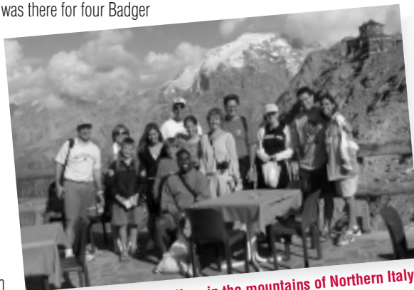
The Badgers spent time in the mountains of Northern Italy.

Their games behind them, the Badgers spent the final three days of the trip in Rome, where they saw the ancient ruins of the historic city, the Coliseum and the Vatican including an audience with Pope John Paul II.