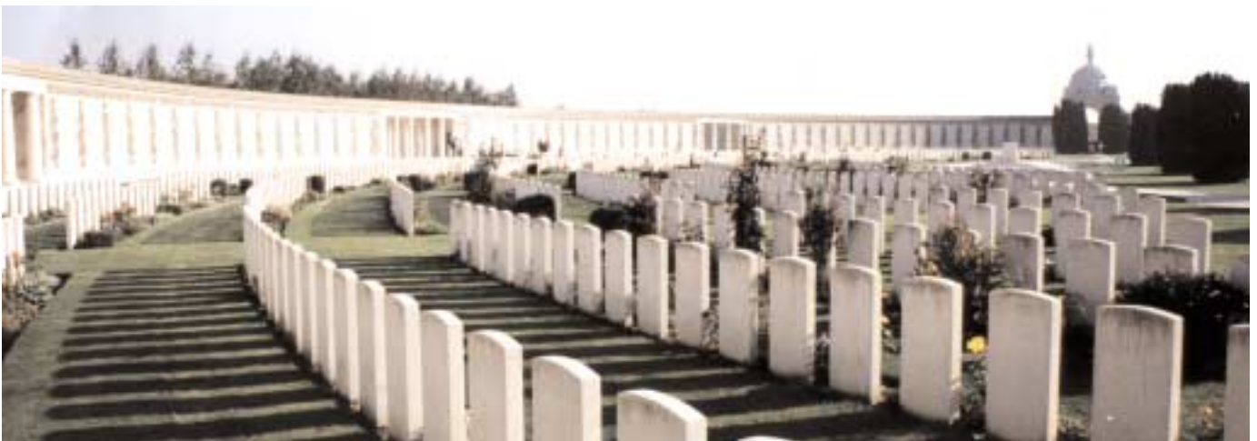
A section of the Tyne Cot Memorial, skirting the north-eastern boundary of Tyne Cot Cemetery

The Memorial, designed by Herbert Baker and with sculpture by F. V. Blundstone, is a semicircular flint wall 4.25 metres high and over 150 metres long, faced with panels of Portland stone on which are carved nearly 35,000 names of those who have no known grave. There are three apses and two rotundas: the central apse forms the New Zealand Memorial and bears the names of nearly 1,200 officers and men who gave their lives in the Battle of Broodseinde and in the Third Battle of Ypres (Passchendaele) in October 1917; the other two, as well as the rotundas and the wall itself, carry the names of United Kingdom dead who fell in the Salient between the 15 August 1917, when the Battle of Langemarck began, and the Armistice, in the Third and Fourth Battles of Ypres. Two domed arched pavilions mark the ends of the main wall, each dome being surmounted by a winged female figure with head bowed over a wreath.