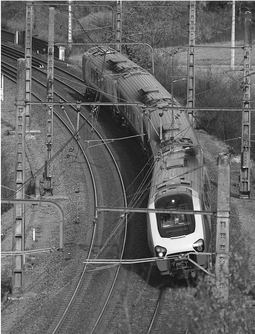
Virgin Trains' Super Voyager