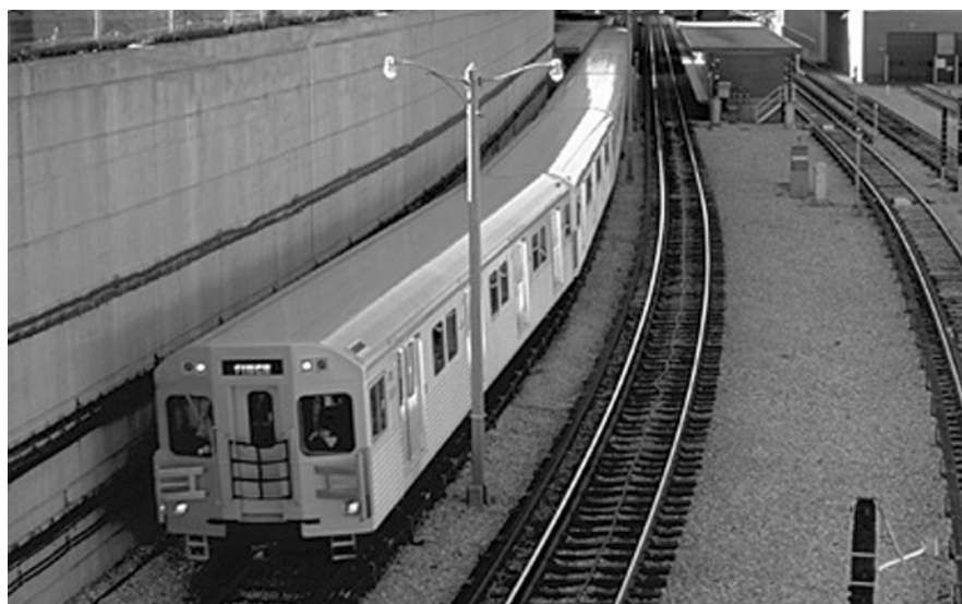
Bombardier T1 on Toronto subway

In Brazil, Bombardier operates primarily in São Paulo State where it employs some 100 people. In the Brazilian market, the company is participating in the São Paulo integration project and in the São Paulo Line 5 metro project. It is also active in the service market where it is jointly maintaining 30 trains manufactured in Spain—with electric and propulsion equipment developed and manufactured by Bombardier in Spain. The company also has vast experience in overhauling and modernizing rolling stock for the passenger and freight markets. These refurbishments are done at its Hortolandia works in São Paulo State.