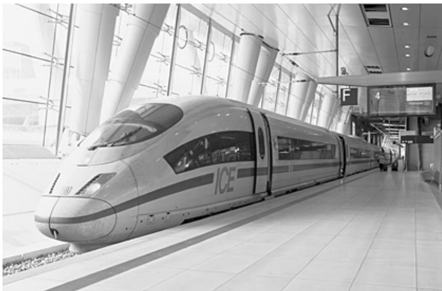
ICE 3 in Germany