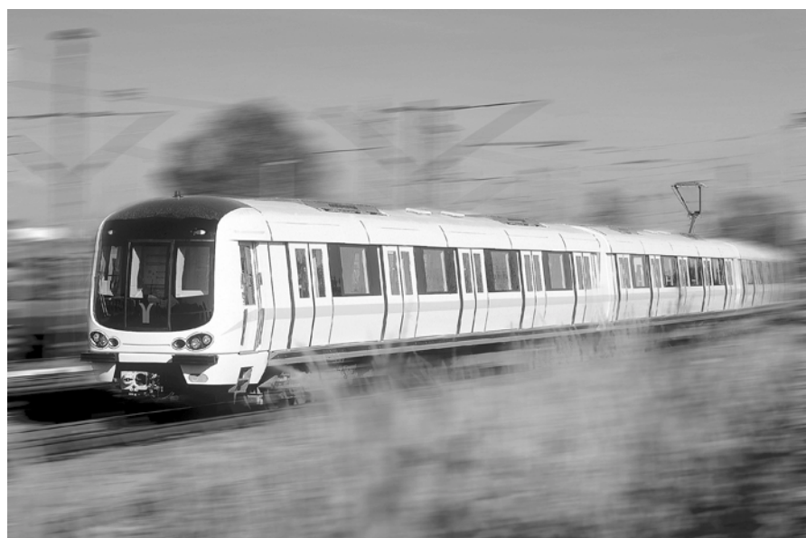
MOVIA metro cars for Guangzhou, China

Growing, thriving cities are often the hub of a strong society. They generate activities and industry far beyond the city limits. Communication is vital to maintain the momentum of growth and development. Major population centres with industrial and political power need to be efficiently linked with other cities. Intercity rail operation offers a perfect