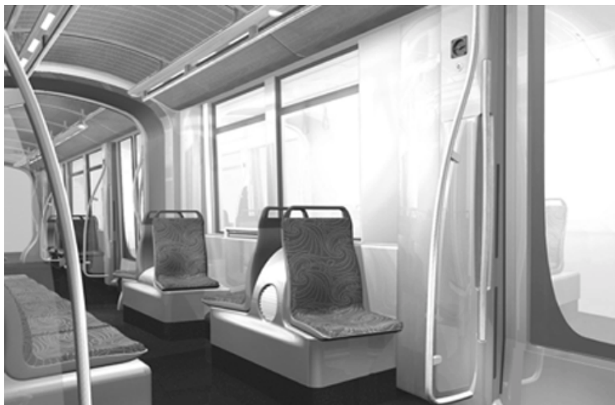
Interior of FLEXITY Outlook

Bombardier’s Dandenong plant has been manufacturing trains and trams for railways in Australia for over 30 years. In addition, the company has a joint-venture plant in Maryborough, Queensland, that has built hundreds of carriages for a number of projects. Within Australia, Bombardier boasts significant engineering and design support for regional projects. Backed by a skilled employee base of over 200, Bombardier is working on manufacturing or service contracts in Queensland, New South Wales, Western Australia and Victoria. For example, in 2002, the Victoria State Government and V/Line awarded a contract to provide rolling stock for regional services. This was a follow-on contract to an order for 9 two-car DMUs and a 15-year maintenance agreement.