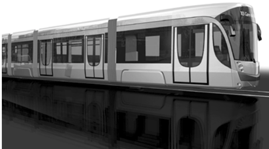
FLEXITY Outlook tram for Brussels

In India, Bombardier has a modern, environment-friendly works in Vadodara where it builds converters and electrical components for railways in India. Vadodara is also home to the Software Development Centre, developing state-of-the-art traffic control systems and software for the entire organization.