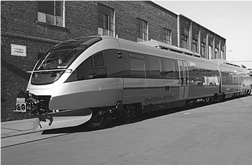
Norway's Class 93 TALENT