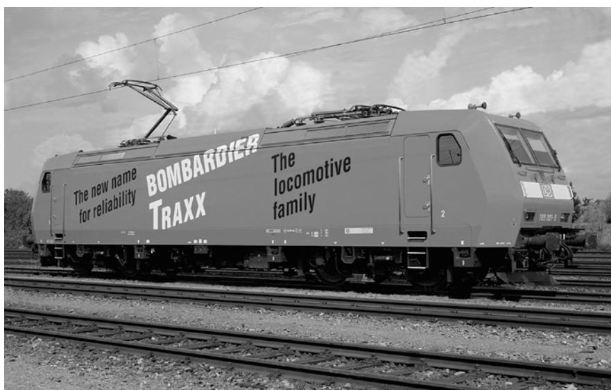
Bombardier TRAXX Class 185 becomes first locomotive with European environment management and auditing certificate (Bombardier Transportation)

TRAXX locomotives have common and standardised modules including: