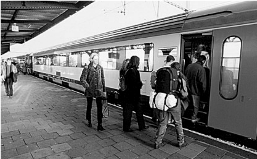
Passenger coach I11 in Belgium