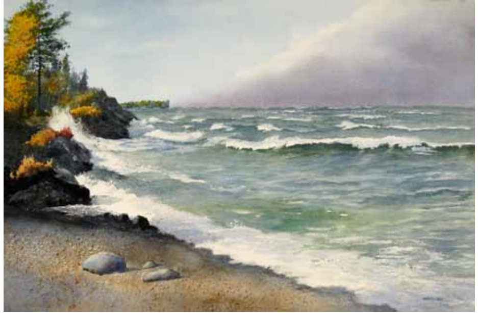
Watercolor artist Bill Hamilton has created a new print for our 2011 Summerfest pledge drive. Keweenaw Coast portrays a sandy beach along a rocky coastline of the Keweenaw Peninsula, with autumn colors accenting a stormy Lake Superior. For a pledge of $180, this thank-you gift can be yours. (FMV $40)

This will save Public Radio 90 about $1,200 per month in electrical costs and will extend the life of our broadcast tubes by nearly 35%. Listeners currently using digital HD receivers will still be able to hear Public Radio 90 via the analog signal. Once we launch our news/info and classical music channels we will put the digital HD signal back on the air.